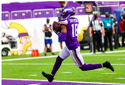
Vikings rookie WR Justin Jefferson became the fifth rookie in the Super Bowl era to record 1,000 receiving yards in a season and only the sixth rookie to total 1,000 or more yards in the first 12 games of a season in NFL history in Week 13.

Jefferson put together arguably the best season by a rookie receiver in the Super Bowl era in 2020, breaking an 18-year-old rookie receiving record as he finished the year with 1,400 yards en route to Pro Bowl and All-Pro honors. He became just the second player since the merger to post seven 100-yard receiving games as a rookie and his 87.5 receiving yards per game rank second-most by a rookie in the history of the league. The fifth receiver drafted in 2020, Jefferson set Vikings rookie records for receiving yards (1,400), receptions (88) and 100-yard games (7), passing the marks established by Hall of Famer Randy Moss during his 1998 Offensive Rookie of the Year campaign.