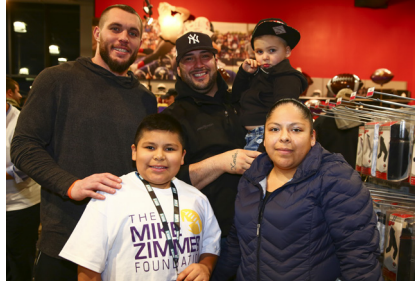
Harrison Smith and other teammates joined 25 children from Children's Hospitals and Clinics of Minnesota for a holiday shopping event at DICK'S Sporting Goods hosted by the Mike Zimmer Foundation in 2019.

Smith, a five-time Pro Bowler, finished the 2020 season with 89 tackles and tied a career high with five interceptions. Smith's 28 career interceptions rank seventh-most in franchise history while his 859 tackles are the third-most by a Vikings defensive back in team history.