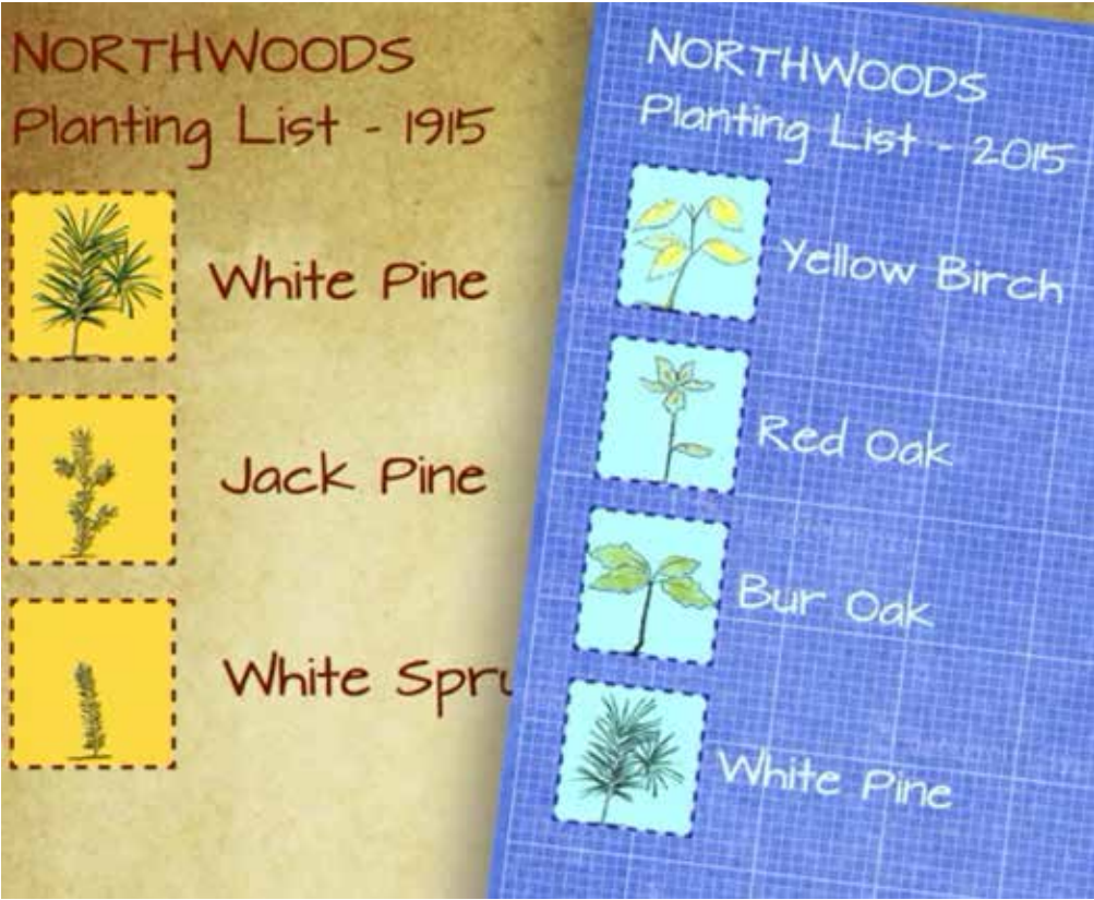
Adjusting post-harvest planting mixes to include more of those native tree species that are projected to thrive under future climate conditions may help maintain healthy forests into the future (Credit: WCS).

The Nature Conservancy, US Forest Service, the State of Minnesota and two local counties are consulting future vegetation models and range maps for trees and songbirds to design climate-informed tree plantings in Minnesota’s Northwoods. Traditionally, conservation efforts in the region have focused on re-foresting logged areas with boreal conifers. However, research suggests that these species are less likely to persist as the region warms and dries. The project is taking proactive action to help maintain a healthy forest ecosystem by revising their planting mix to include more native species that are projected to thrive under warmer and drier conditions, and using seeds sourced from warmer areas at lower elevations and latitudes.