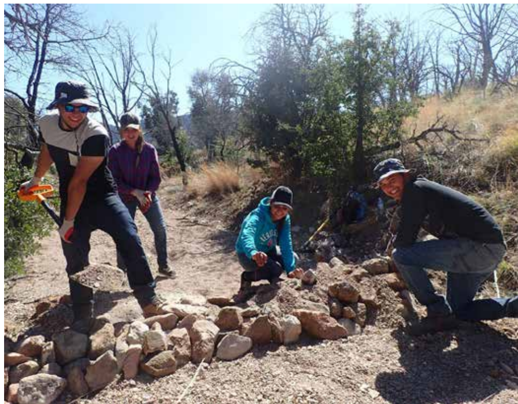
Erosion control structures reduce erosion damage during rain events after intense fires that may become more common as climate changes.

The Sky Island Alliance and US Forest Service are installing low-tech erosion control structures (e.g., one-rock dams and rock-based structures called 'Zuni bowls') in watersheds of the Sky Island region of Arizona that have recently burned or have a high risk of experiencing unusually large wildfires as the climate changes. These structures are designed to slow surface runoff and the movement of soils downhill and downstream. They also trap rainfall and retain soil moisture, creating pockets on the landscape that are less likely to burn.