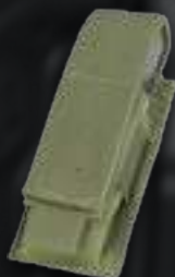
MA32-Single Pistol Mag