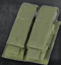
MA23-Double Pistol Mag Pouch