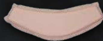
THROAT GUARD PANEL