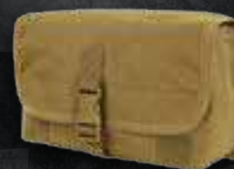
MA11-Modular Gas Mask Pouch

Pockets – Available in Black, Coyote and OD / *Custom Colors available for additional costs