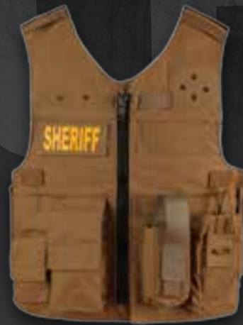
FRONT OPENING RAID SEWN-ON-POCKETS

L-R (as wearing): Radio, Flashlight, Utility and Handcuff