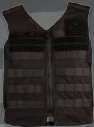
FRONT OPENING RAID MOLLE

L-R (as wearing): Handcuff, Radio, Flashlight, Small Utility, Large Utility