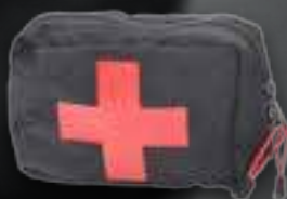
Med Kit Pocket