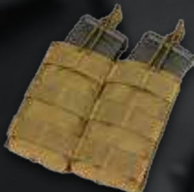
MA19-DBL Mag Open Top M4/M16/AR14