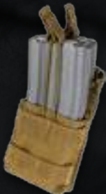
MA42-Stacker M4/M16 Mag