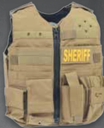
FRONT OPENING RAID SEWN-ON-POCKETS

L-R (as wearing): Handcuff, Radio, Flashlight, Small Utility, Large Utility