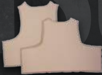
FRONT AND BACK TORSO PANELS

All panels are sonically welded in waterproof pad covers