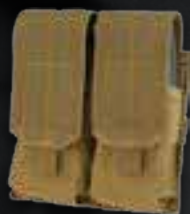
MA4-DBL Mag M4/M16/AR14