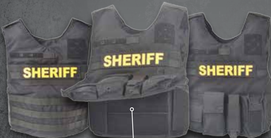
RAID TAC MOLLE

Standard Raid features with 3 Sewn-on-Pockets. L-R (as wearing): Large Utility, Flashlight and Radio