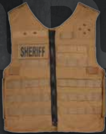
FRONT OPENING RAID MOLLE