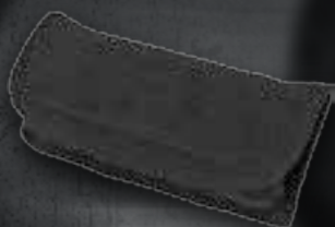
MA12-Shotgun Ammo Pouch