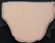
GROIN GUARD PANEL