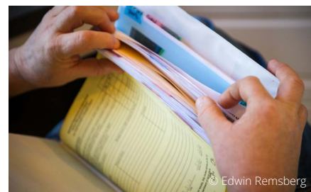
NATIONAL SUSTAINABLE AGRICULTURE COALITION

Contact the AMS GAP Program or your State Department of Agriculture 👉 Telephone: (202) 720-5021 Email: SCAudits@usda.gov