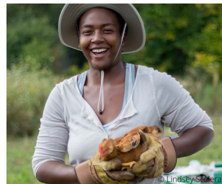
NATIONAL SUSTAINABLE AGRICULTURE COALITION