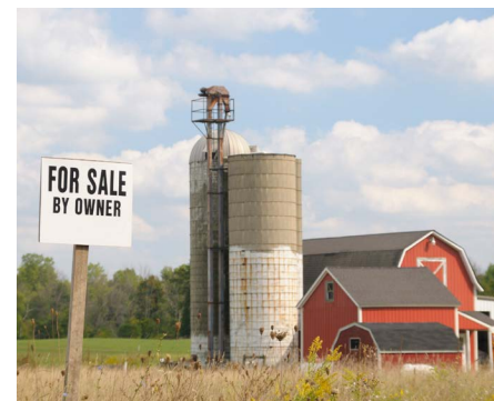
NATIONAL SUSTAINABLE AGRICULTURE COALITION