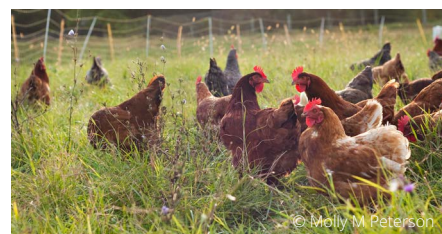
NATIONAL SUSTAINABLE AGRICULTURE COALITION