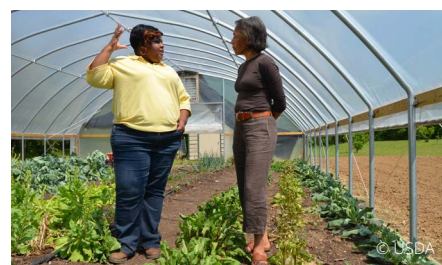
NATIONAL SUSTAINABLE AGRICULTURE COALITION