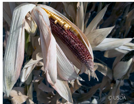
NATIONAL SUSTAINABLE AGRICULTURE COALITION

Visit your local FSA office to fill out an application, which must be submitted by the closing date for the crop in your state. https://offices.usda.gov