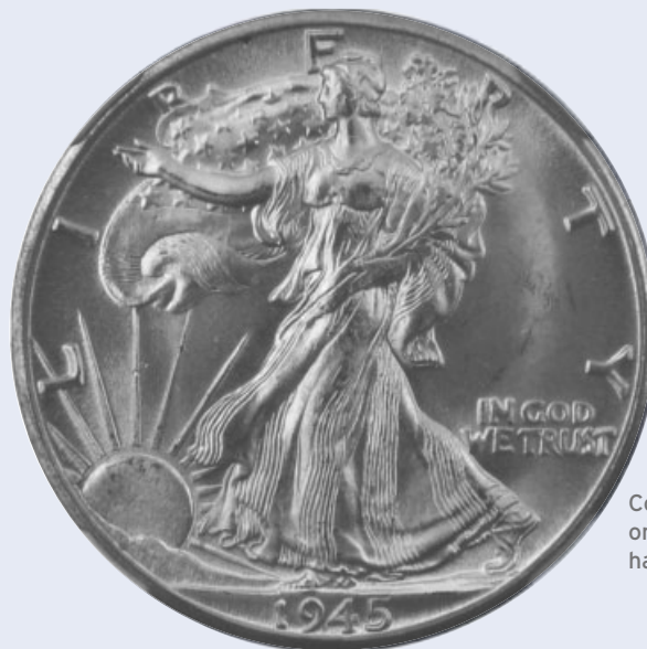
Columbia depicted on a 20th century half-dollar coin.

While her life was short, Phillis Wheatley contributed much to American history and literature. Her poetry is considered part of the great body of American culture.