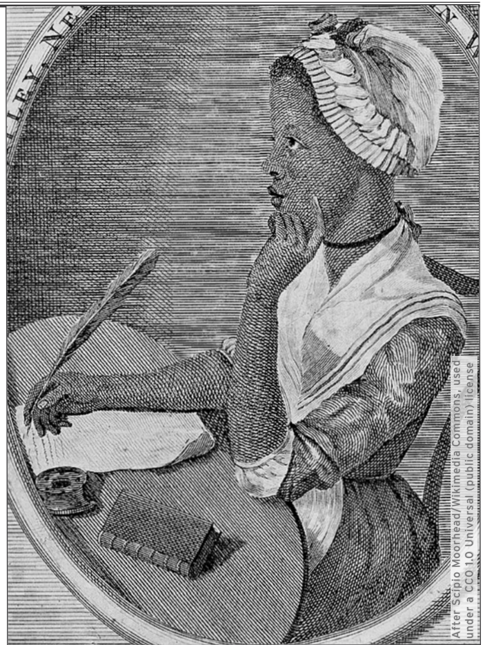
This 1773 engraving of Phillis Wheatley appeared in her book Poems on Various Subjects, Religious and Moral . It is also the first known portrait of an individual American woman of African descent.

(NOTE: In her poetry, Wheatley used English spelling conventions of the time. “Gulph” meant “gulf,” and “wou’d” meant “would.”)