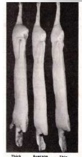
The next criteria concern carcass length, backfat thickness at the last rib and loin muscle area. These are usually adjusted to a 170 pound carcass weight (approximately 230 pounds live weight) for comparative purposes. Therefore, if the carcass is heavier than 170 pounds, then it will be adjusted back and carcass measurements estimated based on what they measure now. Heavier hogs will often have more fat and could be docked accordingly while lighter hogs may not have as much muscle. This ensures that all hogs can be compared to each other fairly.