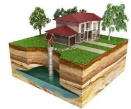
Figure 2. Call card