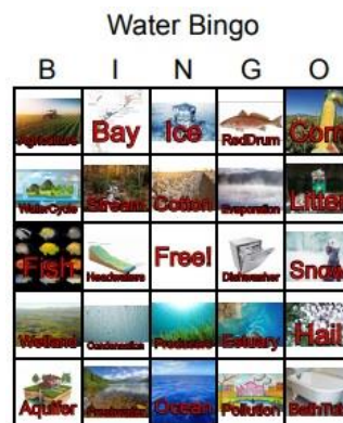
Figure 1. Game card