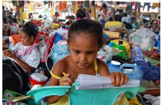
Evacuation center. Philippines.