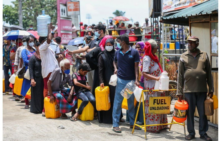
March 21, 2022, Colombo, Western Province, Sri Lanka: People stand in a long queue to buy kerosene oil to use in their homes, at a fuel station in Colombo. The island has been severely hit by the lack of foreign exchange, resulting in severe shortages in food, fuel and imported goods.

Sri Lanka has been mired in economic turmoil and declared an external debt suspension in April 2022. The Government's unsustainable policy decisions and significant balance of payments challenges led to a deterioration of welfare and food security. Inflation soared as the Central Bank printed money to cover the