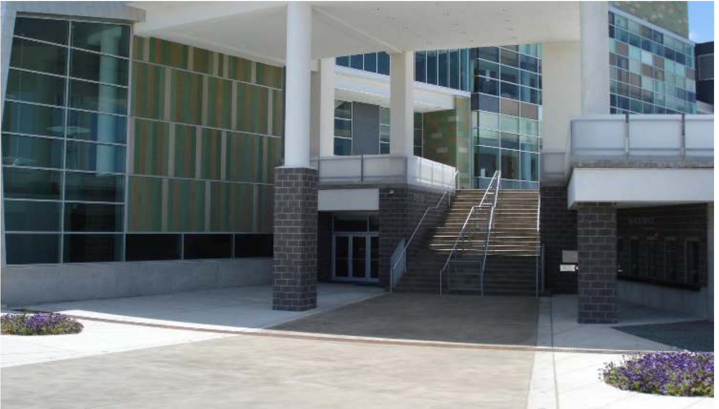
The Grand Staircase to main entrance of City Terrace on the right Rollins Lobby Doors are to the left of the stairs- for elevator access to Terrace