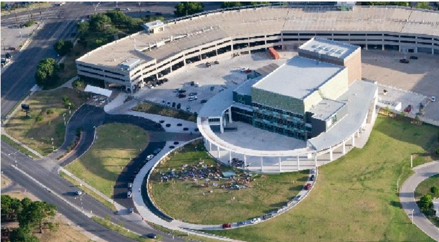
Aerial photo of The Long Center & Palmer Events Center Parking Garage