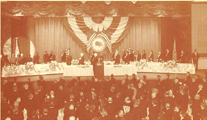
The playing of the National Anthem