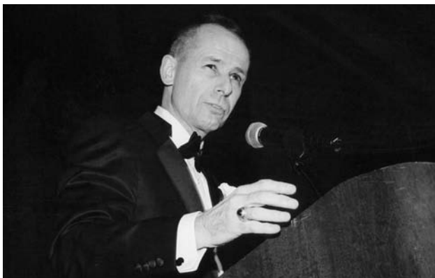
General Peter Pace, USMC (Ret.)