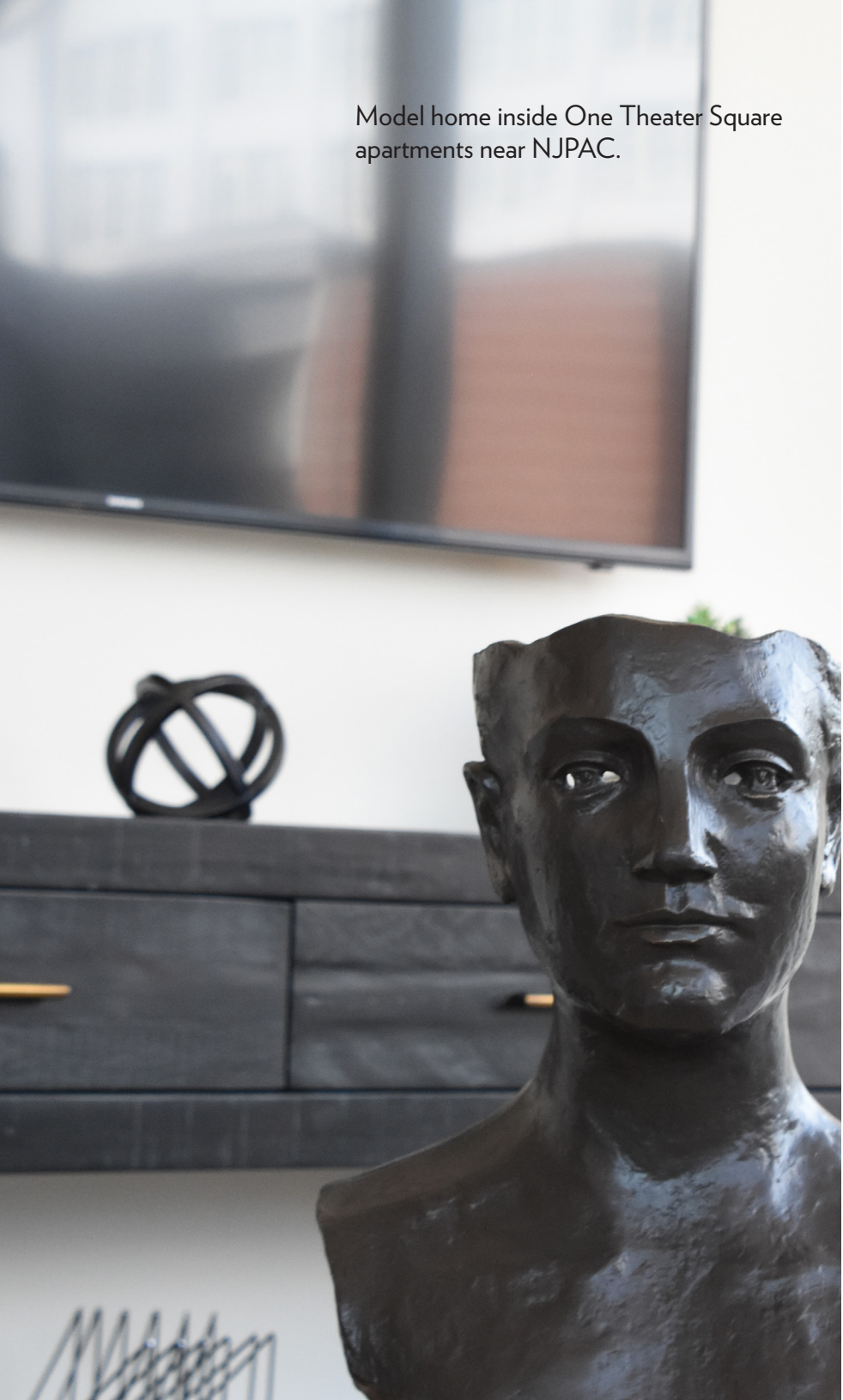
Model home inside One Theater Square apartments near NJPAC.