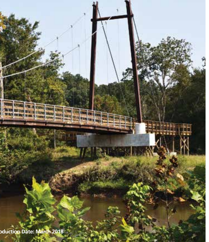
Production Date: March 2018

RALEIGH PARKS, RECREATION AND CULTURAL RESOURCES 919.996.3285 | parks.raleighnc.gov