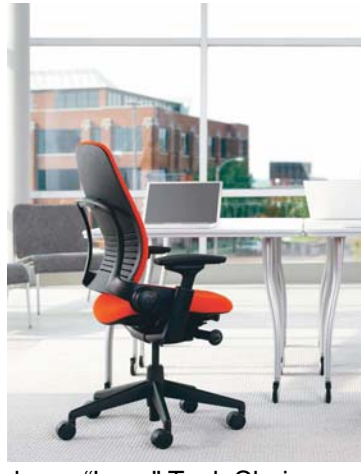
Steelcase "Leap" Task Chair