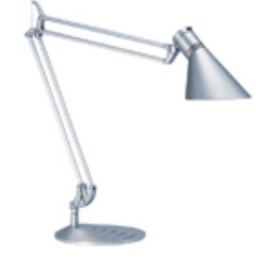
Diffrient Work Light II