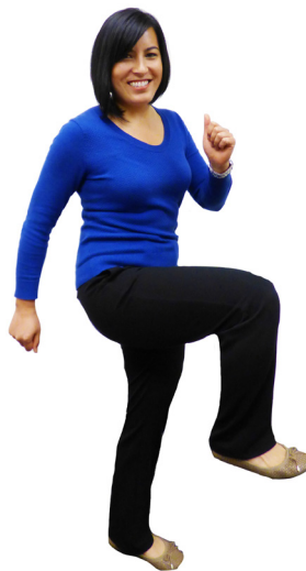
March in Place