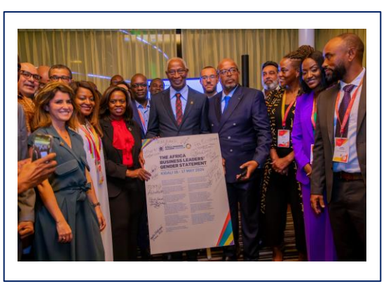
The Prime Minister of the Republic of Guinea, H.E. Amadou Oury Bah, presents the launch of the Gender Statement, signed by ABLC CEOs