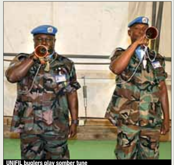
UNIFIL buglers play somber tune

Tragedy has struck the UN family in different ways. Be it a plane crash in Africa, a raid on UN offices in Afghanistan, an earthquake which leveled the headquarters in Haiti and the latest bombing of the UN compound in Nigeria, it has claimed lives or harmed the innocent.