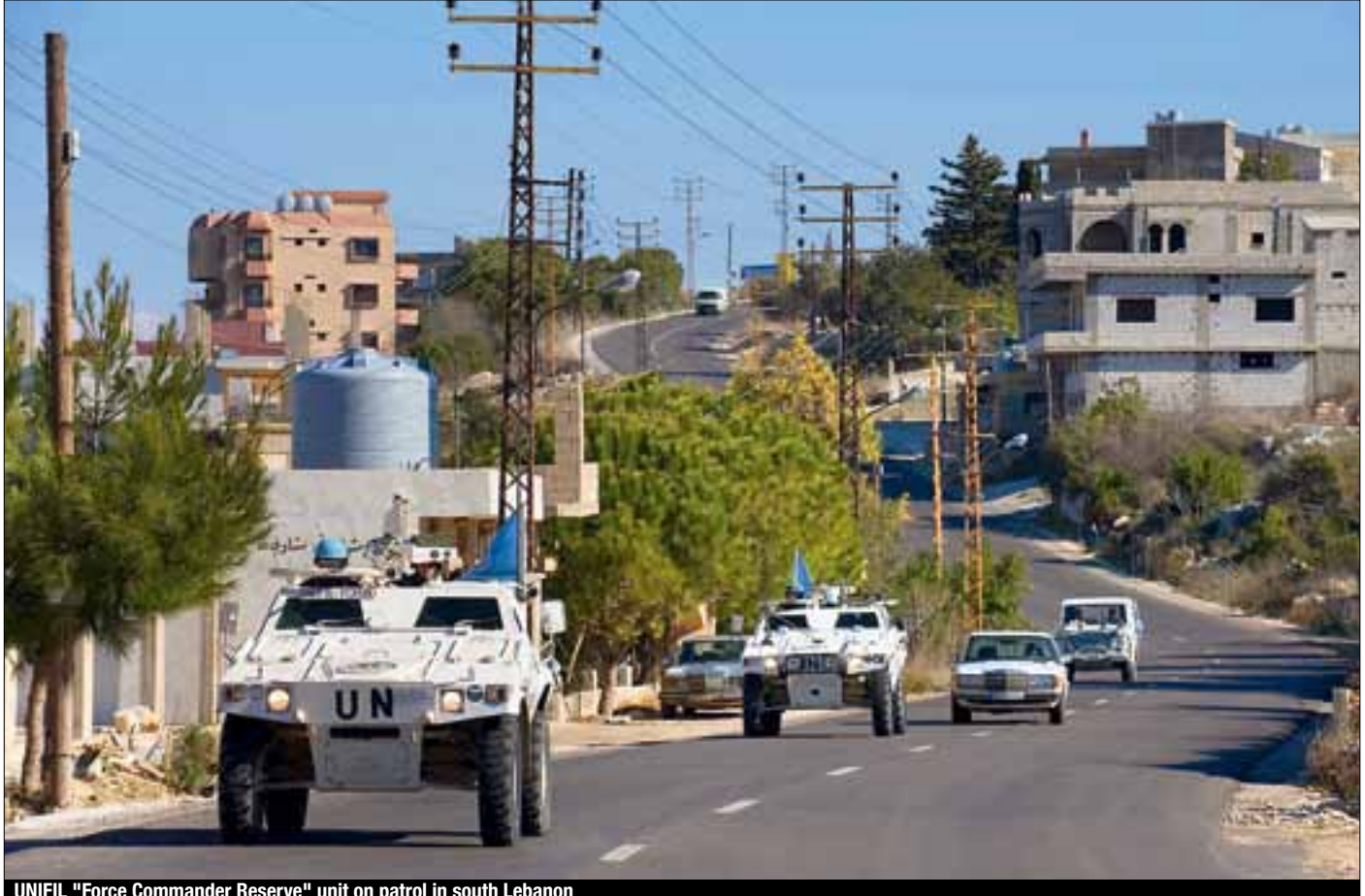
UNIFIL "Force Commander Reserve" unit on patrol in south Lebanon

He noted that while the LAF is fully deployed in the south it still needs to be provided with the necessary infrastructure and training to accomplish its tasks.