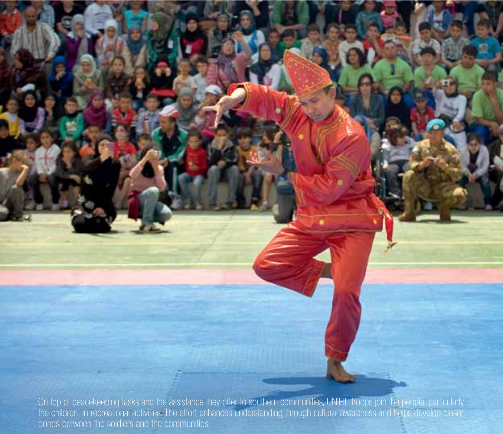
On top of peacekeeping tasks and the assistance they offer to southern communities, UNIFIL troops join the people, particularly the children, in recreational activities. The effort enhances understanding through cultural awareness and helps develop closer bonds between the soldiers and the communities.