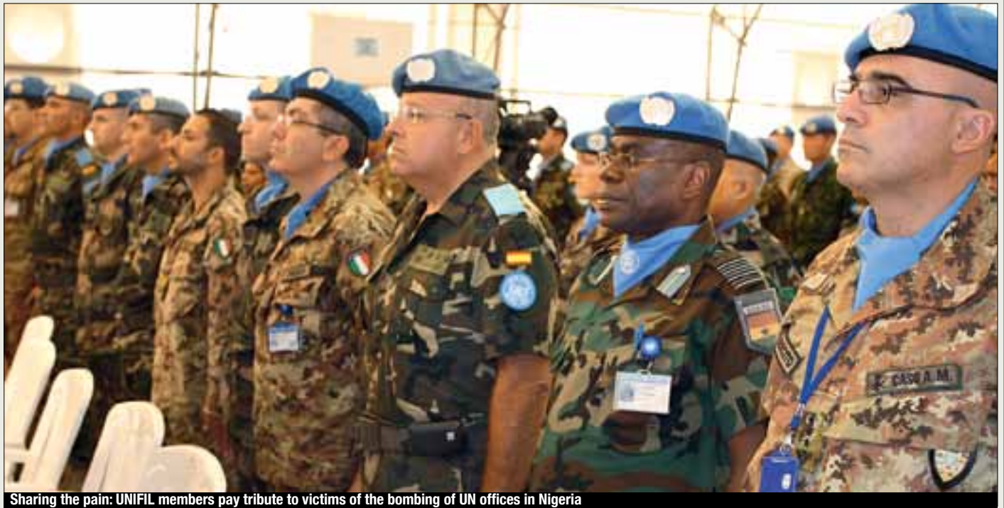
Sharing the pain: UNIFIL members pay tribute to victims of the bombing of UN offices in Nigeria

Yet, the UN presses ahead with its mission, keeping the peace or building on it in places, assisting the communities in need in others and working for humanity's development worldwide.