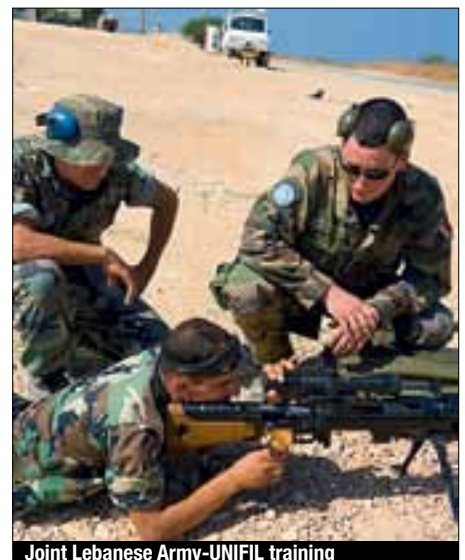
Joint Lebanese Army-UNIFIL training