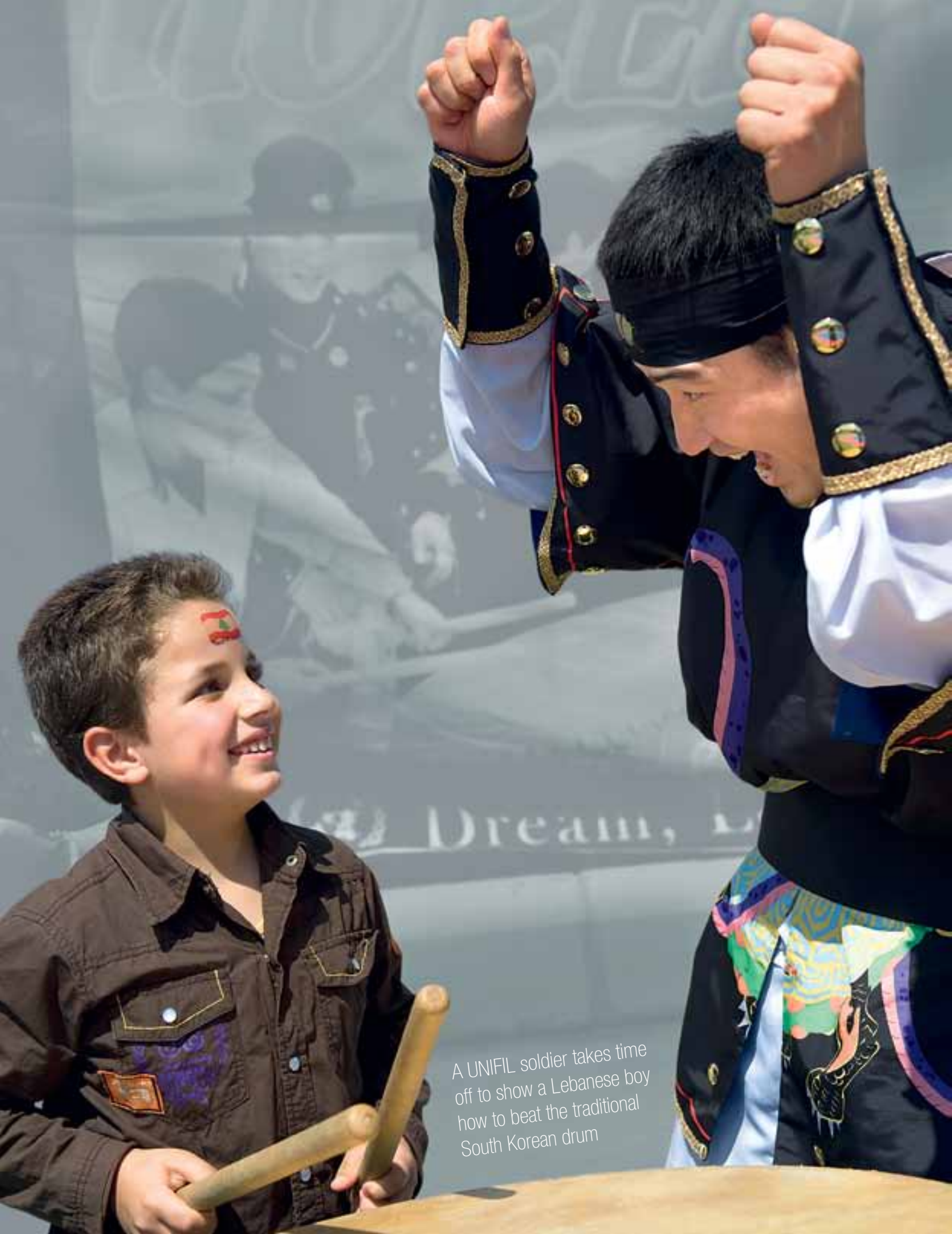
A UNIFIL soldier takes time off to show a Lebanese boy how to beat the traditional South Korean drum