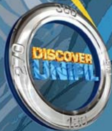
6 ASSISTING COMMUNITIES