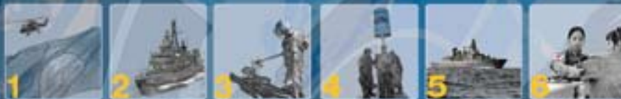
1 NAQOURA CAMP

These 10-minute documentaries provide a special insight into UNIFIL's activities and especially its peacekeepers. 9 episodes are planned, 6 of which have already been broadcast on Lebanese TV stations: NewTV, NBN and Tele Liban. Each new episode is announced through 30-second promotions broadcast days in advance. If you missed an episode, you can watch them on youtube, facebook and our new UNIFIL website.