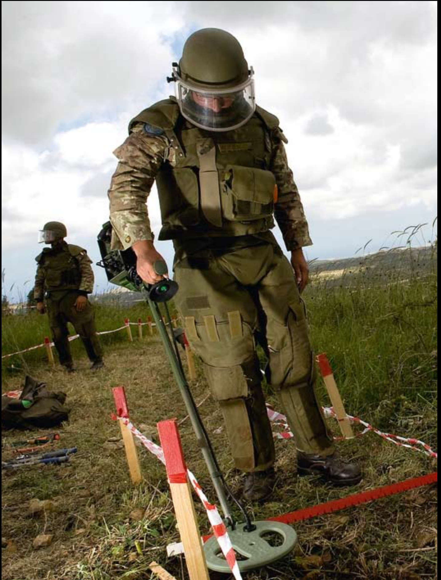
UNIFIL de-miner sweeps mine-infested area in south Lebanon