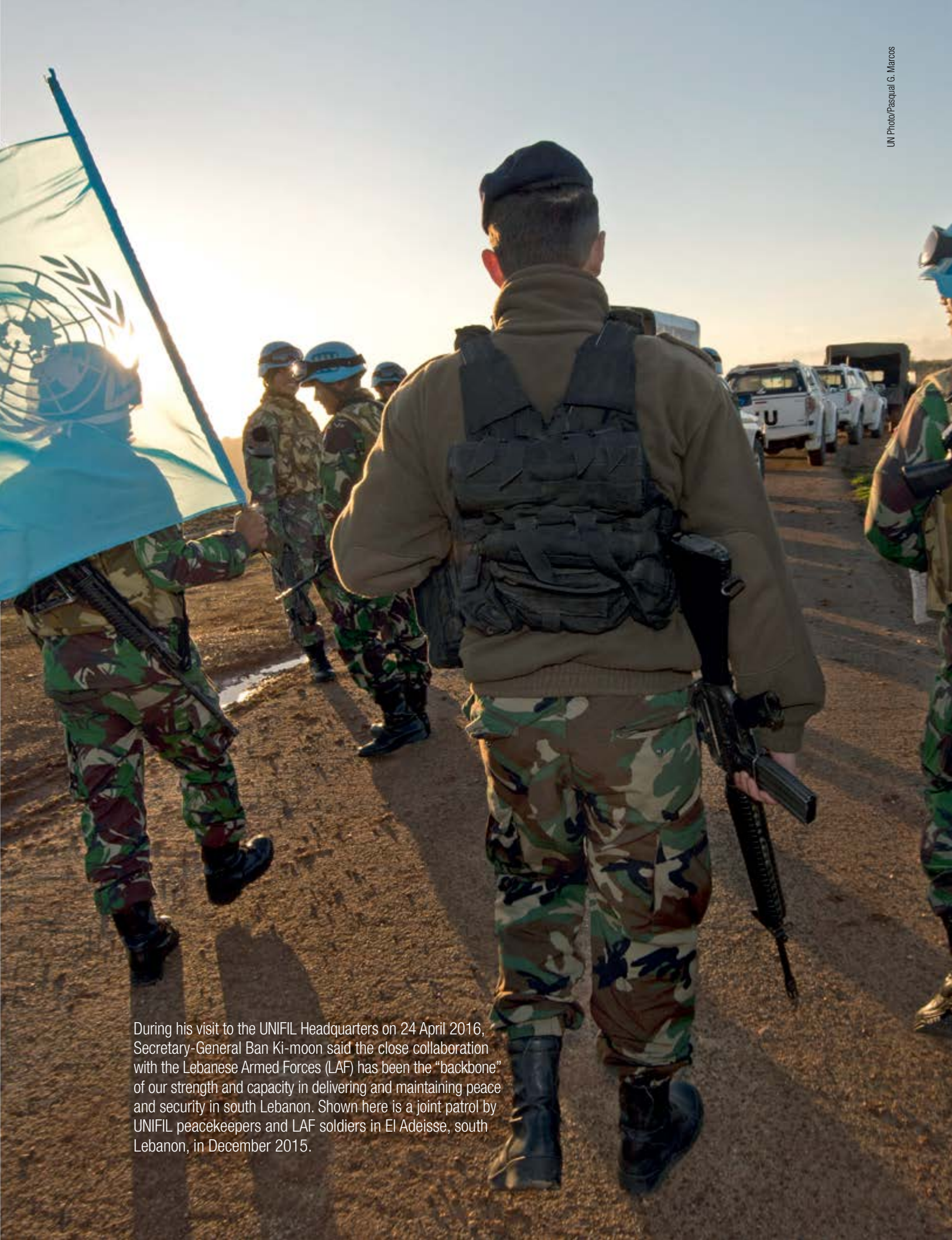
During his visit to the UNIFIL Headquarters on 24 April 2016, Secretary-General Ban Ki-moon said the close collaboration with the Lebanese Armed Forces (LAF) has been the “backbone” of our strength and capacity in delivering and maintaining peace and security in south Lebanon. Shown here is a joint patrol by UNIFIL peacekeepers and LAF soldiers in El Adeisse, south Lebanon, in December 2015.