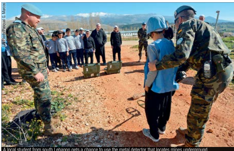
A local student from south Lebanon gets a chance to use the metal detector that locates mines underground.

One of the significant achievements of UNIFIL's de-mining work is the opening of safe lanes through minefields to reach the Blue Barrel points along the Line of Withdrawal with Israel, clearing 103,620 square metres.