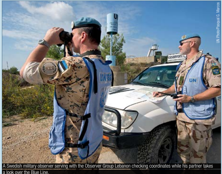
A Swedish military observer serving with the Observer Group Lebanon checking coordinates while his partner takes a look over the Blue Line.