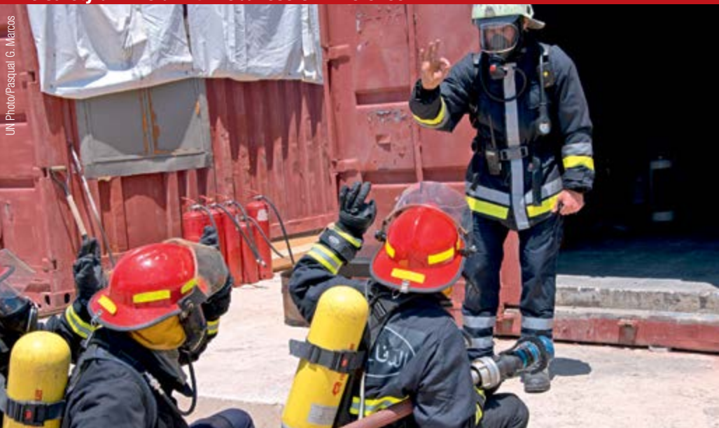
UNIFIL's Fire Safety Unit conducting a three-day training in Naqoura in collaboration with the Lebanese Civil Defence Centre in south Lebanon.

The Fire and Safety Unit of the United Nations Interim Force in Lebanon (UNIFIL) recently joined forces with Lebanese civil defence units in conducting a joint drill in the Nabatiyeh governorate as part of the UN mission's efforts toward capacity-building and supporting extension of State