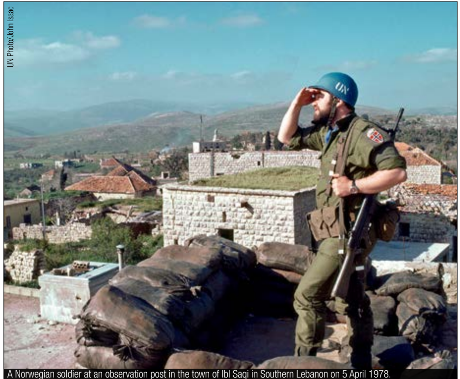
A Norwegian soldier at an observation post in the town of Ibl Saqi in Southern Lebanon on 5 April 1978.

"We did not live in barracks at that time; we lived inside the houses in the towns, and this