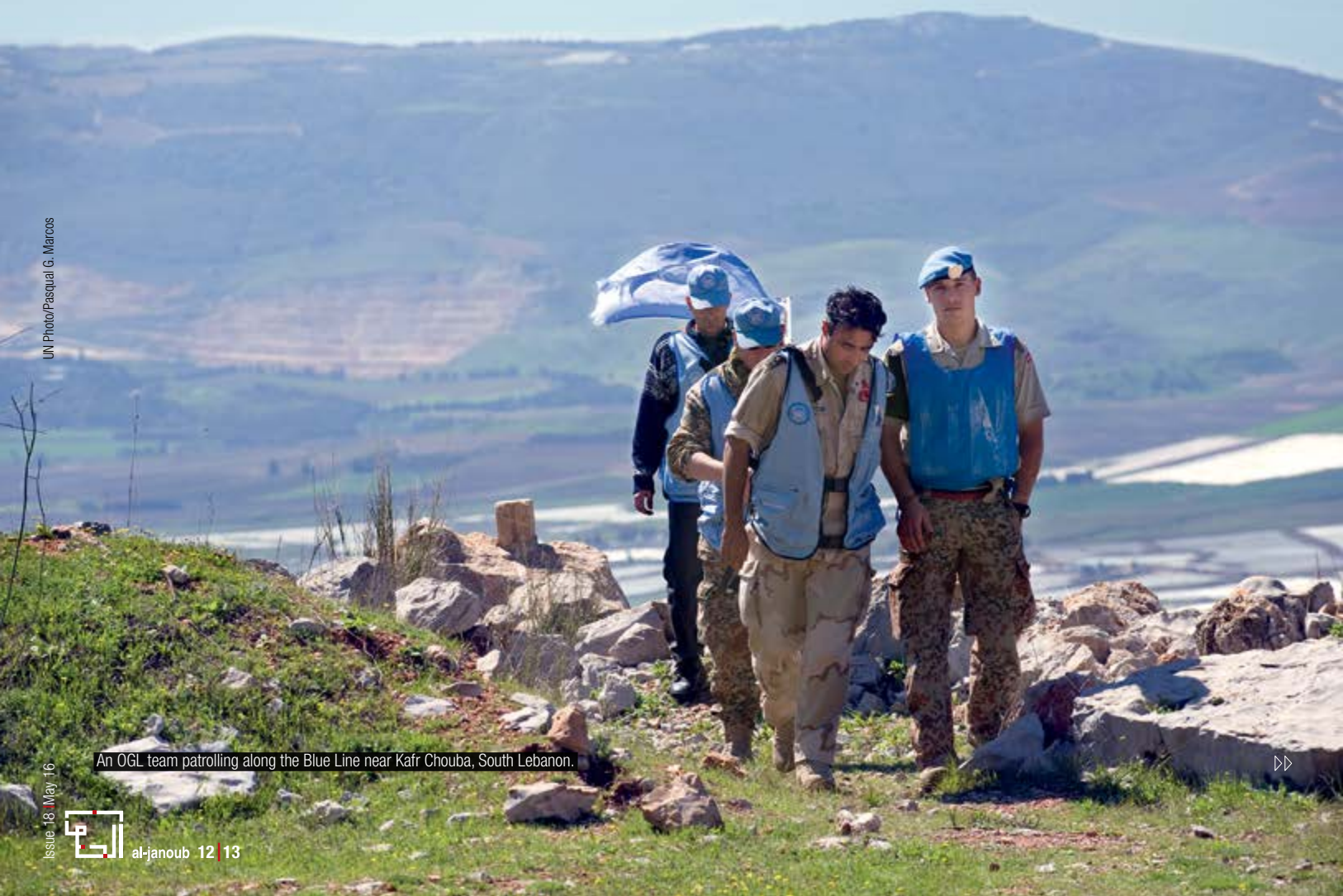
An OGL team patrolling along the Blue Line near Kafr Chouba, South Lebanon.

Disengagement Observer Force (UNDOF) in the Golan Heights and the UN Interim Force in Lebanon (UNIFIL). A group of observers remains in Sinai to maintain a UN presence in that peninsula. In addition, UNTSO maintains offices in Beirut and Damascus.