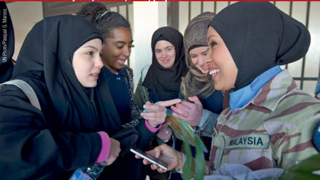
A UNIFIL Malaysian peacekeeper with a group of students in Deir Kifa, south Lebanon.

UNIFIL projects address some of the most pressing needs of the population and support local authorities while strengthening the links