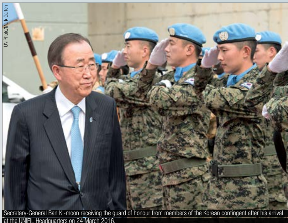
Secretary-General Ban Ki-moon receiving the guard of honour from members of the Korean contingent after his arrival at the UNIFIL Headquarters on 24 March 2016.