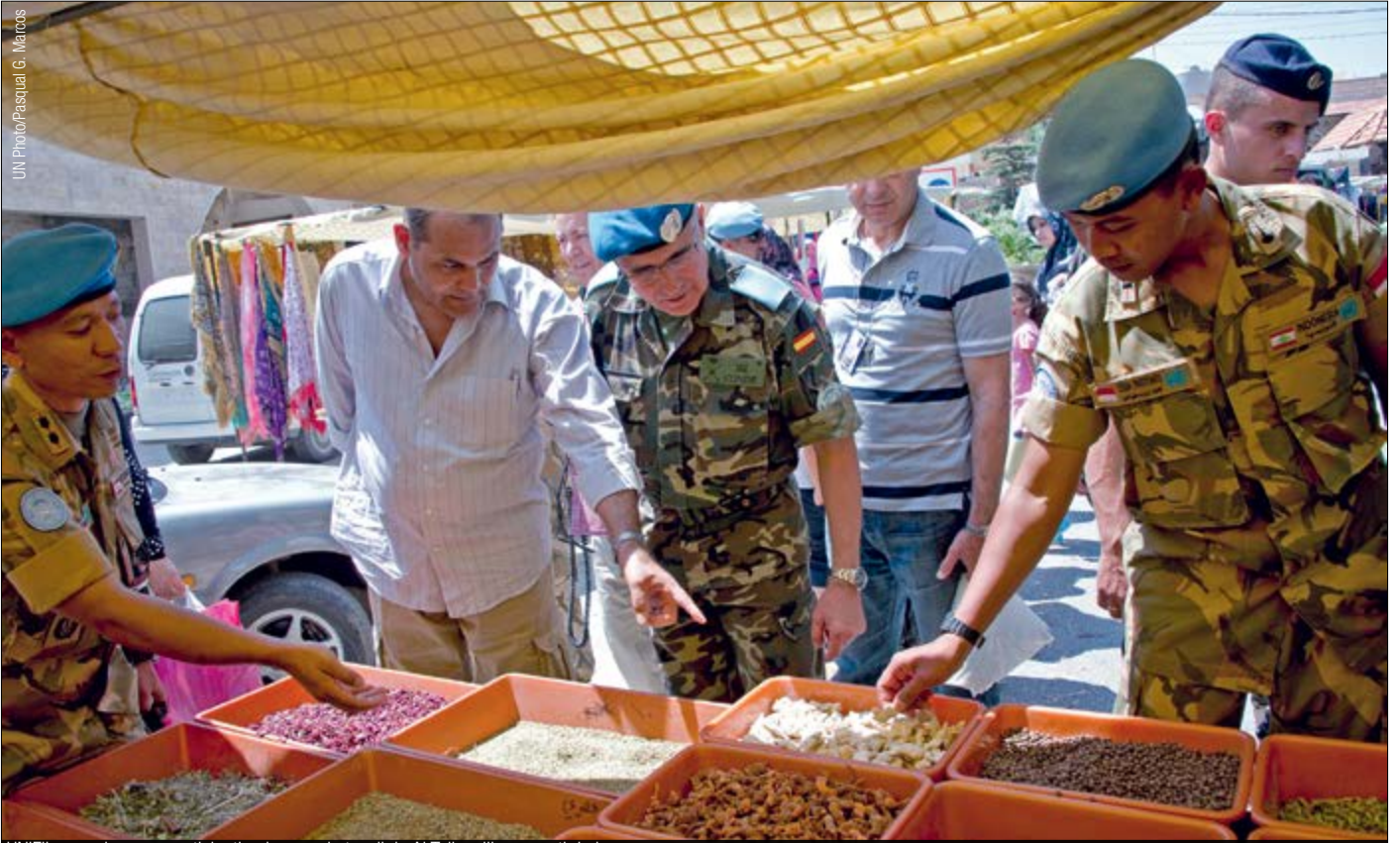
UNIFIL peacekeepers participating in a market walk in Al Taibe village, south Lebanon.