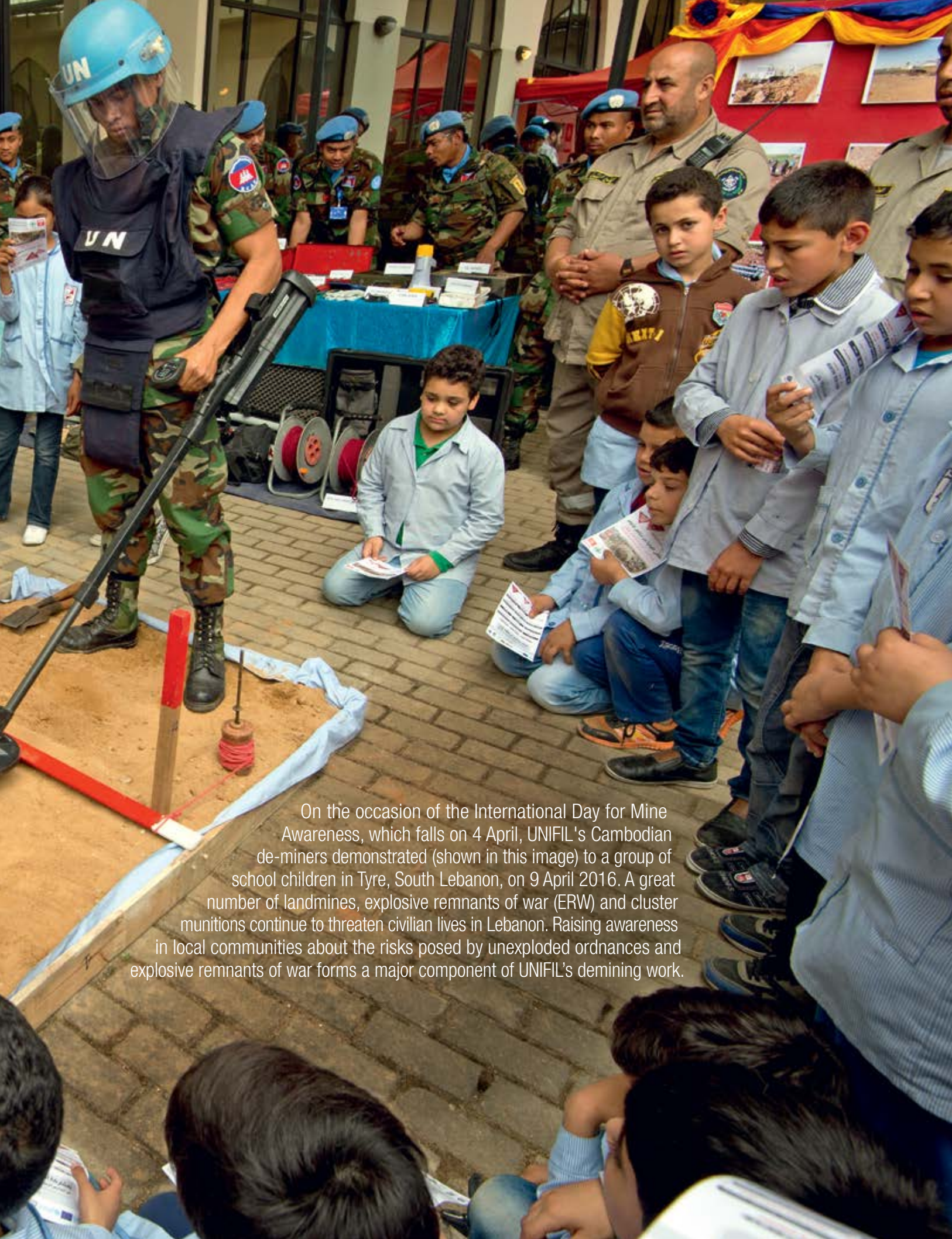
On the occasion of the International Day for Mine Awareness, which falls on 4 April, UNIFIL's Cambodian de-miners demonstrated (shown in this image) to a group of school children in Tyre, South Lebanon, on 9 April 2016. A great number of landmines, explosive remnants of war (ERW) and cluster munitions continue to threaten civilian lives in Lebanon. Raising awareness in local communities about the risks posed by unexploded ordnances and explosive remnants of war forms a major component of UNIFIL's demining work.