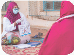
Public Health Nutritionist