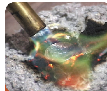
Under direct flame, a penny will melt before the Cellulose insulation burns

Cellulose insulation is easy and safe to install without all of the itching or non-recyclable waste.