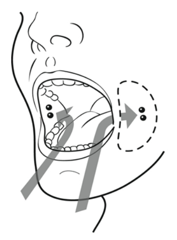
Figure A (2 tablets between your left cheek and gum and 2 tablets between your right cheek and gum).