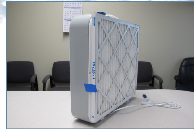
This simple fan-filter combination can reduce the amount of the tiny, harmful particles in the air.

Paper "comfort" or "dust" masks – the kinds you commonly can buy at the hardware store – are designed to trap large particles, such as sawdust. These masks generally will not protect your lungs from the fine particle in smoke.