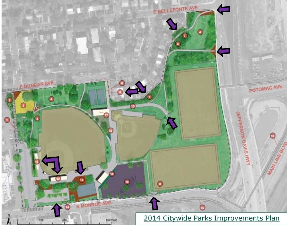
2014 Citywide Parks Improvements Plan