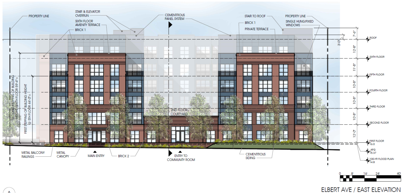
Figure 2 Exterior Elevation

DISCUSSION: The 2014 City’s Housing Master Plan “established a target of providing, preserving, or assisting 2,000 units from FY 2014 through 2025”. This 91-unit affordable project (with 63 net new unit) contributes to that target by preserving existing and creating new affordable rental opportunities, in addition to supporting the City’s commitment to meeting the Council of Government’s Regional Housing Initiative’s housing production goals. As such, the development program implements two Housing Master Plan goals: