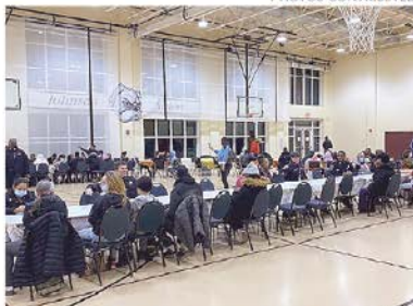
Guests and volunteers enjoy the annual Friendsgiving dinner Nov. 22 at Charles Houston Recreation Center.