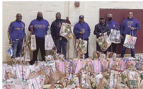
Volunteers from the Alexandria chapter of Omega Psi Phi prepare to give out Thanksgiving dinner baskets to families in need as part of the annual Friendsgiving dinner event Nov. 22 at Charles Houston Recreation Center.

Several local agencies and businesses providing turkeys and hams for local families. in your annual Friendsgiving dinner party."