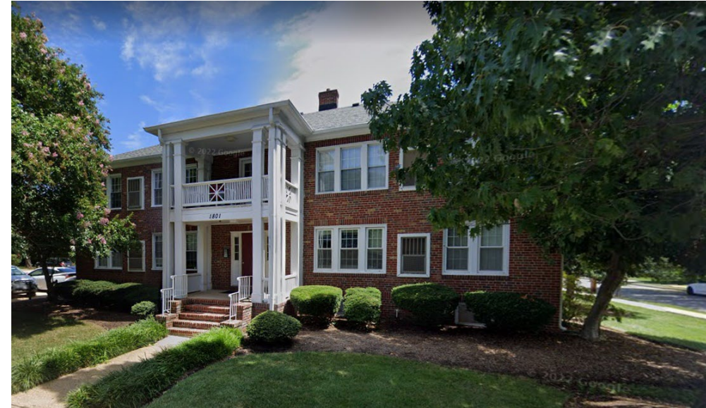
Alexandria Square condominiums, Del Ray

The purpose of this initiative is to identify land use patterns, such as the mix of uses and building types found in historic neighborhoods (Del Ray, Rosemont, Old Town, and Parker-Gray) that can no longer be built under existing zoning. Characteristics of historic land use patterns that are desirable would be identified along with recommendations for changes to the Zoning Ordinance to allow these patterns to be considered.