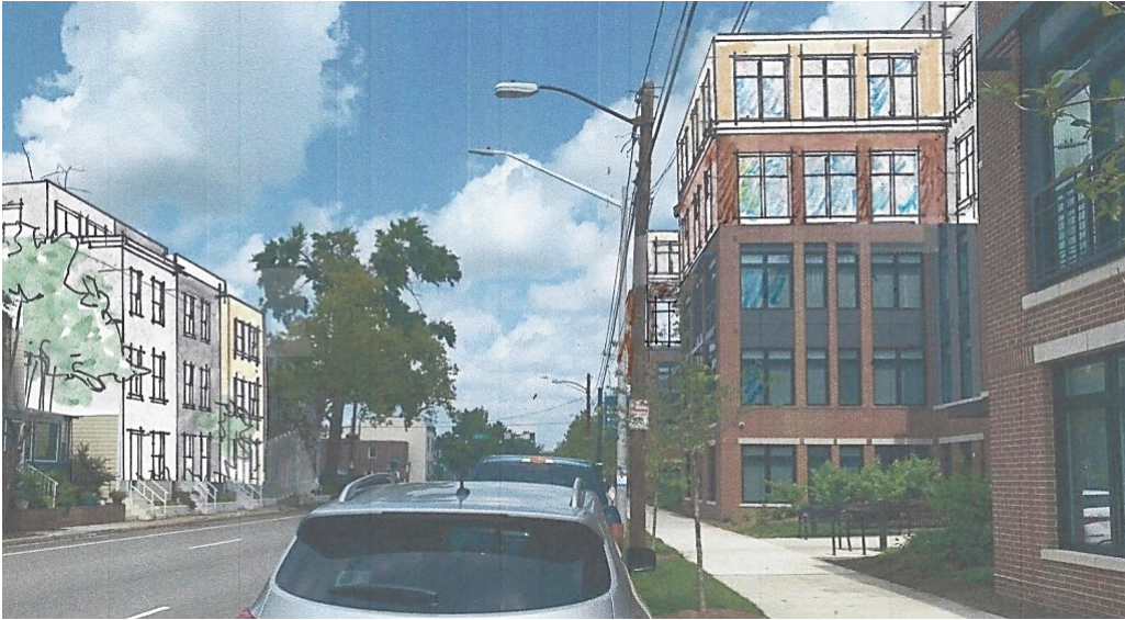
Visual depiction of “bonus height.”

This initiative would incentivize more use of Section 7-703 of the zoning ordinance that allows additional height in new residential projects in exchange for affordable housing. Current law allows the provision to be used in areas with a height limit greater than 50 feet, and the proposal is to allow it to be used in areas with height limits of 45 feet or more. A goal of the initiative is to expand housing choices and dispersion throughout more areas of the City in a manner that is harmonious to the surrounding physical context of the community.