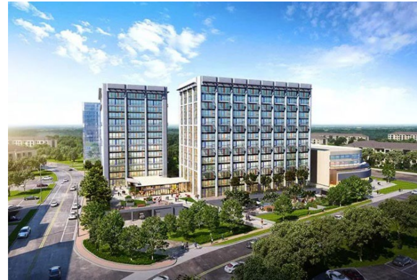
A rendering of the office-to-apartment conversion project at the Park Center complex in Alexandria.