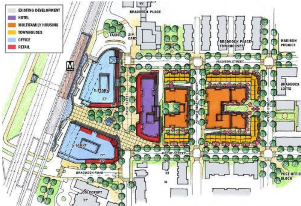
Illustration from the Braddock Metro Neighborhood Plan

This initiative will review existing permitted densities within the walksheds of existing and planned Metro stations and BRT stations. It would further analyze any existing barriers currently in place that limit increased densities around transit stations.