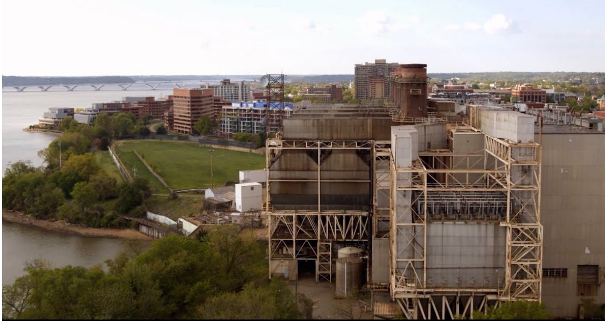
Potomac River Generating Station, Old Town North

Coordinated Development Districts(CDDs) establish the zoning for large tracts of land planned for redevelopment. The purpose of this initiative is to ensure that the creation of affordable housing is supported in each new CDD. The recent CDD for the Potomac River Generating Station site is a model that staff will examine for potential application in future CDDs.