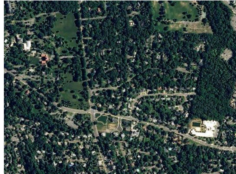
A neighborhood in Alexandria composed of single-family detached homes