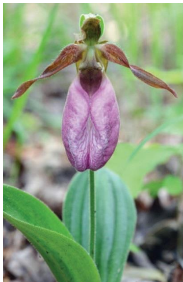
Pink Lady's-slipper ( Cypripedium acaule ).

This plant was once common in Alexandria in upland Oak-Heath Forest and successional Virginia Pine forests. Today, only a few remaining individuals are known from very few sites in the City.