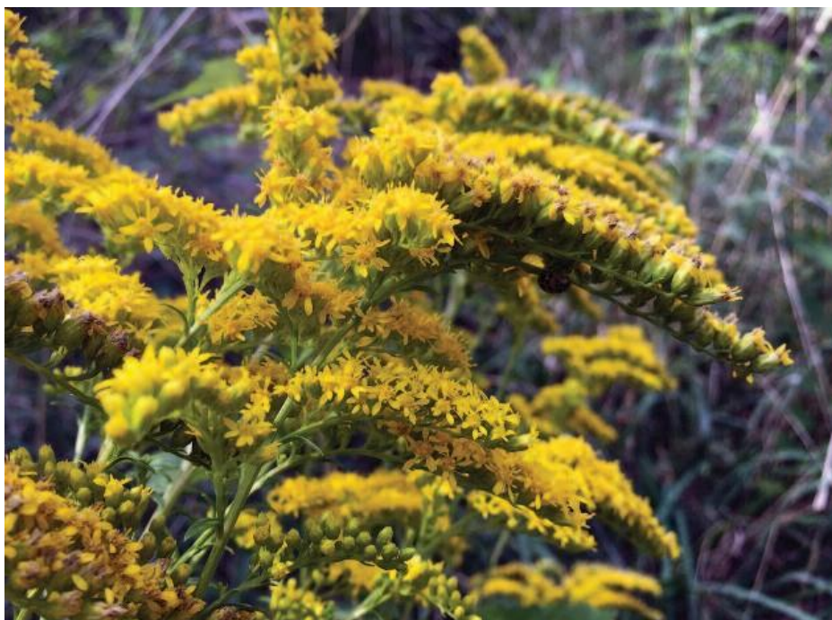
Goldenrod ( Solidago spp.).

Combining the total numbers of historical, imperiled, and uncommon to rare flora (76.13% of the City’s total native flora), the outlook for the future sustainability and preservation of much of Alexandria’s native flora and biodiversity is impaired. A moratorium on any further net loss of natural lands on City owned parkland, waterways, and open space, and continued natural lands management and stewardship will go a long way towards halting this trend and stabilizing dwindling, fragmented populations.