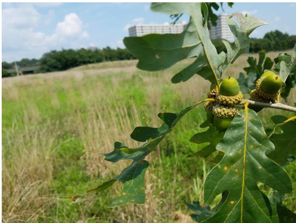
White Oak acorns, or mast, growing on a newly planted tree in fall 2018, at Ben Brenman Park.

Upon adoption of the Natural Resource Management Plan (NMRP), the Natural Resources Division of RPCA will develop plans outlined in this document, prioritizing strategies and developing timelines and fiscal implications for budget planning. Staff and partners will be engaged to assist in completing the objectives outlined here, and the plans will be shared with the public as part of transparency and public engagement.