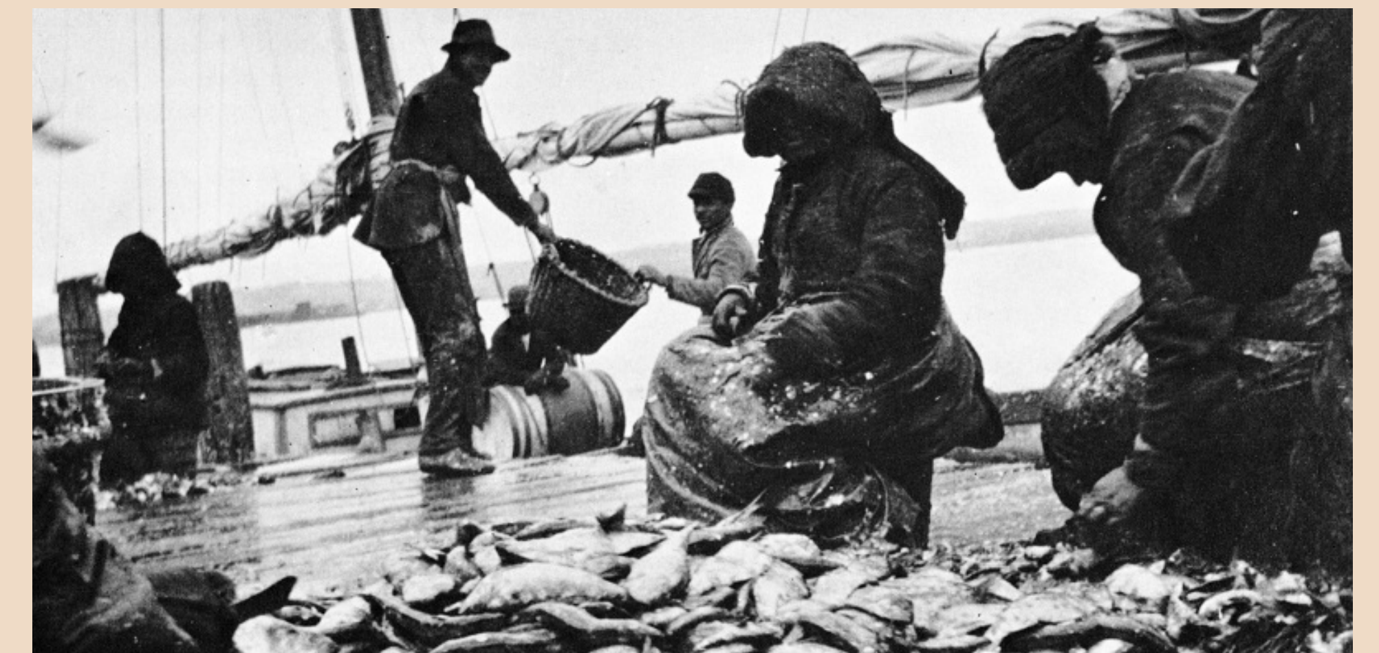
Fish were cut and washed by "cleaners," usually a small team of African American women.

During the Civil War, the Union troops commandeered the buildings in Fishtown, using them for storage or dismantling them for fuel. After the Civil War, Virginia failed to pass laws to protect the fish population in the Potomac River, which resulted in overfishing. Fishtown as a commercial area declined but grew as a residential area, attracting newly freed African American people to it and neighboring areas during and immediately after the Civil War. People of color who escaped slavery from Petersburg, Virginia, settled nearby, and referred to the area as "Petersburg," now known as "The Berg."