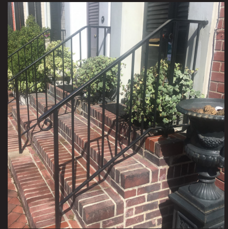
Example of inappropriate modern brick stoop and iron handrail on an Italianate style residence.