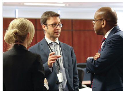
Conflict of Laws

It has been wonderful to be with you in person at our project meetings and the Annual Meeting. I look forward to seeing many more of you in the next year and beyond.