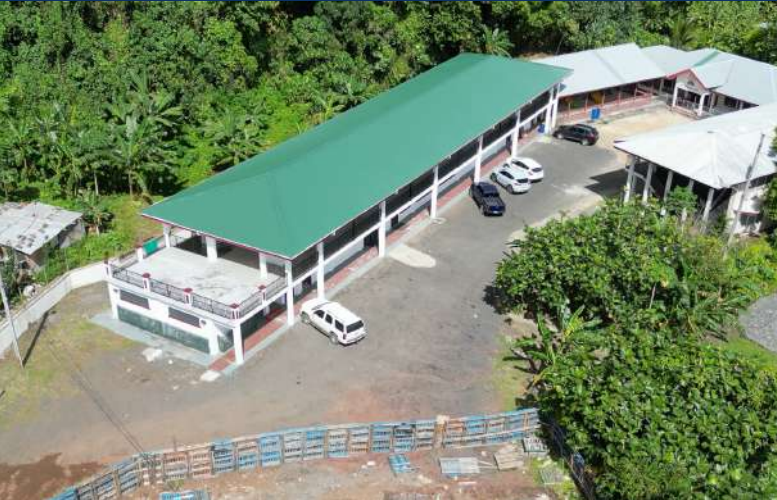
Alataua II ES Two-Story Building- Classroom Improvements