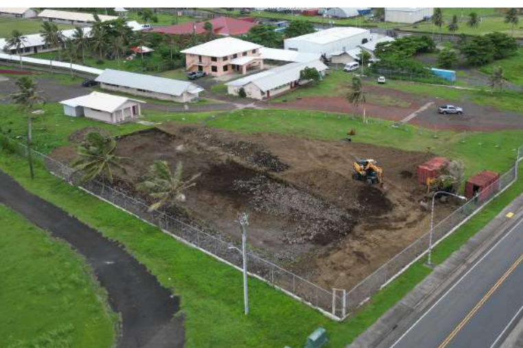
Tafuna HS JROTC Building- New Classrooms