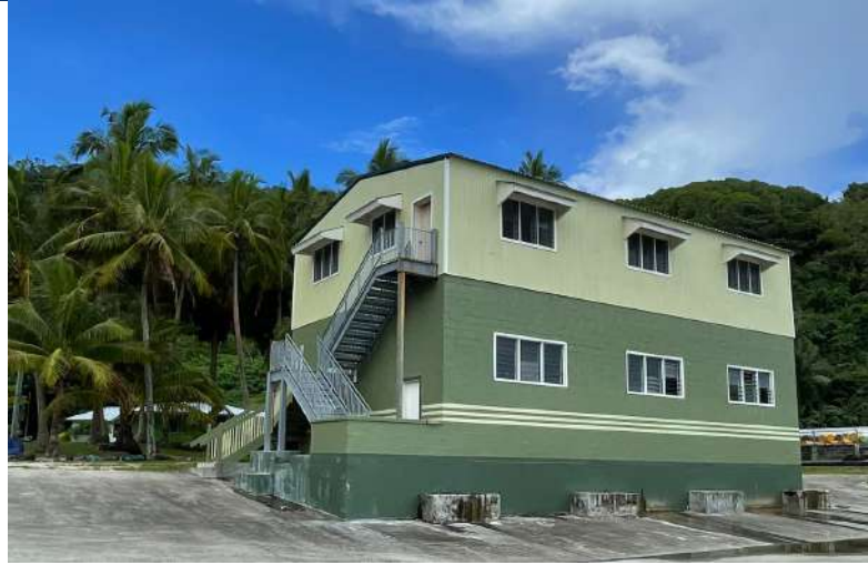
Faleasao Wharf- Cargo/Passenger Terminal