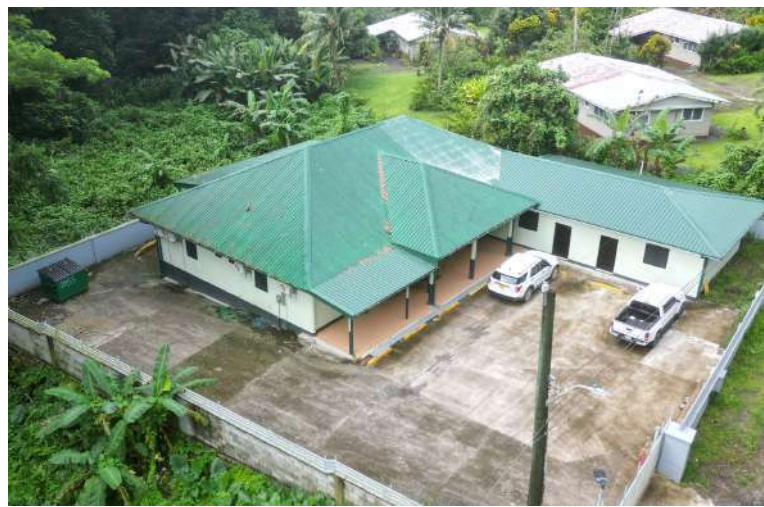
DHSS Malaeimi Shelter Renovation- Building Improvements