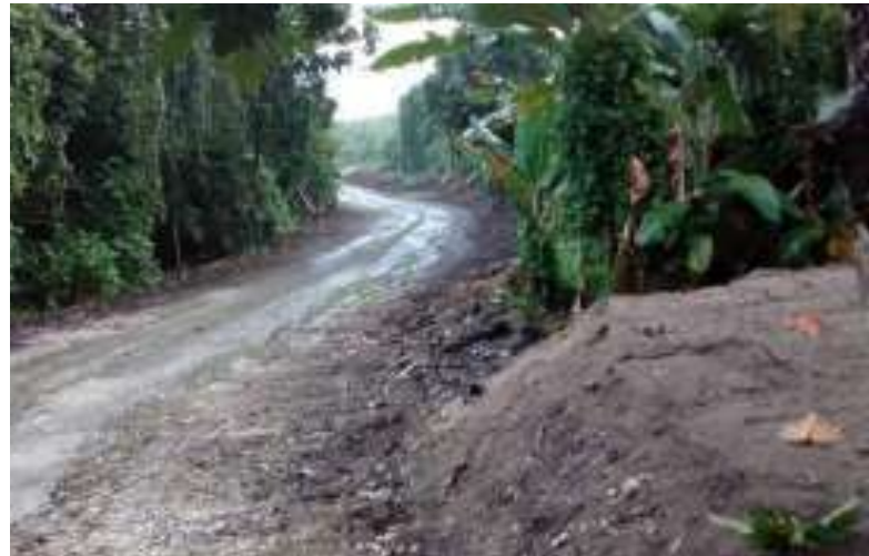
Fitiuta Village/Matasaua ES Escape Road- Emergency evacuation routes during volcanic incidents