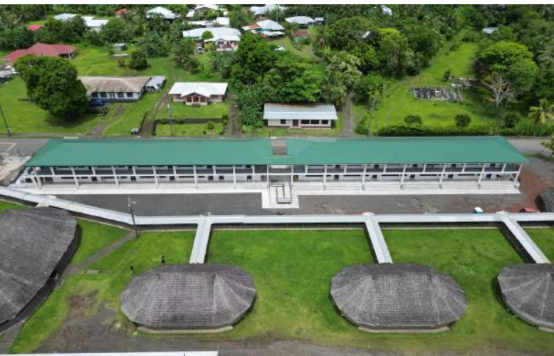
Leone Midkiff ES #1- New classrooms