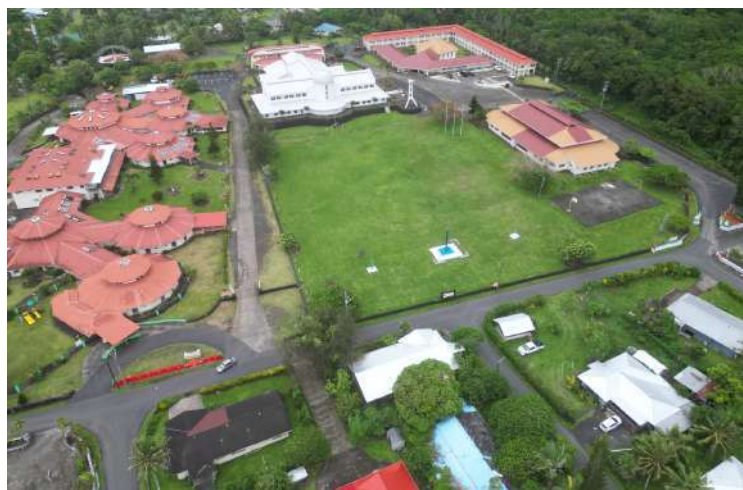
Fatuoaga Access Road- Road Improvement