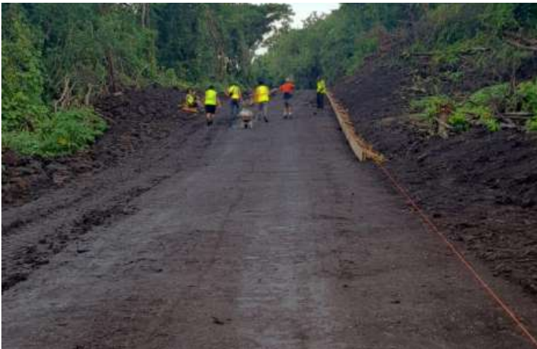
Ta'u Village, Si'ufaga Side Escape Road- Emergency evacuation routes during volcanic incidents