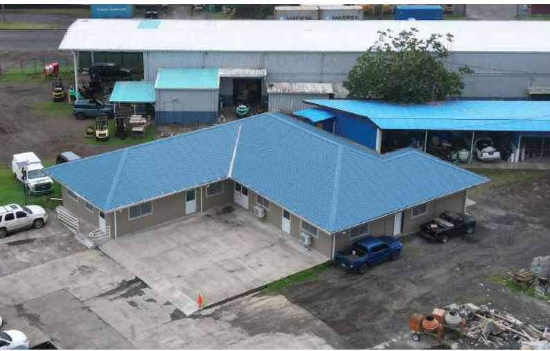
Parks & Recreational Office Renovation- Office Improvements