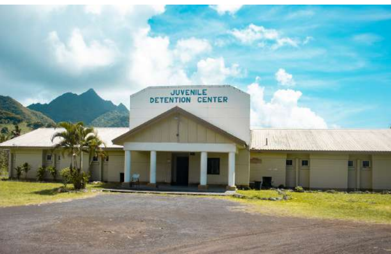
Juvenile Detention Center- Building Repair