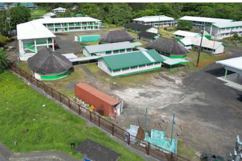
Lupelele ES Fence- Installation of security fence around the school