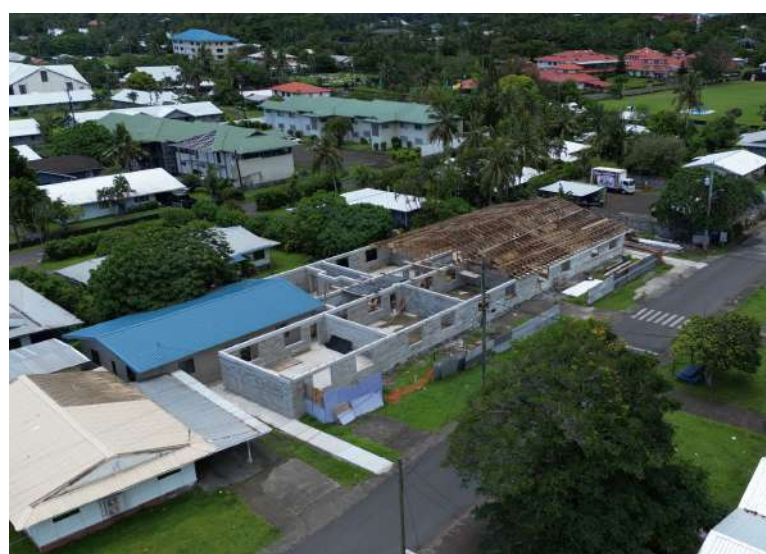
Pacific Horizon School Building- New Classrooms