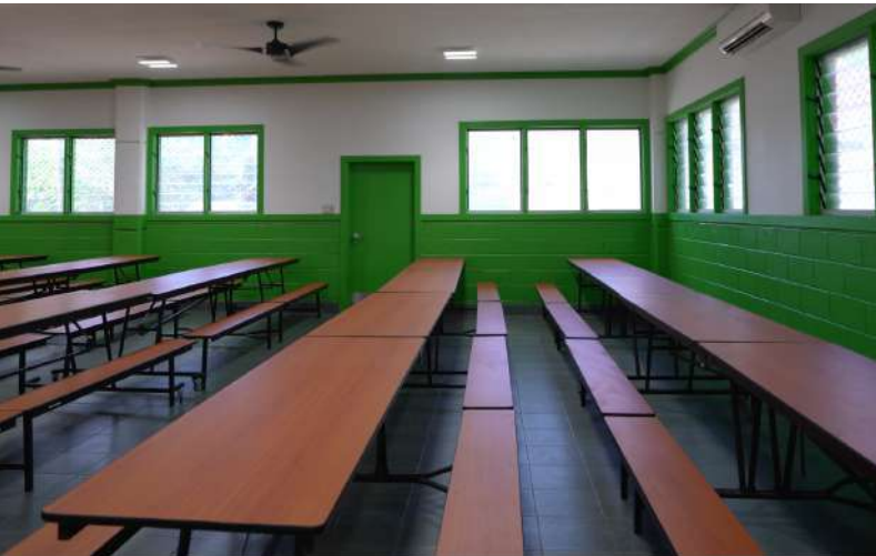
Lauli'i ES Kitchen/Dining Improvements- Cafeteria Installation