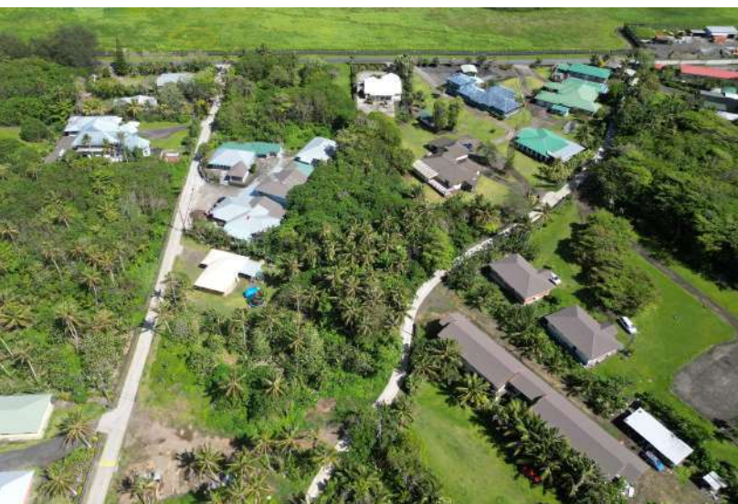
Fogagogo II Access Road- Road Improvement