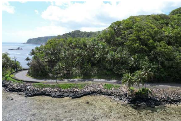
Asili Seawall- Implementation of coastal defense