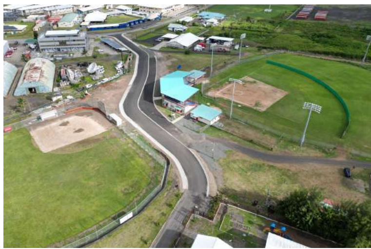
Tafuna ES Road- Road Improvement