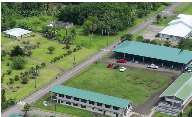
Leone Midkiff ES- Road Improvement