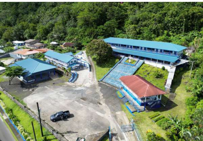
Marist St. Francis ES- Classroom Improvements