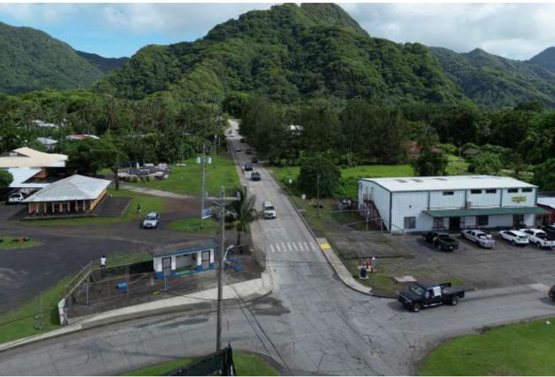
Road 018 New Road Construction Fagaima- Road Improvement