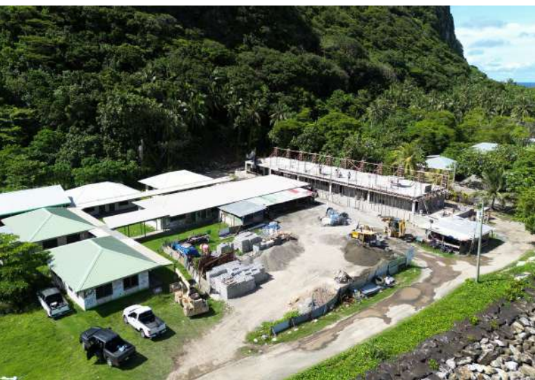
Mauga-o-Alava ES- Classroom & Kitchen Improvements