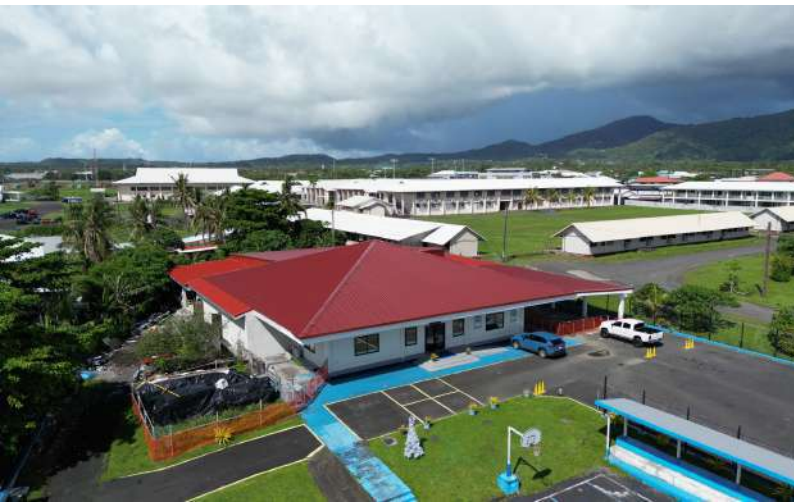
Boys & Girl Club Renovation- Building Improvements