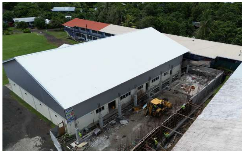
Iakina Distance Learning Plan & Classroom- New Classrooms