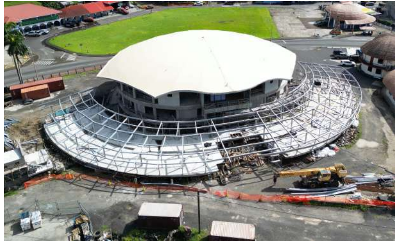
Fono Building- Building Renovation