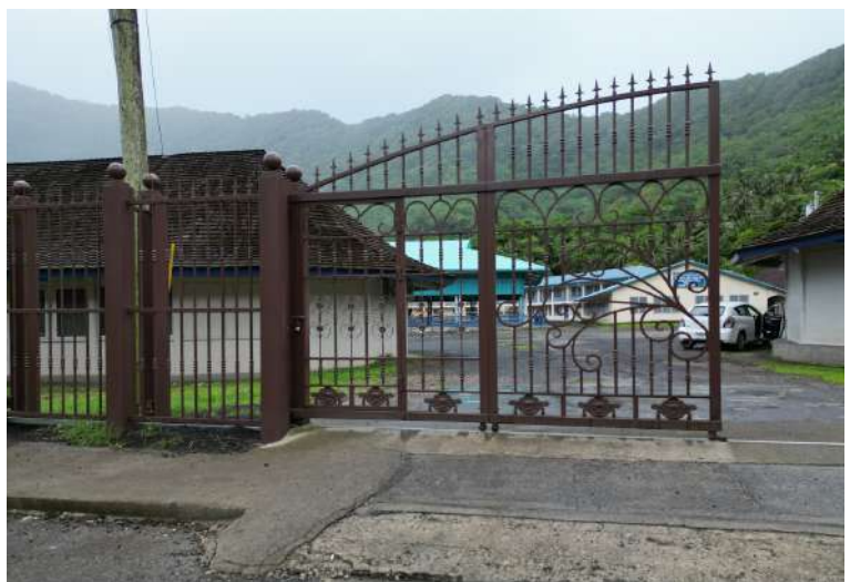
Coleman ES Fence- Installation of security fence around the school