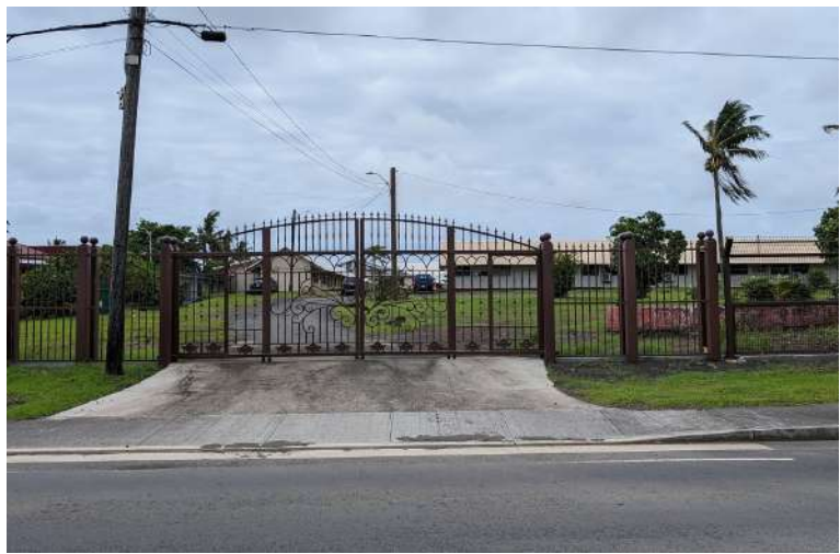
Tafuna HS Upper Campus Fence- Installation of security fence around the school