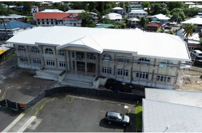
District Court- New Building