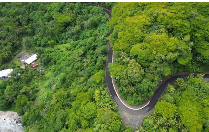
Amanave to Fagali'i Access Road- Road Improvement