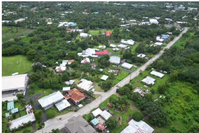
Route 13 Road Construction Malaeloa- Road Improvement