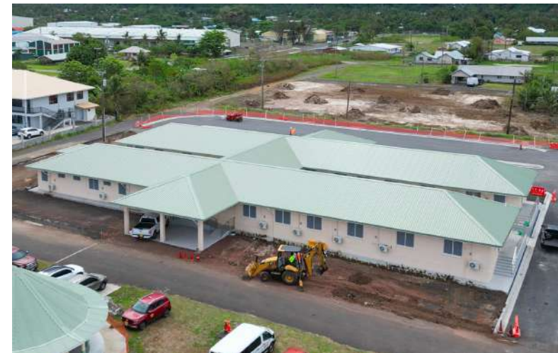
Early Childhood Education Building- Construction of new building