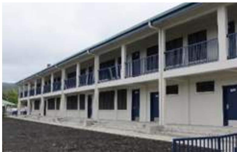
Leone Midkiff ES #2- New Classrooms