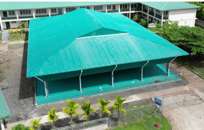
Fagali'i ES Multipurpose Building- New School Gymnasium