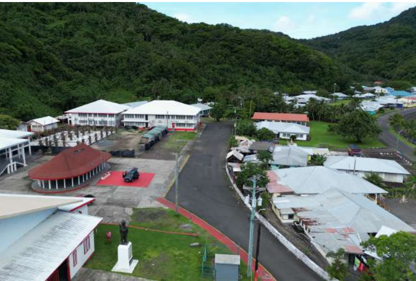
Fagaitua HS Access Road-Road Improvement