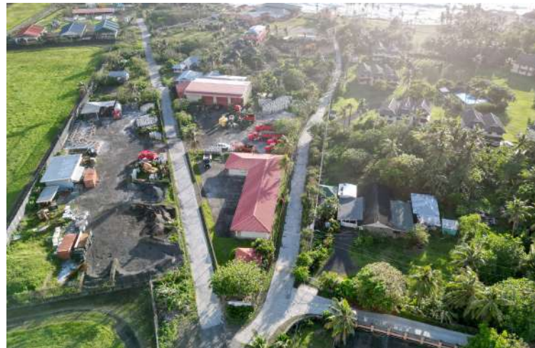
Fogagogo 1 Access Road- Road Improvement