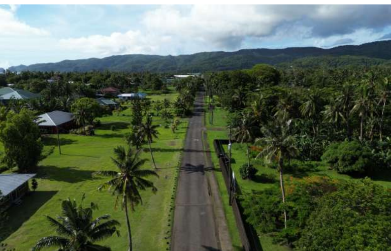
Leone HS Road- Road Improvement