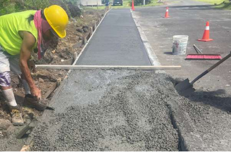
Fitiuta Sidewalk- Walkway and safety for residents