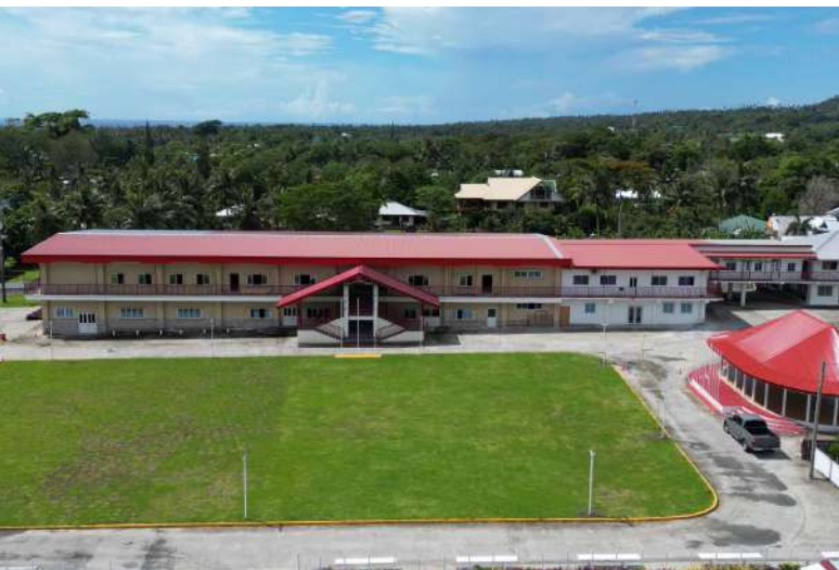
Peteli Academy- Renovation & Repair