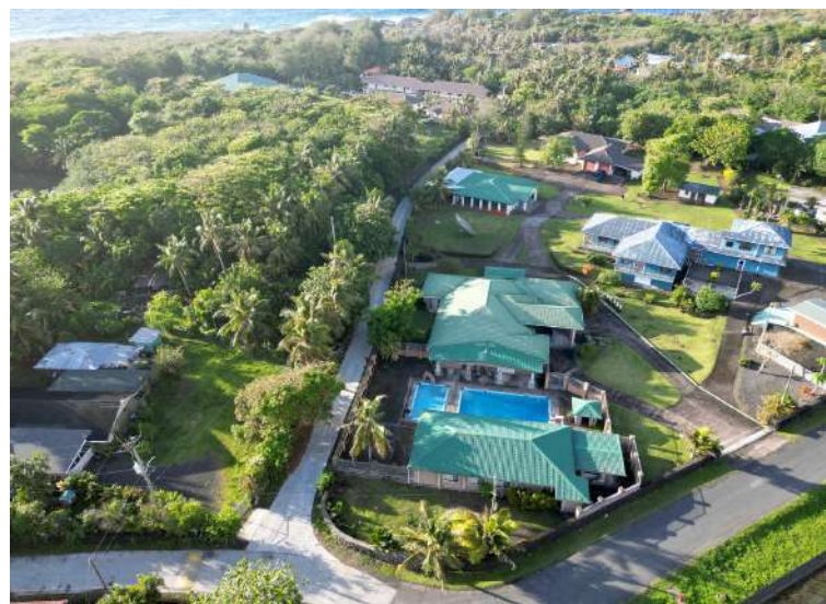
Fogagogo III Access Road- Road Improvement