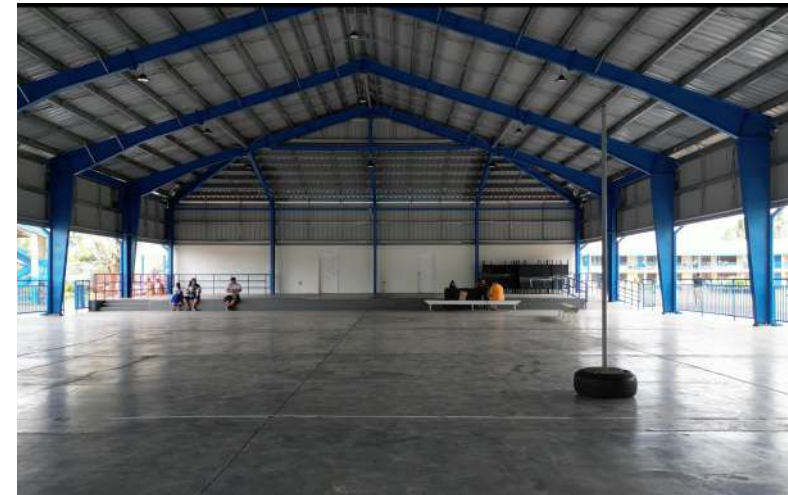
Manulele ES Gymnasium- New School Gymnasium