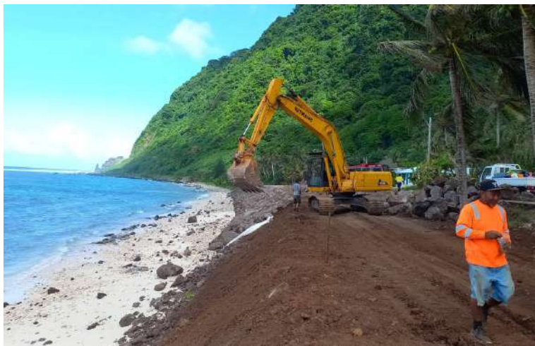
Olosega Seawall- Implementation of coastal defense