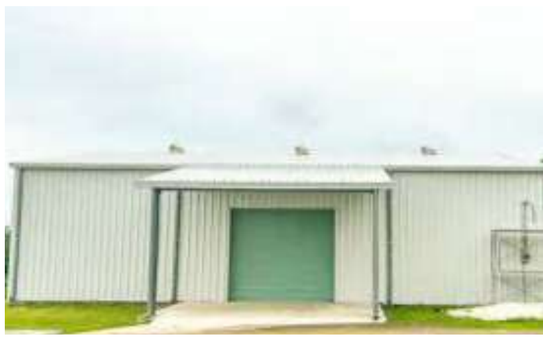
Ta'u School Lunch Warehouse- Timely access to food, especially in emergencies