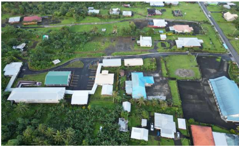
Aoloau/Siliaga Access Road- Road Improvement