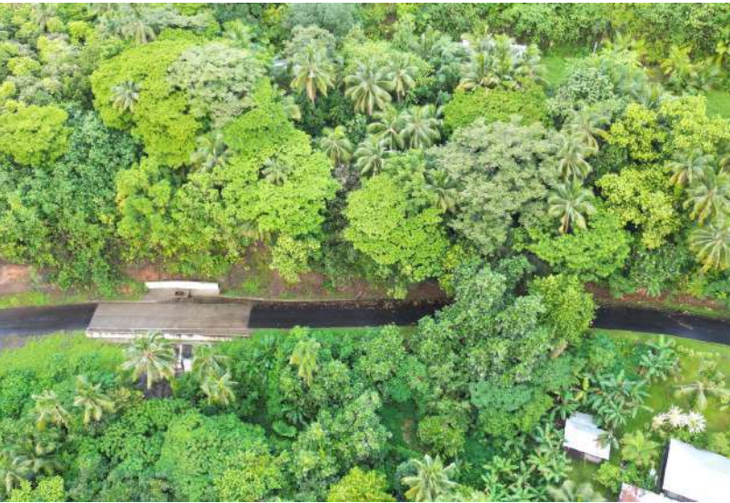
Poloa to Fagamalo Road- Road Resurface