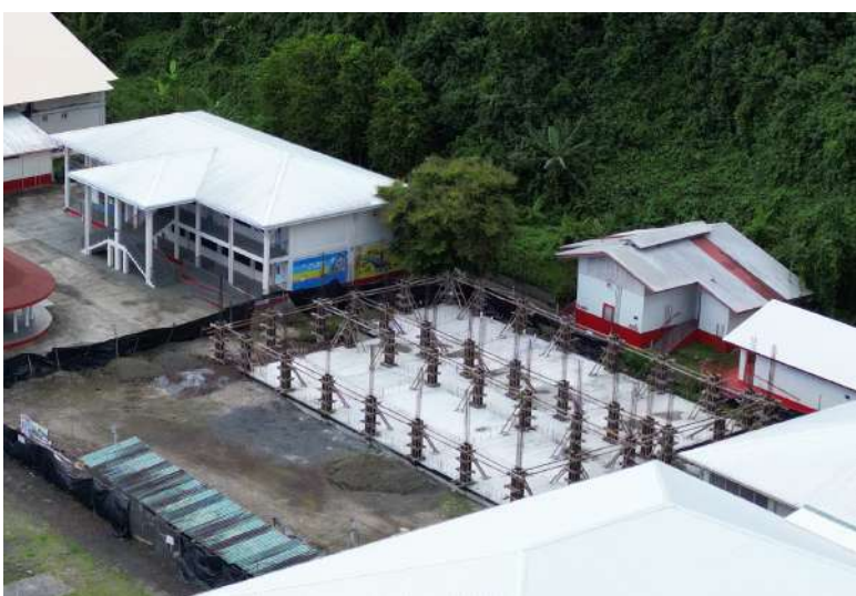
Fagaitua High School- Classrooms Improvements