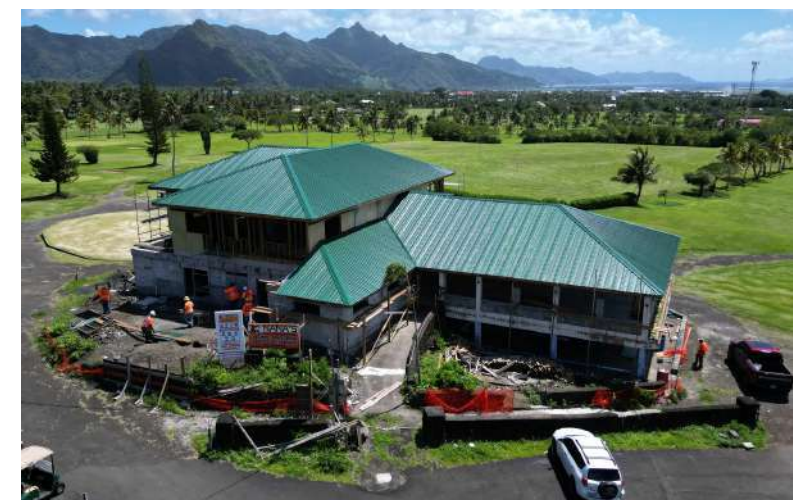
Country Club Renovation- Building Improvements