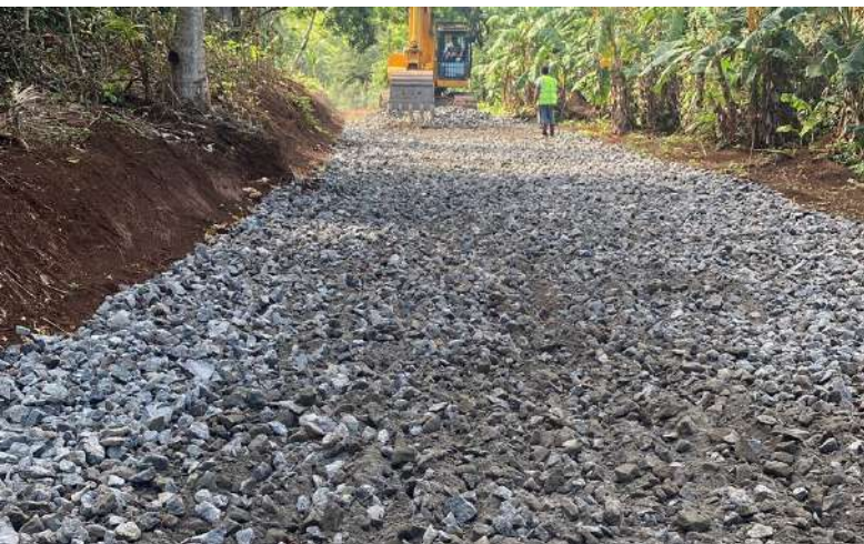
Ofu Village Emergency Road- Emergency evacuation routes during volcanic incidents