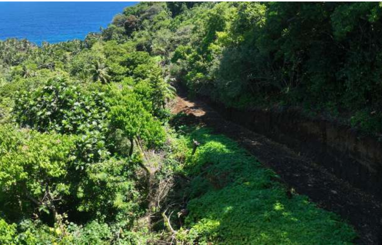
Agriculture Access Road- Cattle farm