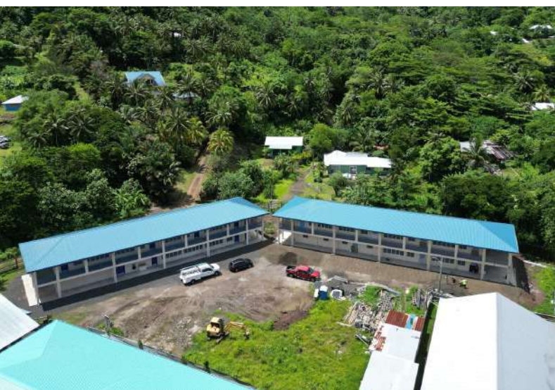
Coleman ES Buildings- Improved Classrooms