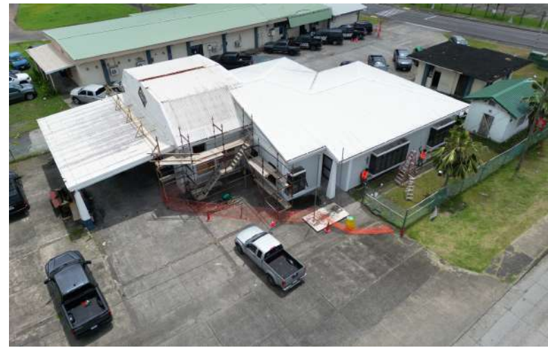
DPS Tafuna Office- Office Improvements