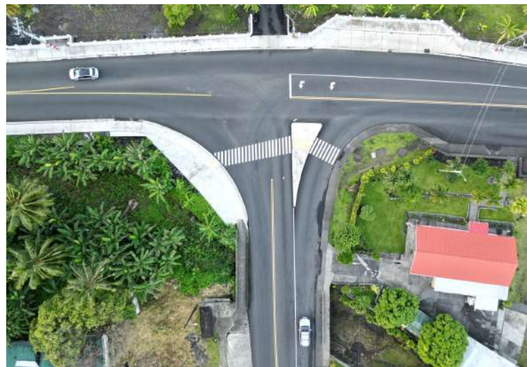
Island- Wide Safety Improvement Pavement Marking