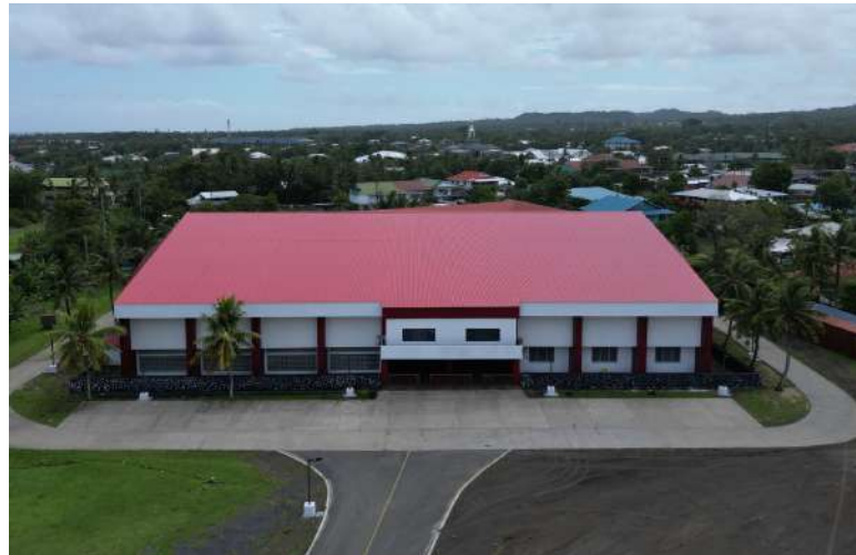
Kanana Fou Taeaofua O Tupulaga Multipurpose Facility- Classroom Improvements