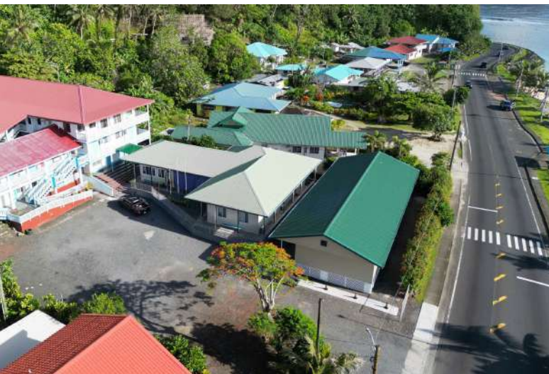
SPICC Building- New Classrooms