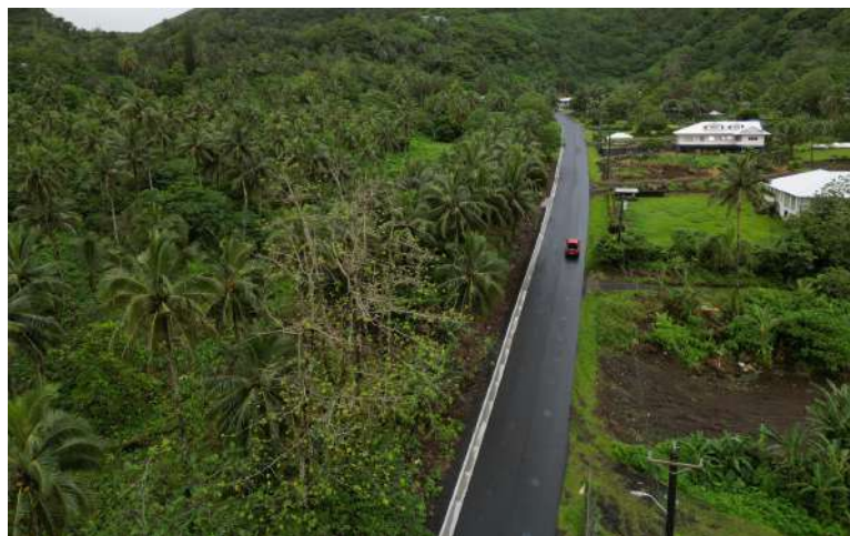
Mapusaga Fou Road- Road Improvement