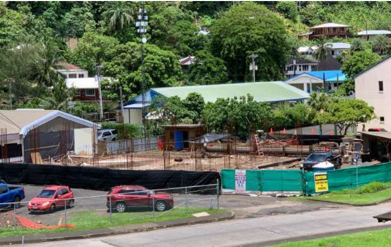
Office of Samoan Affairs- Building Renovation