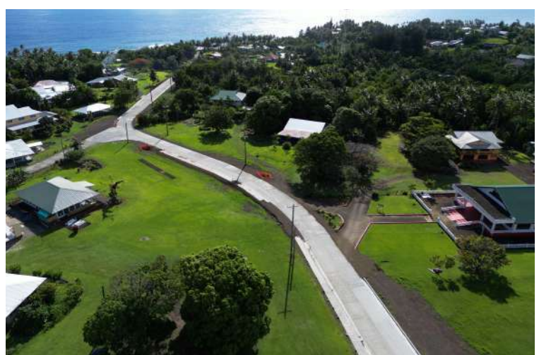
Route 003 Road Reconstruction Taputimu- Road Improvement