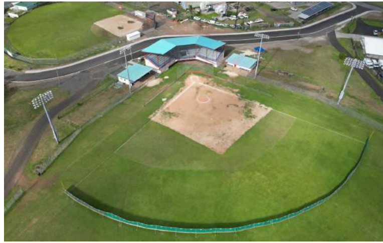
Tony Solaita Baseball Field - Field Improvements