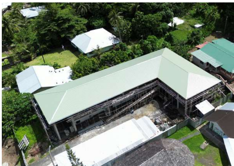
Lauli'i ES- New Classrooms