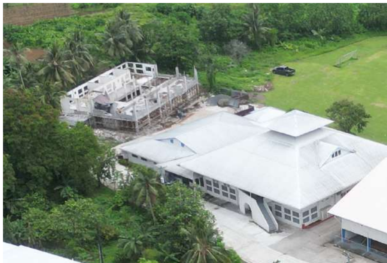
St. Theresa ES- Renovation Existing Building