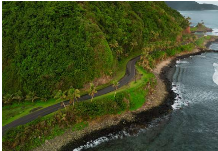
Tula to Alofau Road- Road Improvement