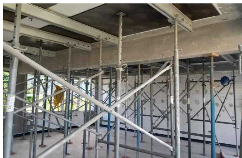
Tafuna HS Retrofitting Building- Strengthening cracked ceiling and walls