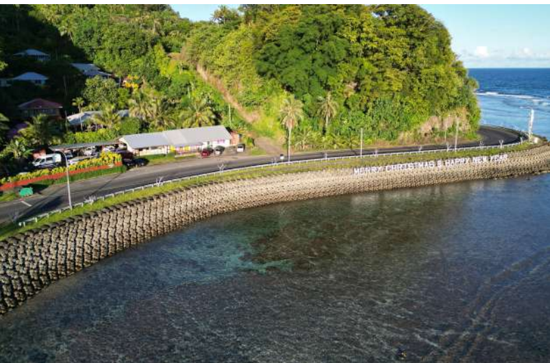
Island- Wide Safety Improvement Guadrail Project