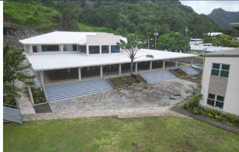
ASCC Cafeteria- New Cafeteria & a distance learning center