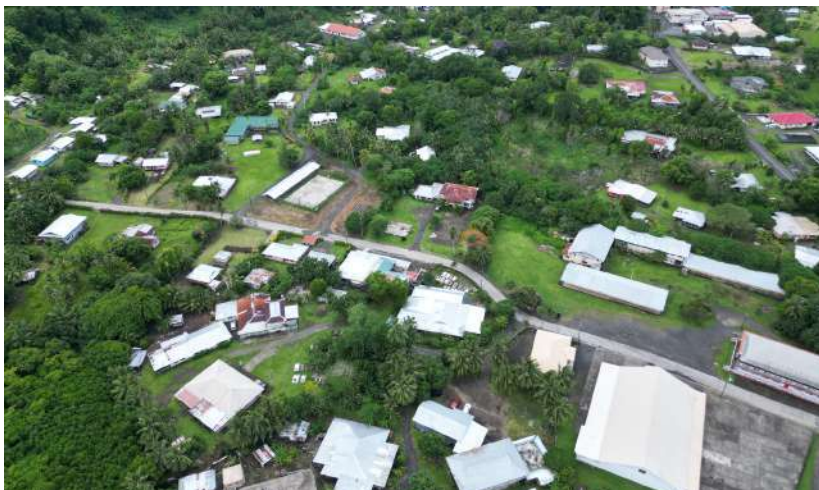
St. Theresa Access Road (Leone)- Road Improvement