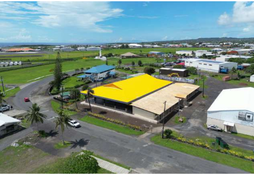
Nuuli Vocational Technical HS Access Road- Road Improvement