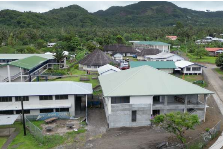
Pava'iai ES #1- Classrooms & SPED Unit