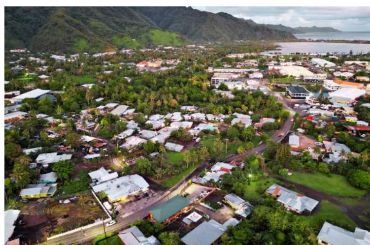
Ottoville and Fagaima- Road Improvement