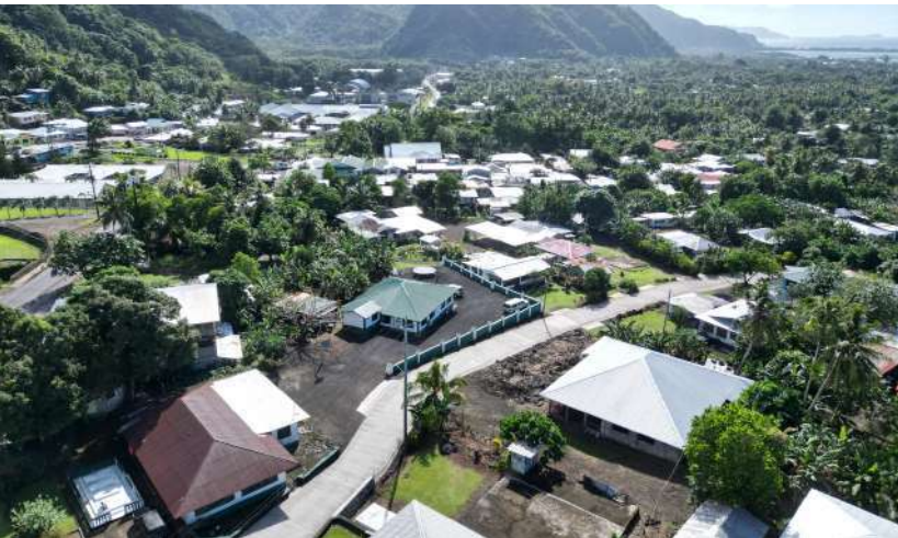
Faleniu Access Road-Road Improvement