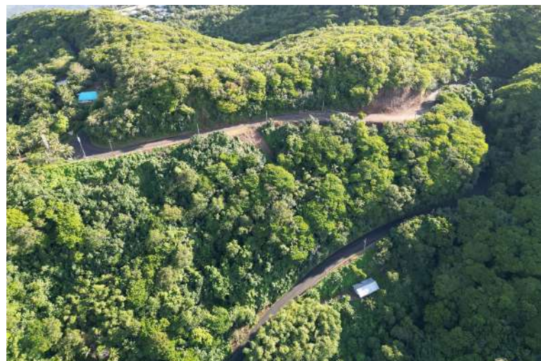
Amouli to Aoa- Road Improvement