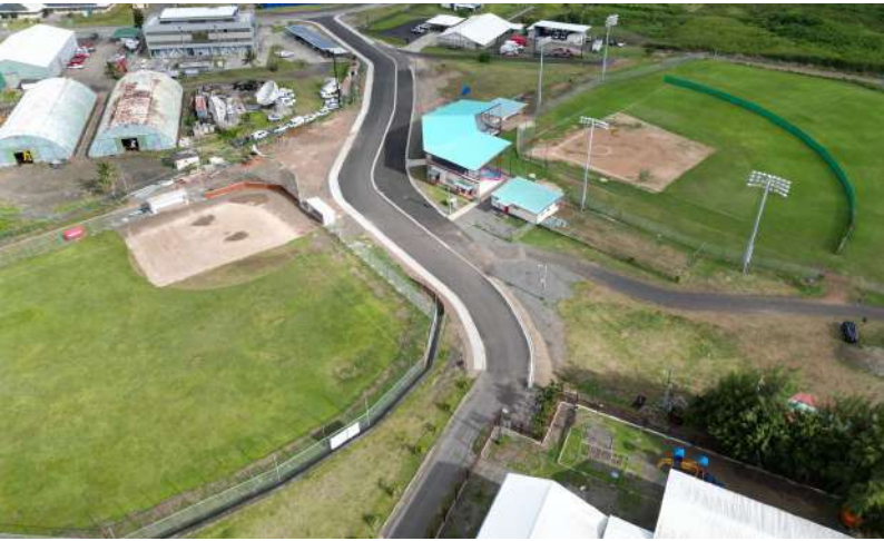
Little League Baseball Field- Field Improvements