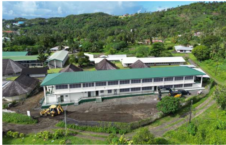
Pava'iai ES #2- Improved Kitchen, Cafeteria, & Classrooms