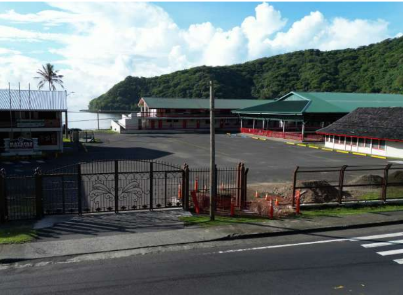
Matafao ES Fence- Installation of security fence around the school