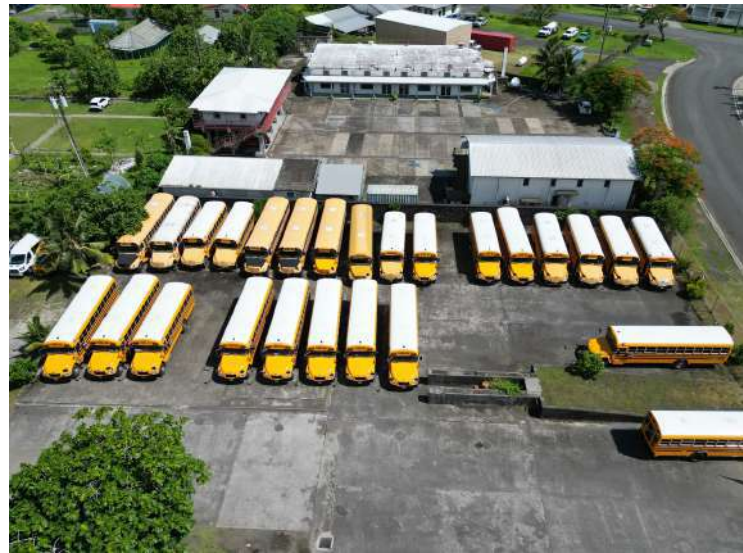
New School Buses- enhance student safety & efficiency