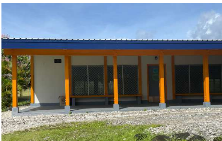
Ta'u ECE School Building- Repairing Project