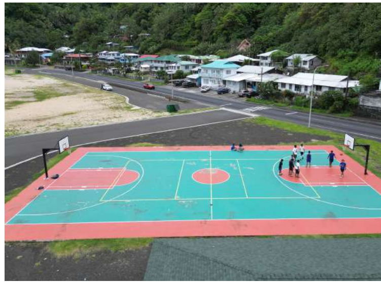
Basketball Court/ Cricket Parking Lot- Faga'alu Park- Parking Lot Reconstruction