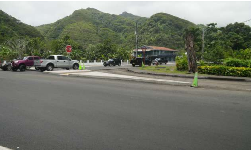
Nu'uuli Airport Intersection Rd- Road Improvement