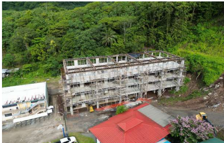
Manumalo Junior & Secondary Academy- 23 Classroom Extension Project