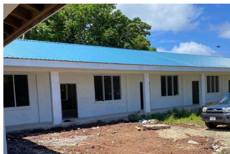
Ta'u New Consolidated ES Building- New Classrooms