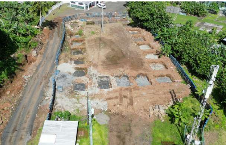
Alataua II ES Multipurpose Building- New School Gymnasium