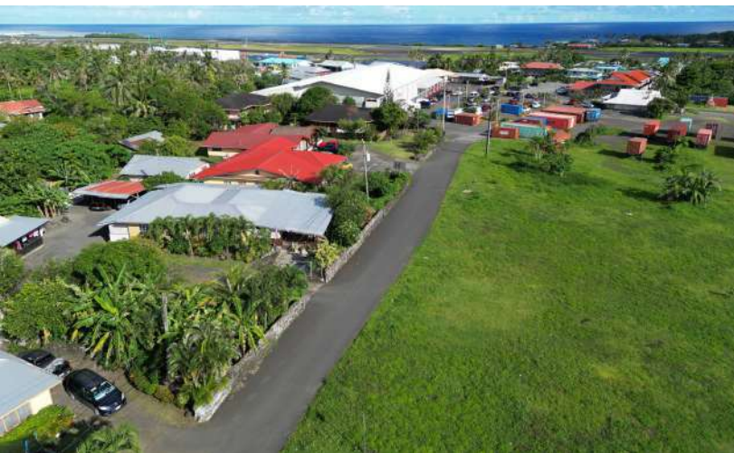
Naumati Access Road- Road Improvement