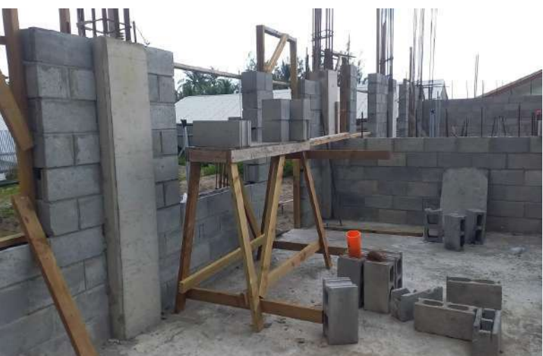
Olosega Elementary School (Two Story Building)- New Classrooms