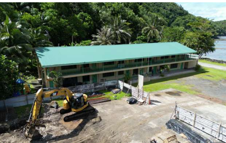
Afonotele ES Two-Story Classroom (Kitchen/Cafeteria)- Cafeteria Installation