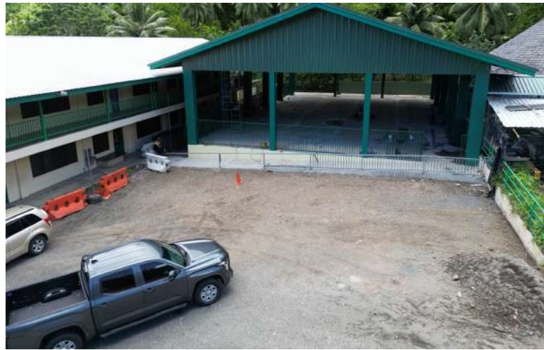
Tautalatasi Tuatoo ES New Multipurpose Building- New School Gymnasium