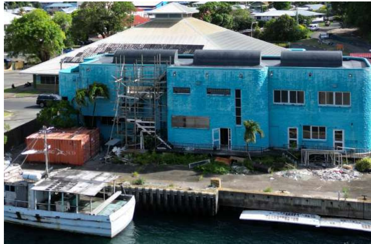
Maritime Cultural Heritage Center (DMWR)- Building Improvements