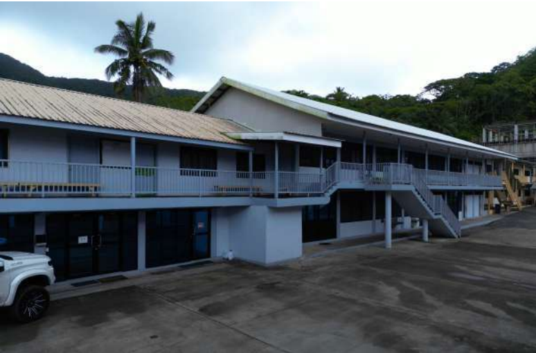
Manumalo Junior & Secondary Academy- New 15 Classroom