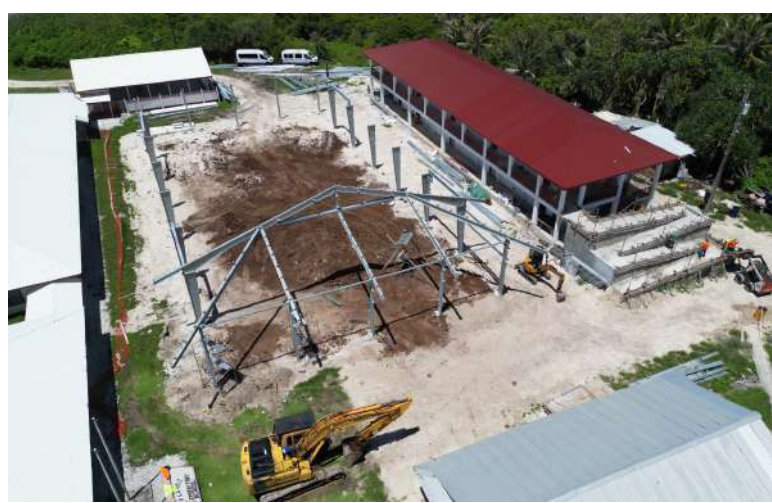
A. P. Lutali Multipurpose Building- New School Gymnasium