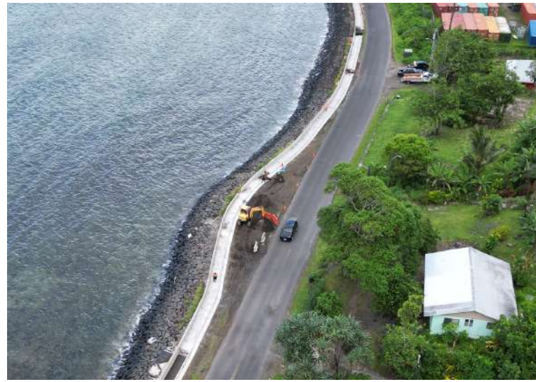
Leloaloe Sidewalk- Walkway and safety for residents