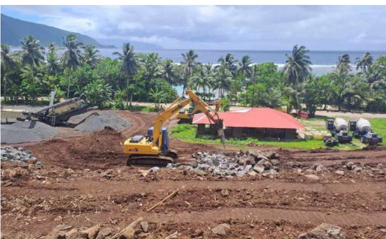
Olosega Village Escape Road- Emergency evacuation routes during volcanic incidents