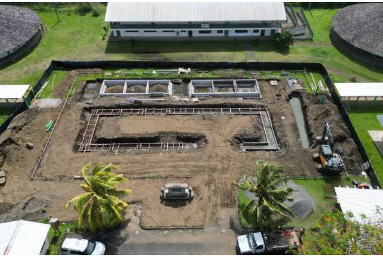
Leone HS- New Administration Building