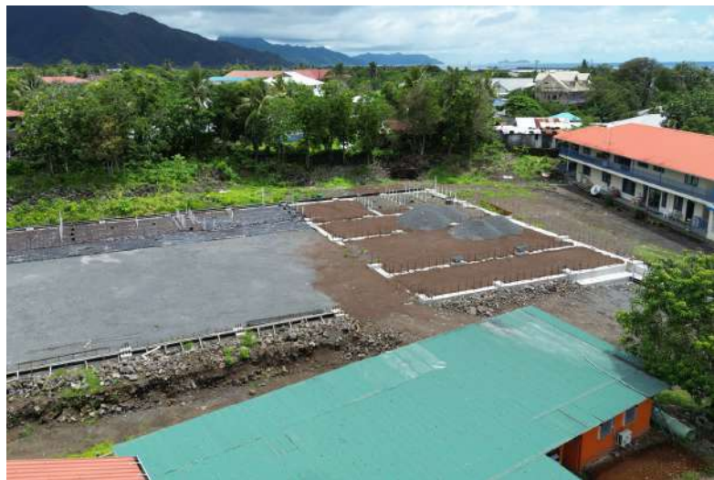
Samoa Baptist Academy Extension- New Classrooms