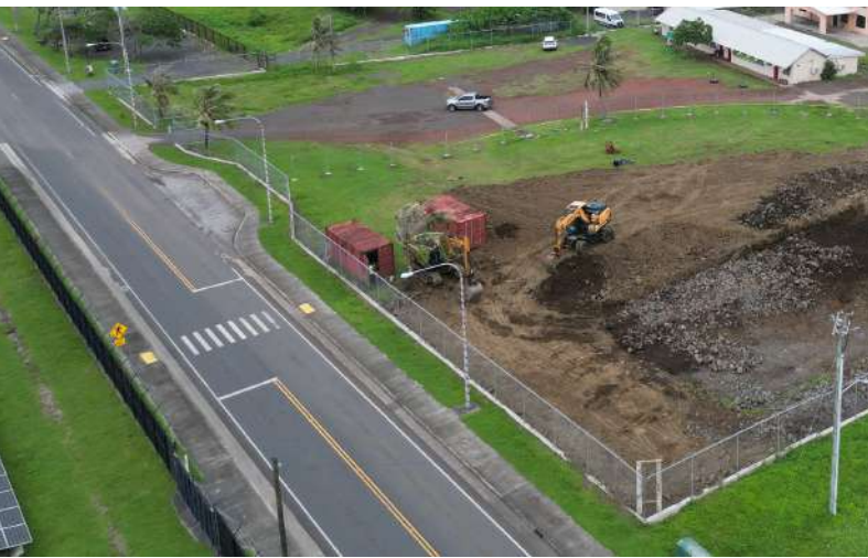
Tafuna HS Lower Campus Fence- Installation of security fence around the school