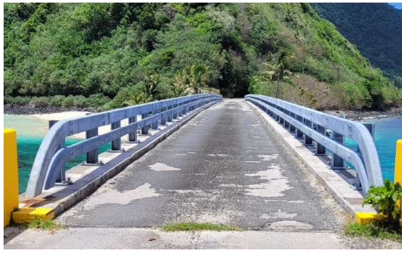
Ofu/Olosega Bridge Safety Rails- ensure the safety of the residents and travelers