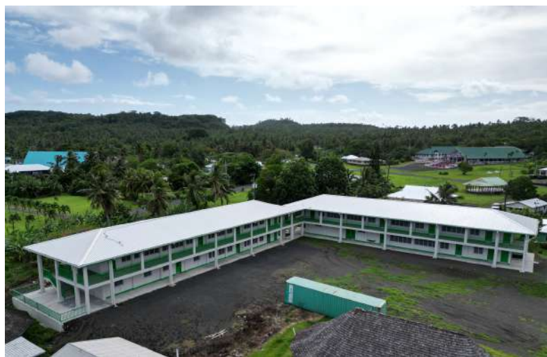
Lupelele ES Classrooms & Restrooms -New Classrooms