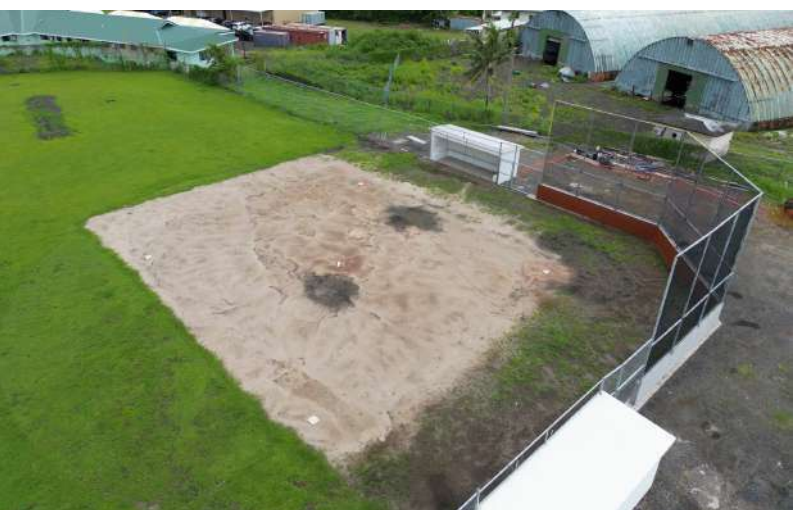
Little League Baseball- Field Improvements