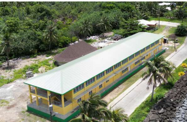
Olomoana ES- Classroom, Kitchen/Cafeteria