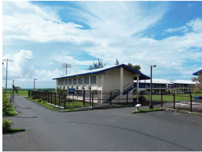
Tafuna ES Fence- Installation of security fence around the school