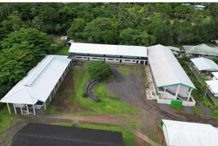
Lupelele ES- Improved Classroom/ Kitchen & Cafeteria