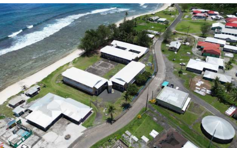
Matatula ES Access Road- Road Improvement