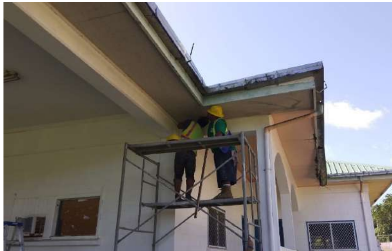
Ta'u DPS Substation Repair-Building Improvements