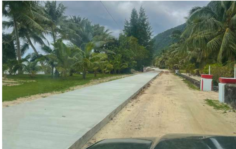
Olosega village road- Emergency evacuation routes during volcanic incidents