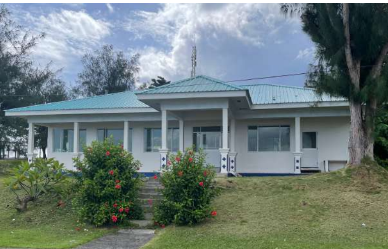
Fitiuta Airport Passenger- Cargo/Passenger Terminal