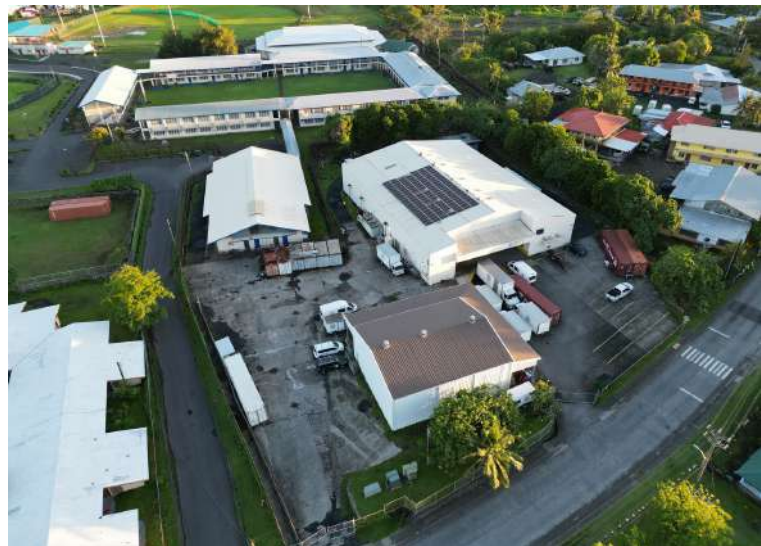
School Lunch Program Access Road- Road Improvement