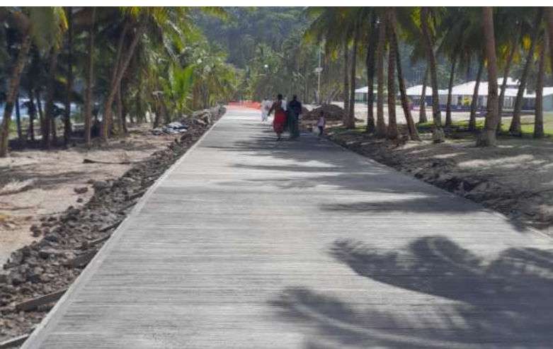
Ta'u Coastal Road- Improved roads