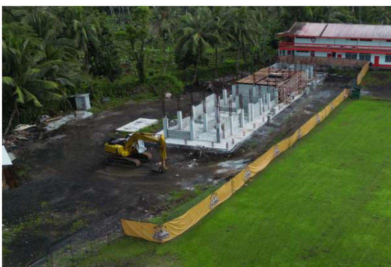
Faasao Marist HS Classroom- Classroom Improvements