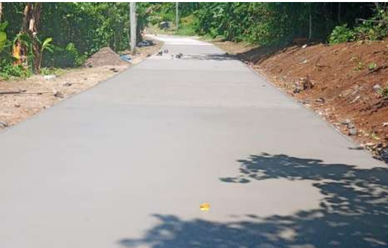
Faleasao Emergency Escape Road- Emergency evacuation routes during volcanic incidents