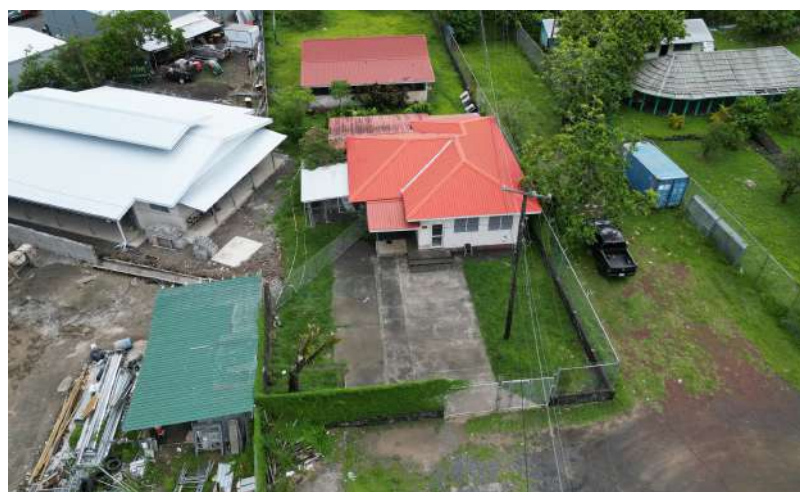
K9 Facility- Building improvements