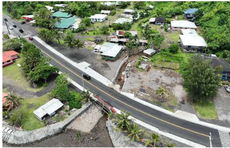
Nuuli Project- Drainage and Road Improvement