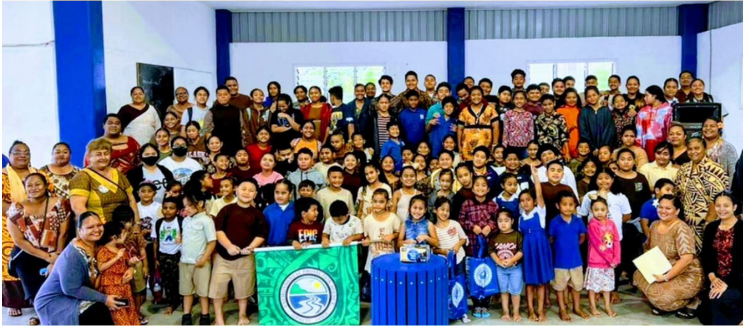
AS-EPA conducted a school outreach at the Marist St. Francis and Mary the Mother Montessori to commence the celebration of February as the Pesticide Safety Education Month nationwide and Catholic Education Week. Students and staff are pictured with gift prizes and a recycling bin awarded by the AS-EPA for their recycling program.