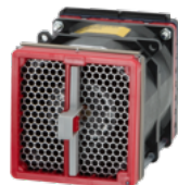
2U Hot swap fan modules