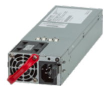
2.4kW Hot swap power supplies