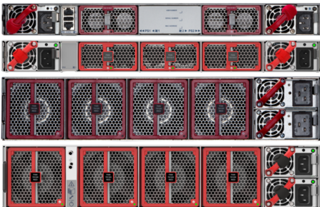
Arista 7280R3A 1 and 2RU Rear Views AC Powered, Front to Rear airflow (red)