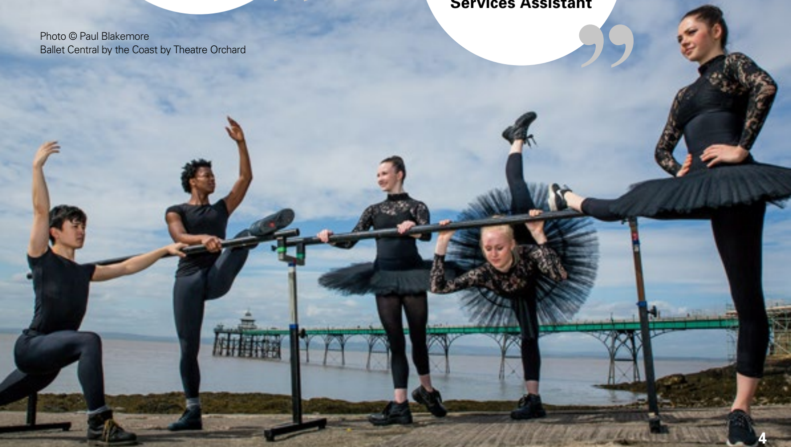
Ballet Central by the Coast by Theatre Orchard