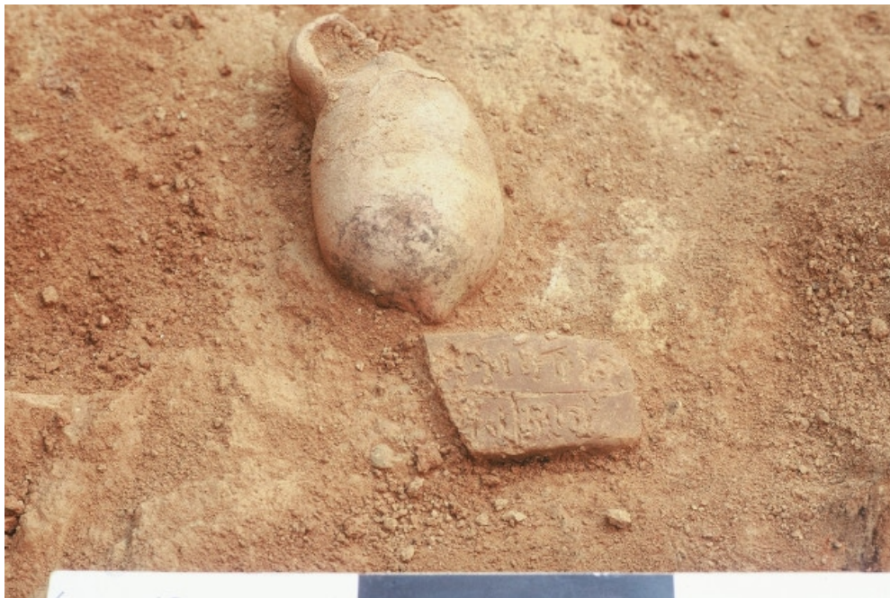
A fragment of tablet 3524 found in situ next to a Late Bronze Age juglet on the floor of a large hall.