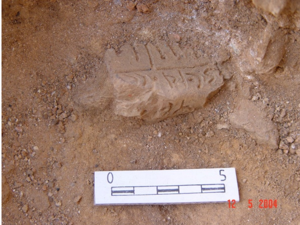
A fragment of tablet 3524 found in a large hall.