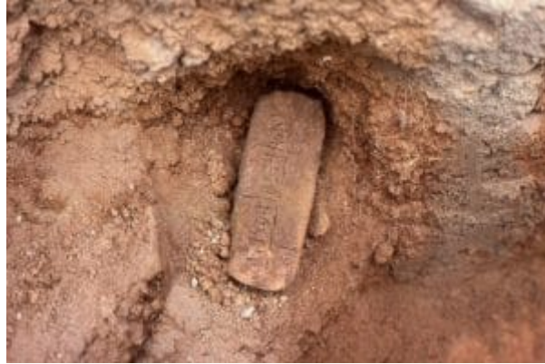
Tablet 3291 found in situ in 1994 in the southern area of the settlement.

Among the many finds associated with the Late Bronze Age temple were ceramics including goblets and ceremonial vessels, Mycenaean imports, scaled armor and scarabs, and faience vessels including a gift from Egyptian Queen Twosret which provided an approximate dating for the destruction not too long after 1180 BCE. But most striking perhaps were some clay tablets which bore a script that still have no exact parallels.