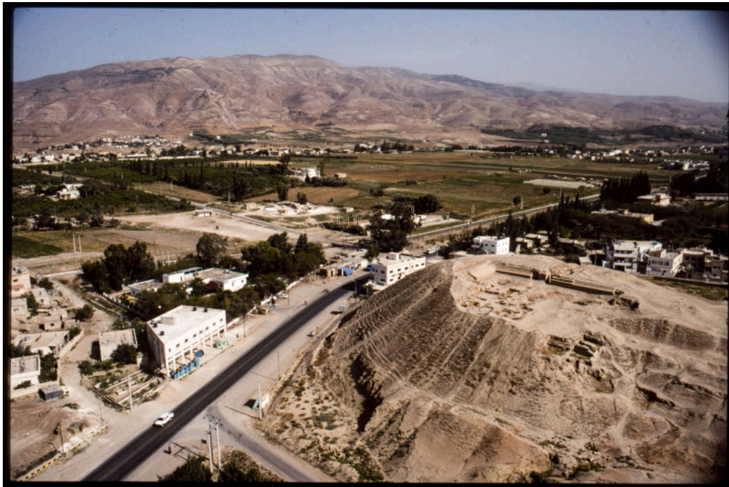
The site of Tell Deir ‘Alla in the Jordan Valley and the hills around Salt in the back as viewed from the Northwest.