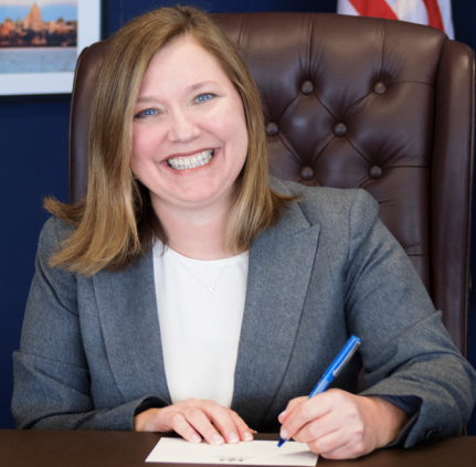
Michelle A. Henry Attorney General

Pennsylvania is home to over 2 million seniors. Older Pennsylvanians are more likely to be victims of certain crimes like fraud, identity theft, scams, and financial exploitation. Too many bad actors and criminals see our senior citizens as vulnerable targets and look to exploit them and profit off of them. In fact, seniors across the country lose $3 billion each year to scams and fraud.