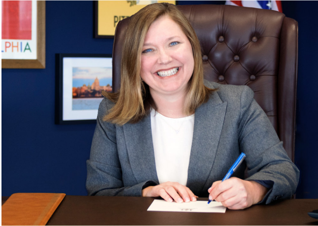
Michelle A. Henry Attorney General

Environmental protection is one of my top priorities. It's also a constitutional right in our Commonwealth; that's why our Constitution gives all of us the right to clean air, pure water, and the preservation of our natural resources. I am committed to protecting those rights through the prosecution of criminal actions and the pursuit of civil cases. I pledge to ensure that generations to come have access to the same resources we have today.