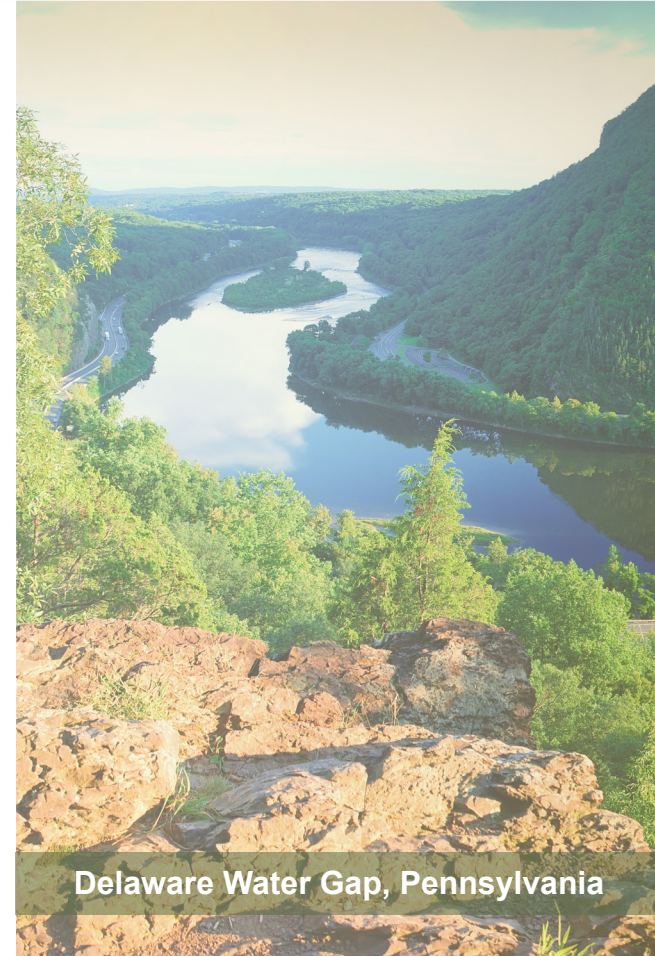
Delaware Water Gap, Pennsylvania

Clean air, pure water, preserving our natural resources