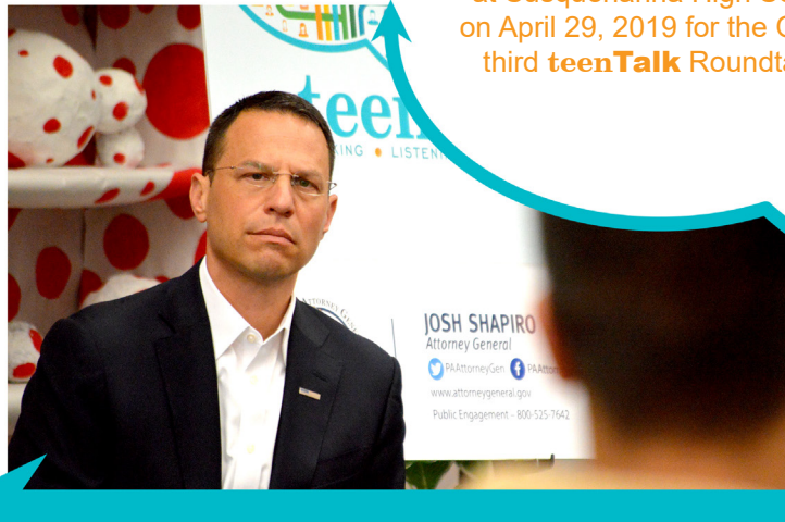
Attorney General Josh Shapiro at Susquehanna High School on April 29, 2019 for the OAG's third teenTalk Roundtable

Students today face obstacles that are different from any earlier generation. I know they're certainly different than the challenges I faced when I was in school. While adults recall high school as a time to navigate through the demands of offline life – getting good grades, fitting in, exceling in sports or extracurriculars, planning for the future, and working afterschool jobs— today's students face additional demands on top of those we experienced.