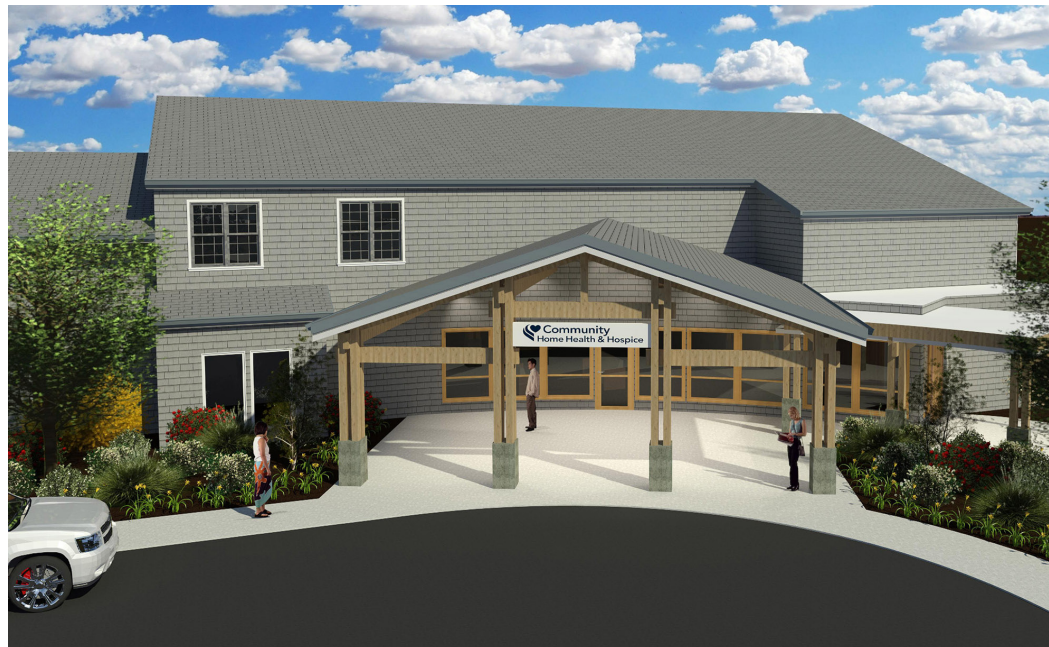
Rendering shows the planned renovations to the Longview Hospice Care Center.