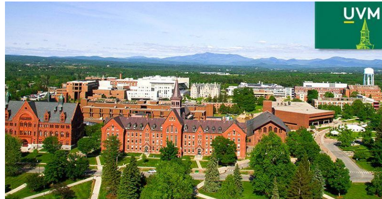
University of Vermont (UVM). Vermont, USA.