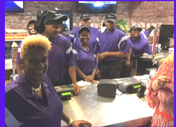
Intergenerational Guidance Group operating concessions at a Pelicans game

We guarantee a minimum donation amount of $100 per volunteer at the Superdome and $80 per volunteer at the Arena. You earn either the commission or the minimum donation, whichever amount is larger!