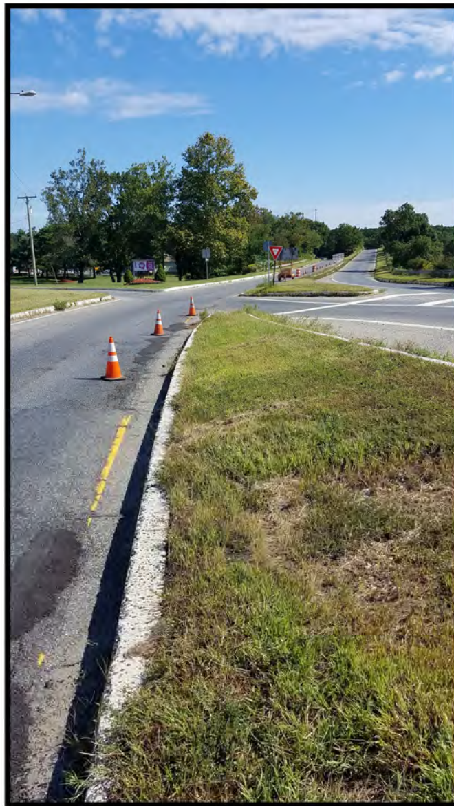
General Overview looking north before start of construction.