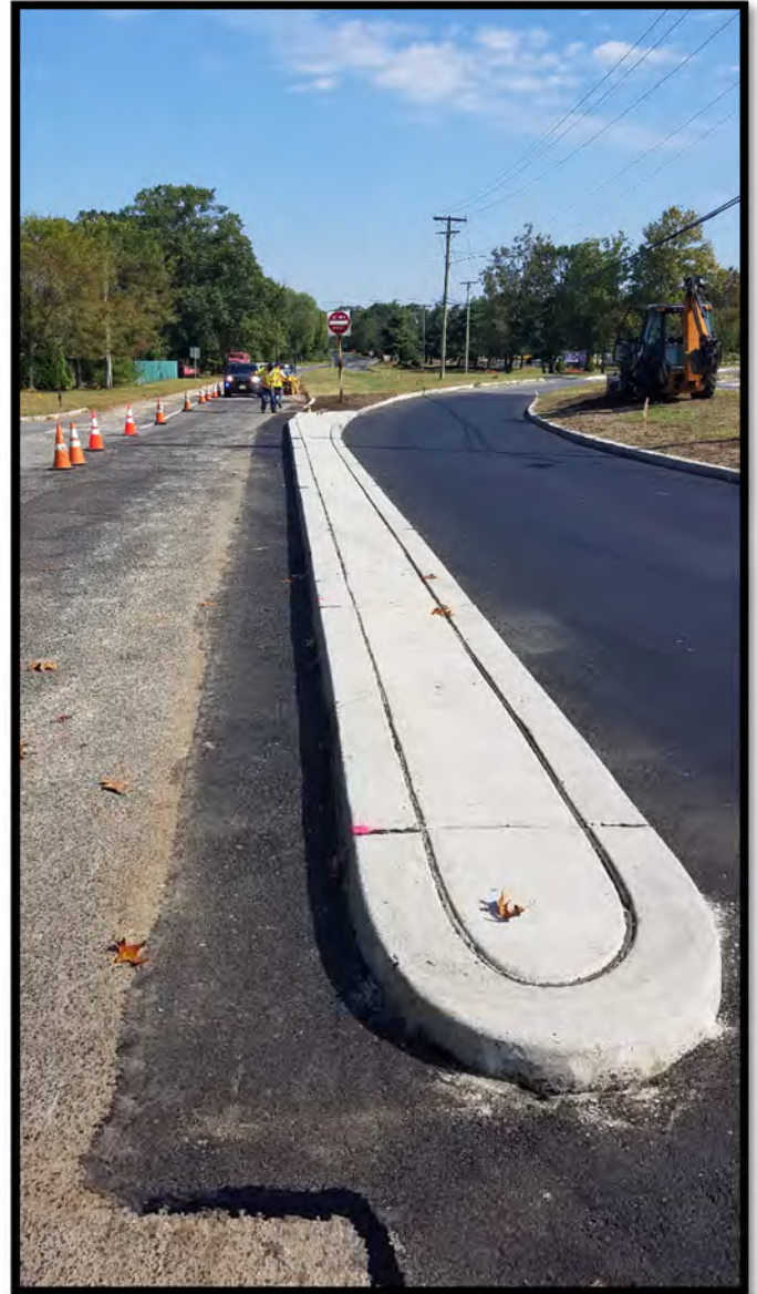
14. Looking north at completed asphalt overlay.