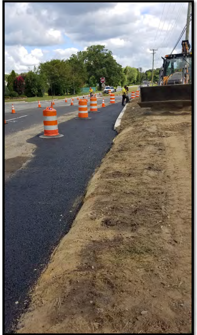
4. Hot Mix Asphalt installed at widened ramp area.