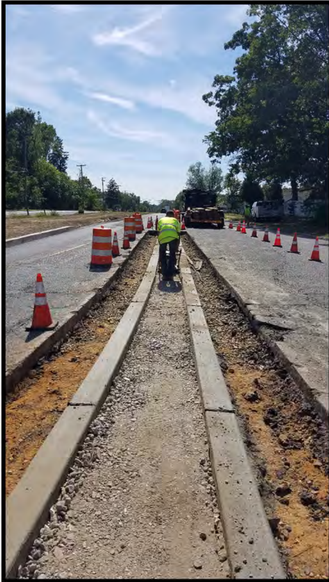
7. Compacted Dense Graded Aggregate in extended concrete island.