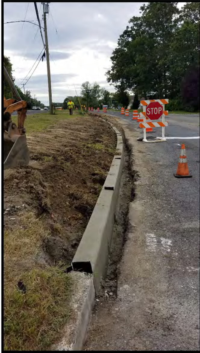
1. New curb installed at widened ramp lane.