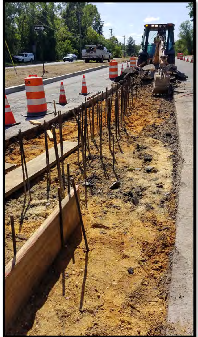
6. Curb forms being installed for extended concrete island.