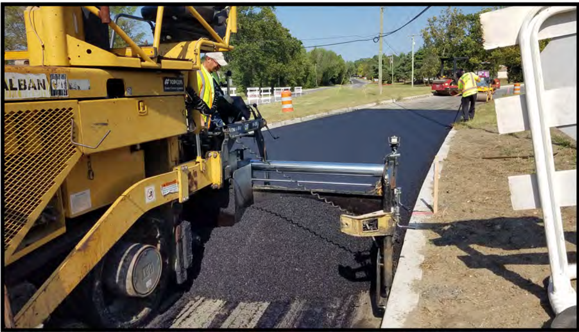
12. Hot Mix Asphalt overlay being installed.