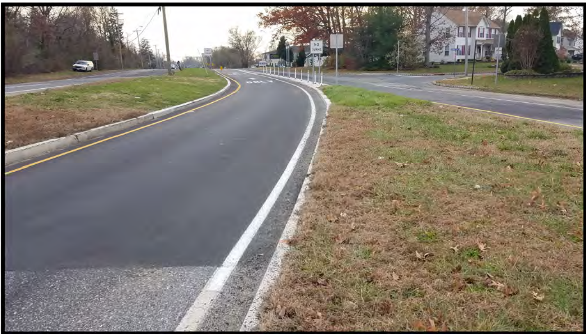
Looking south at completed project.