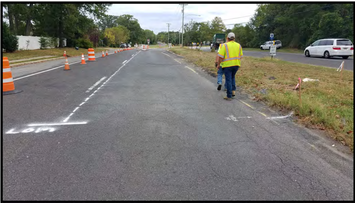
10. Laying out mill and overlay limits.