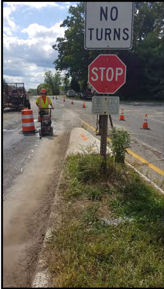
5. Sawcutting to install new curb at extended concrete island.