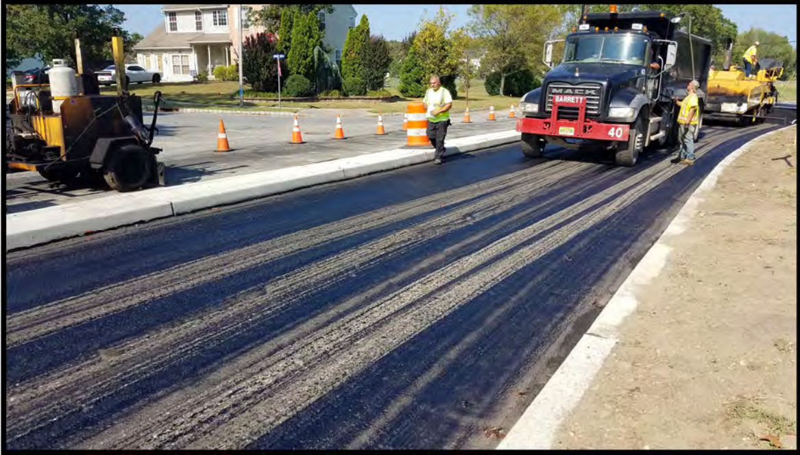
11. Roadway milled, tacked and elastomeric joint adhesive installed adjacent to curb.