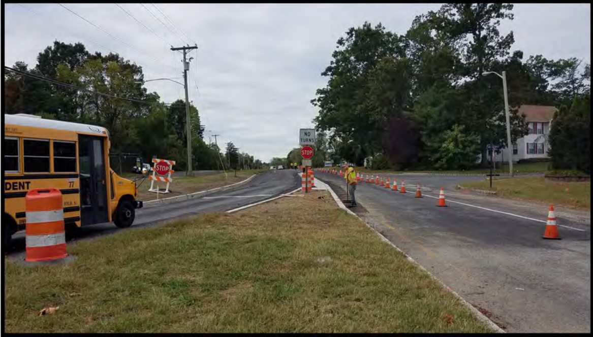
9. Concrete flatwork complete and preparing for mill and overlay.