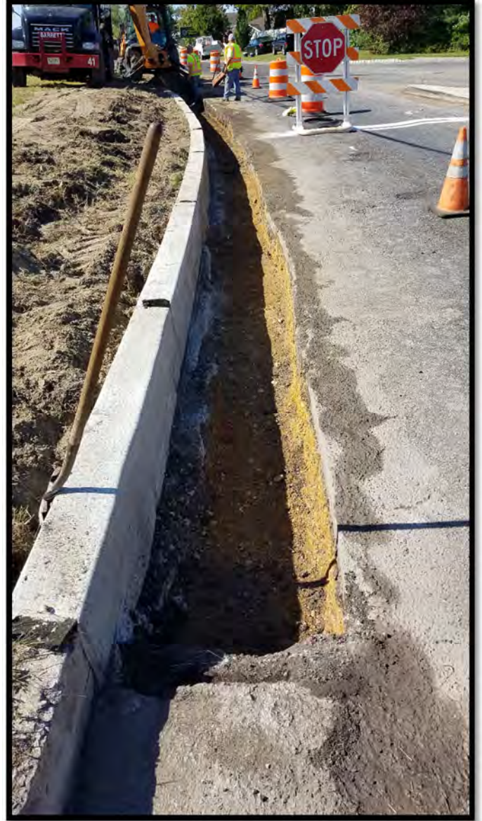
2. Boxing out for pavement restoration adjacent to new curb.