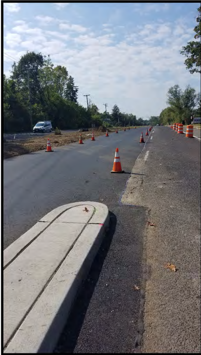
13. Looking south at completed asphalt overlay.