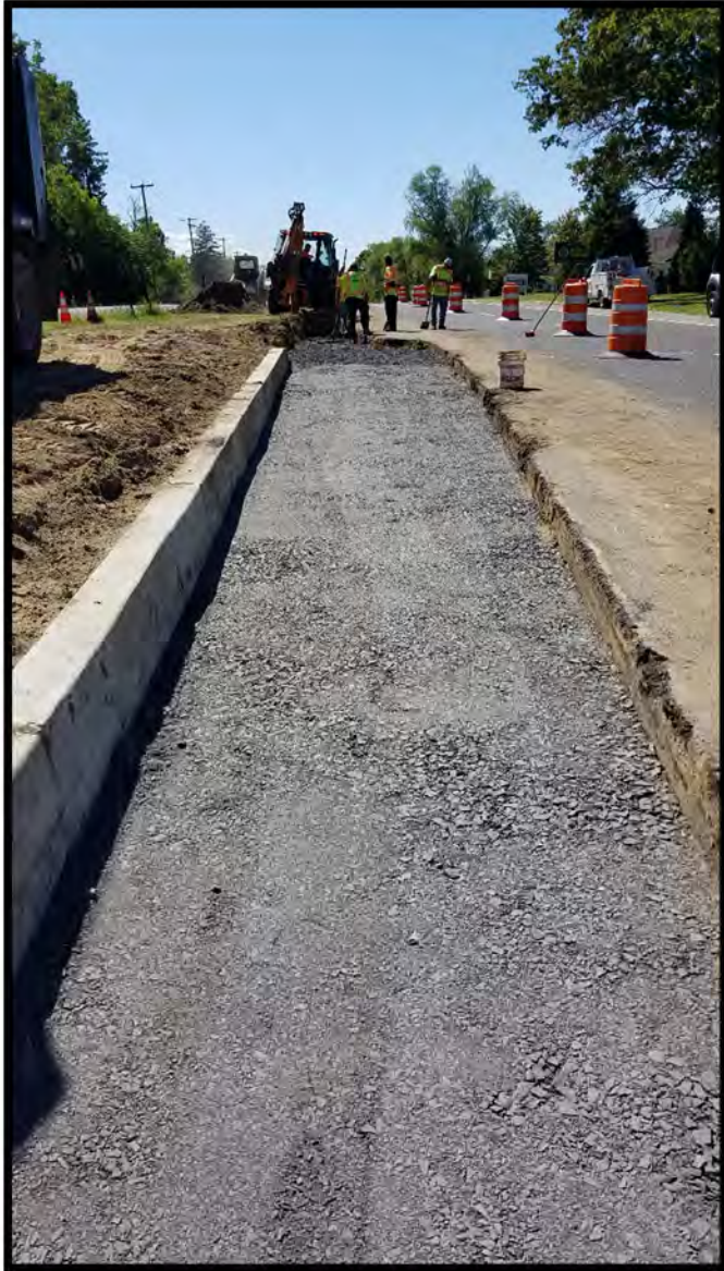
3. Compacted Dense Graded Aggregate at widened ramp area.