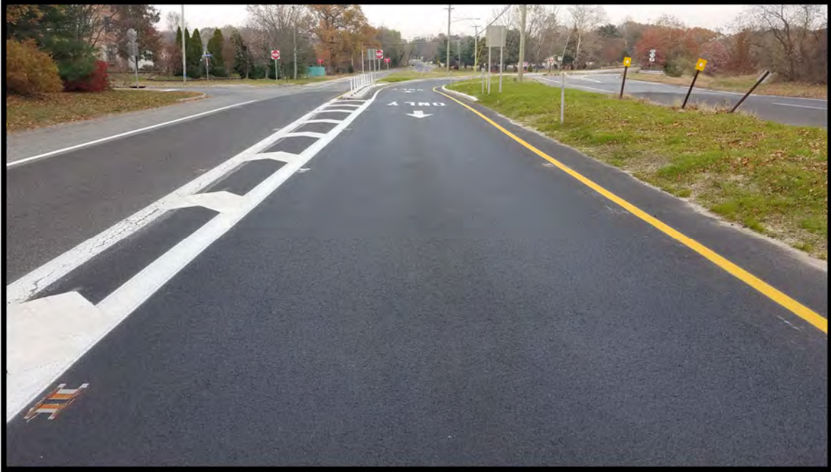
Looking north at completed project.