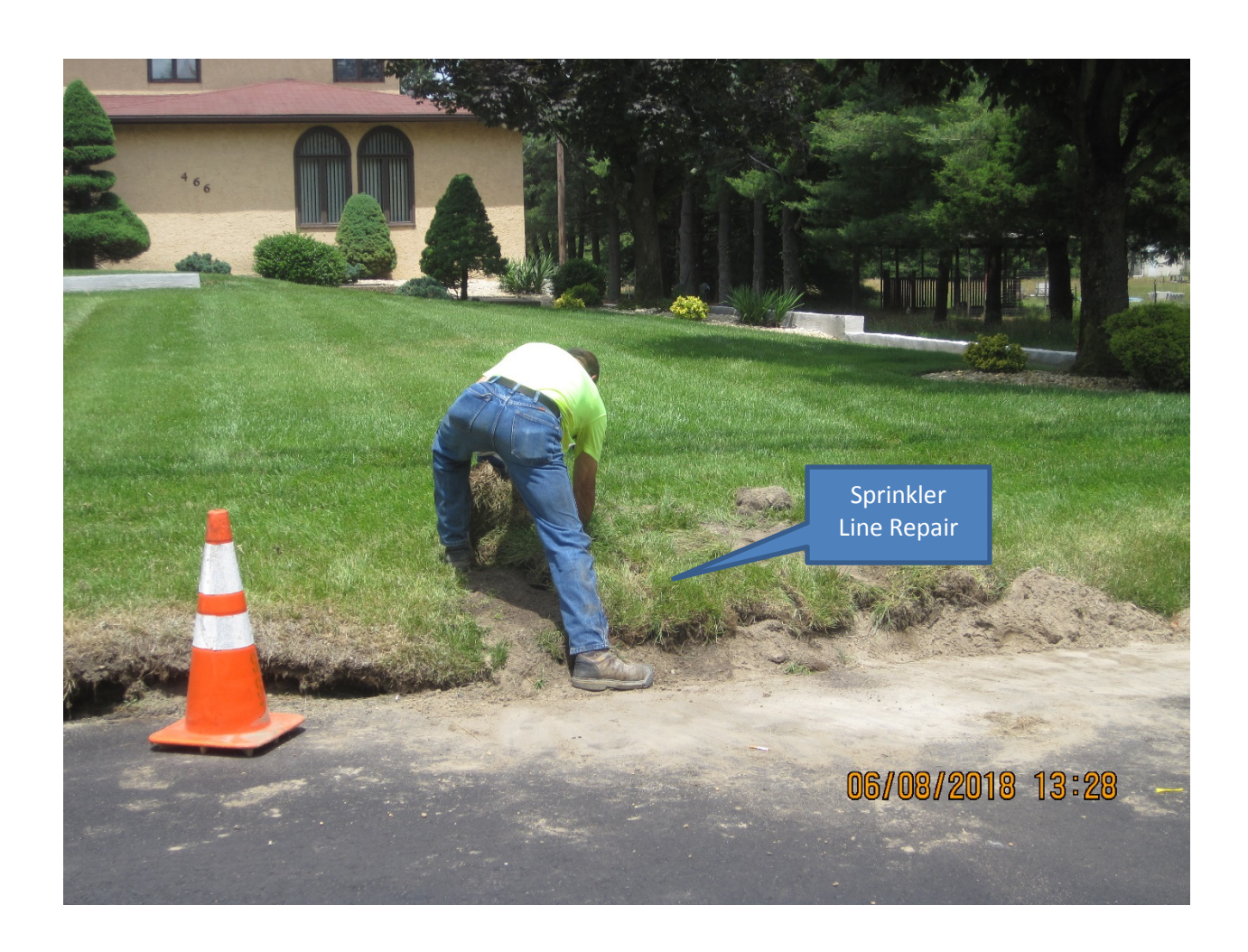
Figure 4 Sprinkler Line Repair (466 Jackson Rd.)