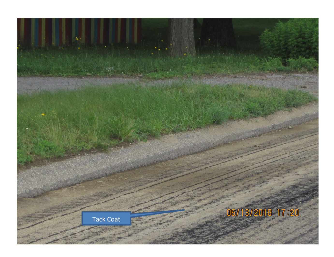
Figure 2 Tack Coat (Sta. 18+25 – 60+00 +/- LS)