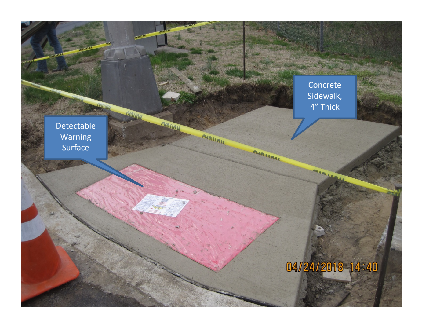
Figure 3 Concrete Sidewalk and Detectable Warning Surface Sta. 63+05 – 63+15 +/- (LS)