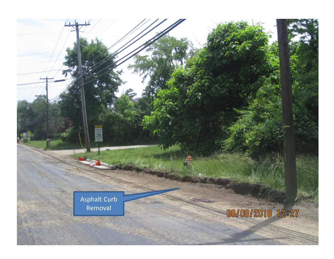
Figure 3 Asphalt Curb Removal (Sta. 33+50 – 34+00 +/-)