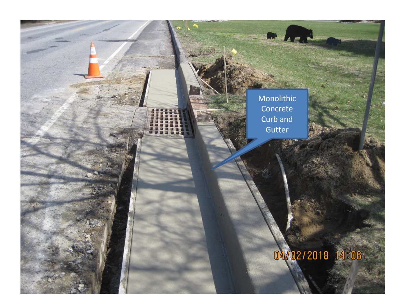
Figure 3 Monolithic Concrete Curb and Gutter Sta. 108+15 – 108+40 +/- (RS)