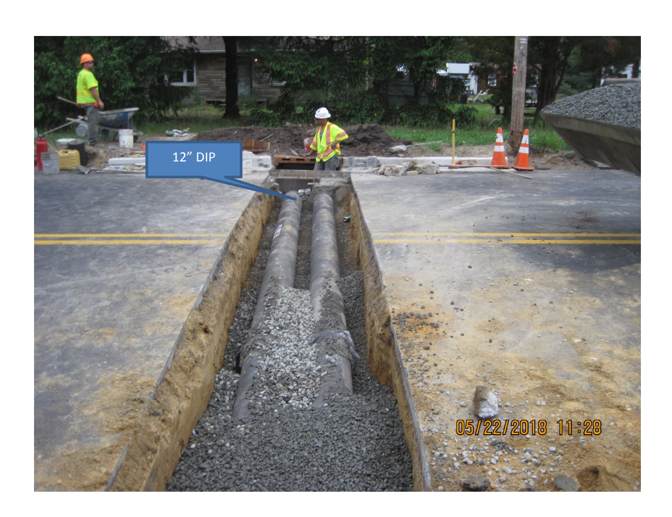
Figure 3 Installation of 12" DIP (Sta. 111+25 +/-)