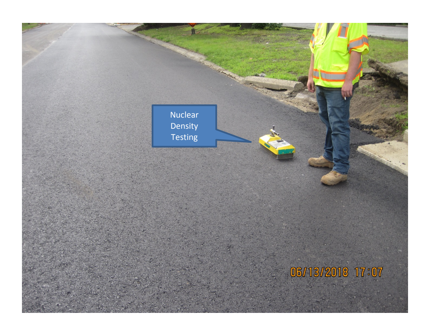
Figure 5 Nuclear Density Testing (Sta.53+50 +/- LS)