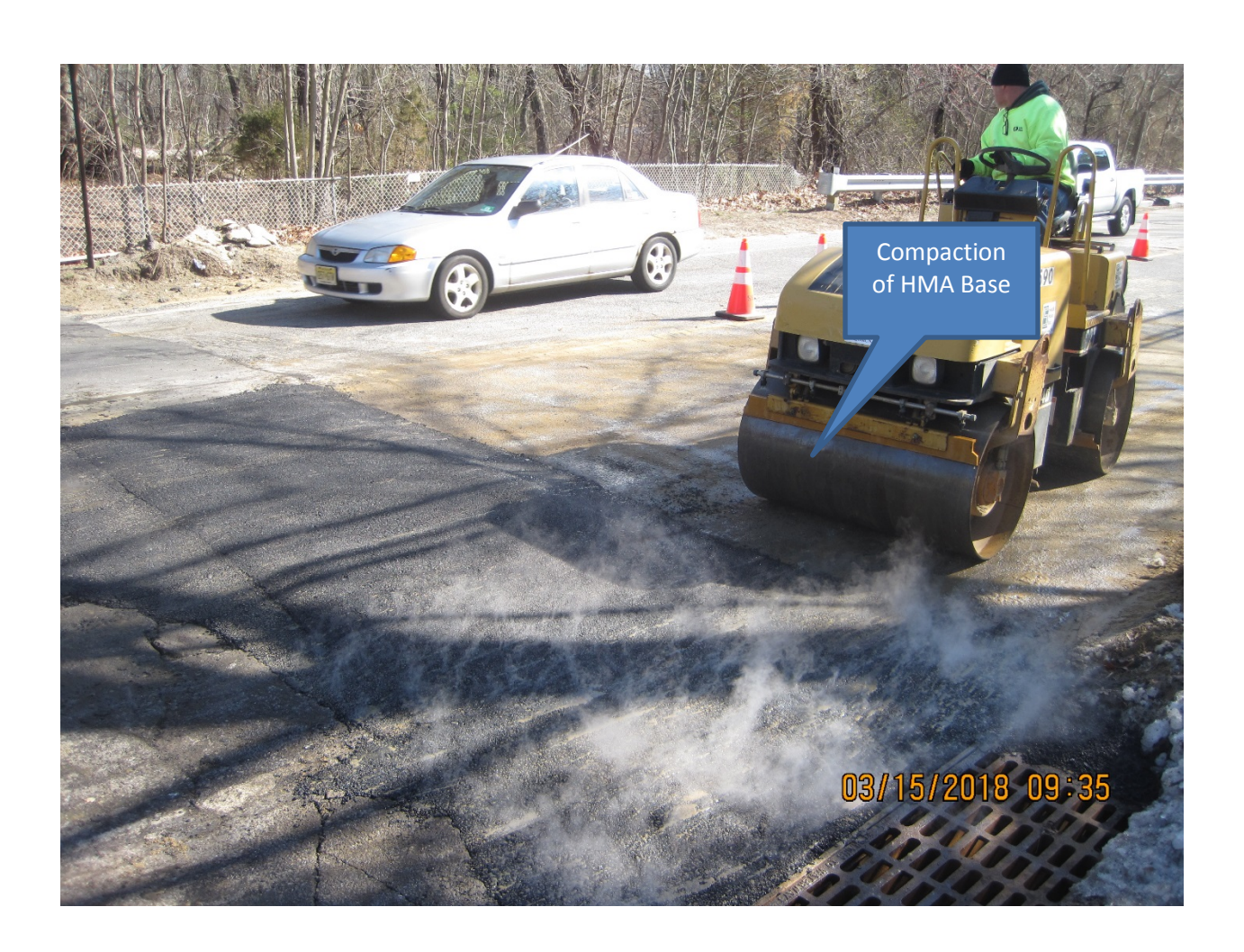
Figure 3 Compaction of HMA Base Sta. 69+28 (Crossing)