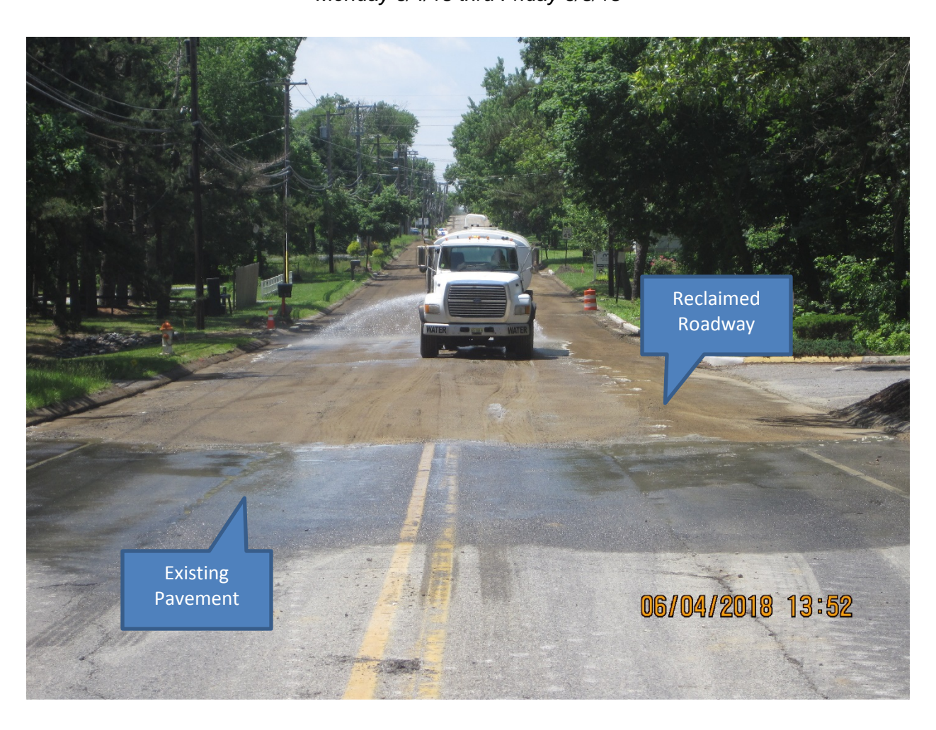
Figure 1 Full Depth Reclamation / Existing Roadway (Sta. 43+00 – 60+00 +/-)

Townships of Berlin & Waterford County of Camden, New Jersey Weekly Progress Report Monday 6/4/18 thru Friday 6/8/18