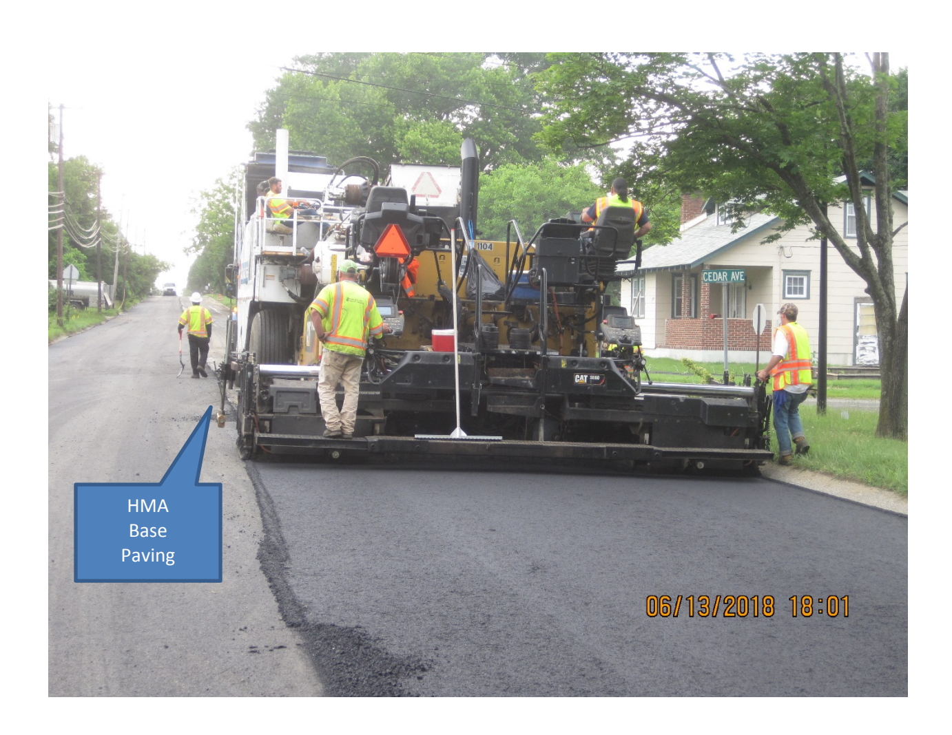
Figure 3 HMA Base Paving (Sta. 38+00 +/- LS)