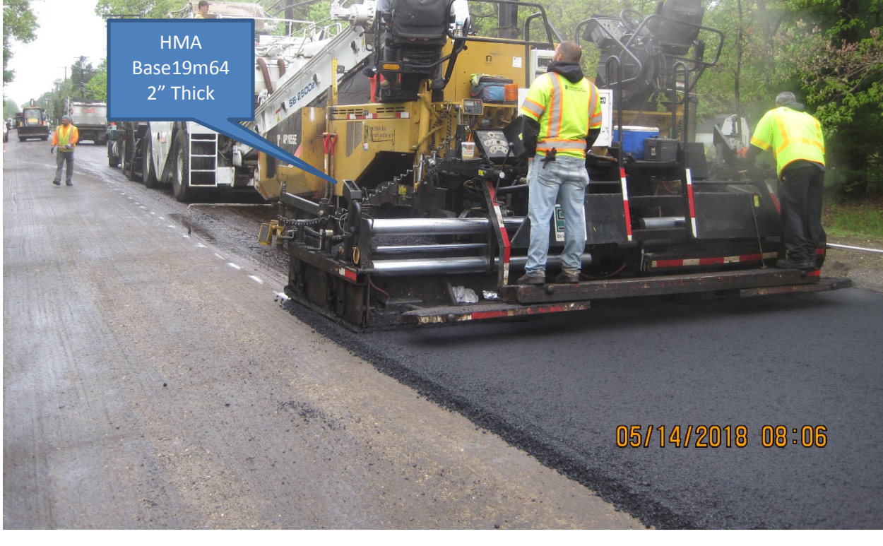
Figure 2 HMA Base, 19m64, 2" Thick Sta. 72+25 – 121+00 +/-