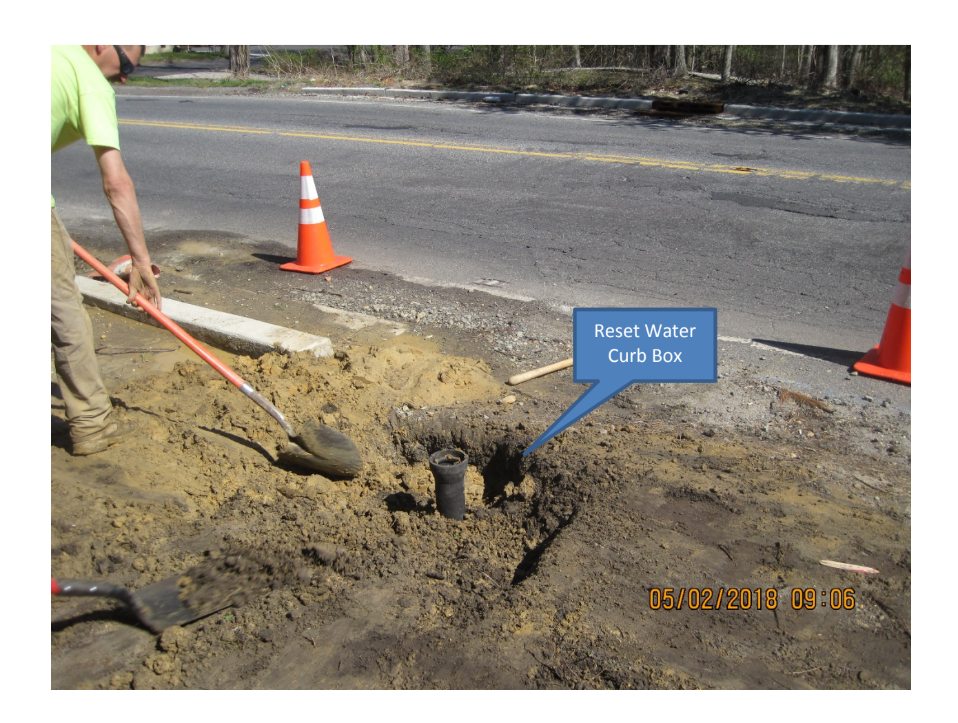
Figure 7 Reset Water Curb Box at 259 Jackson Rd. (LS)