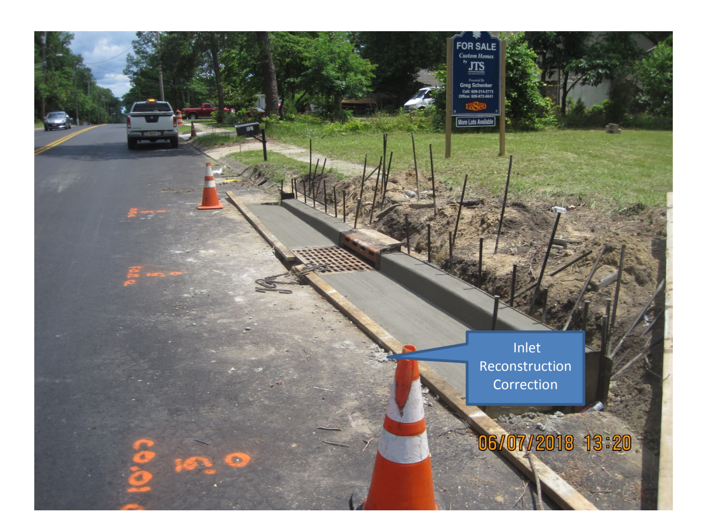
Figure 2 Inlet Reconstruction Correction (Inlet No. 62)