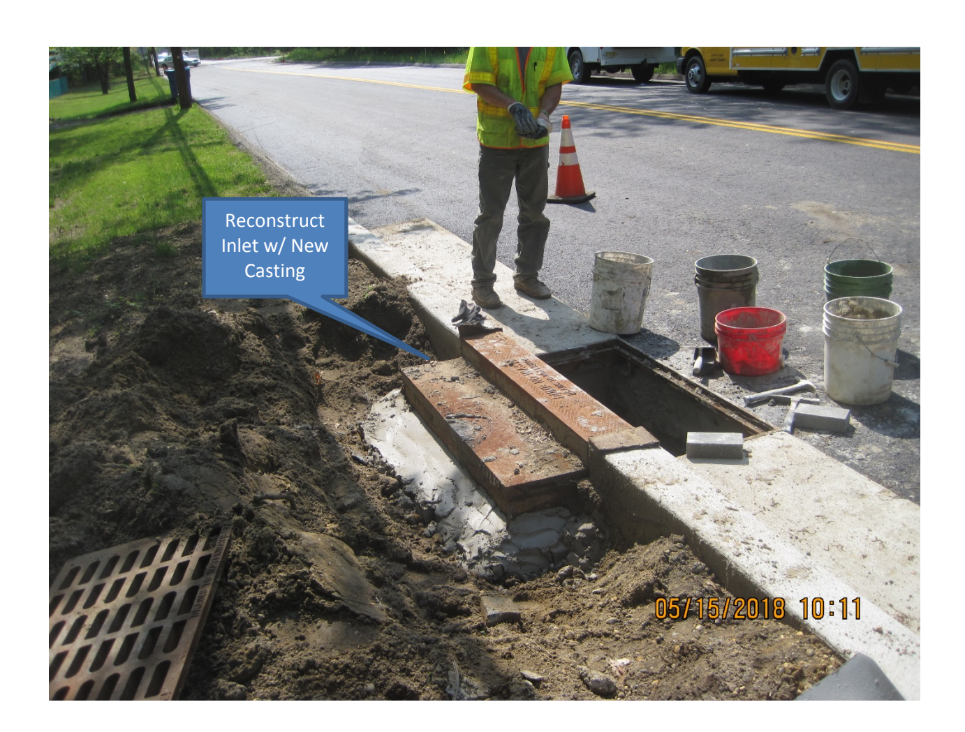
Figure 3 Reconstruct Inlet w/ New Casting Inlet No.84 (LS)