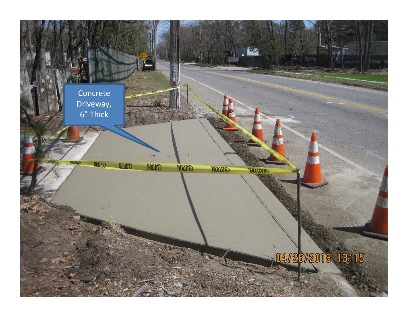
Figure 2 Concrete Driveway, 6" Thick Sta. 80+30 – 80+50 +/- (LS)