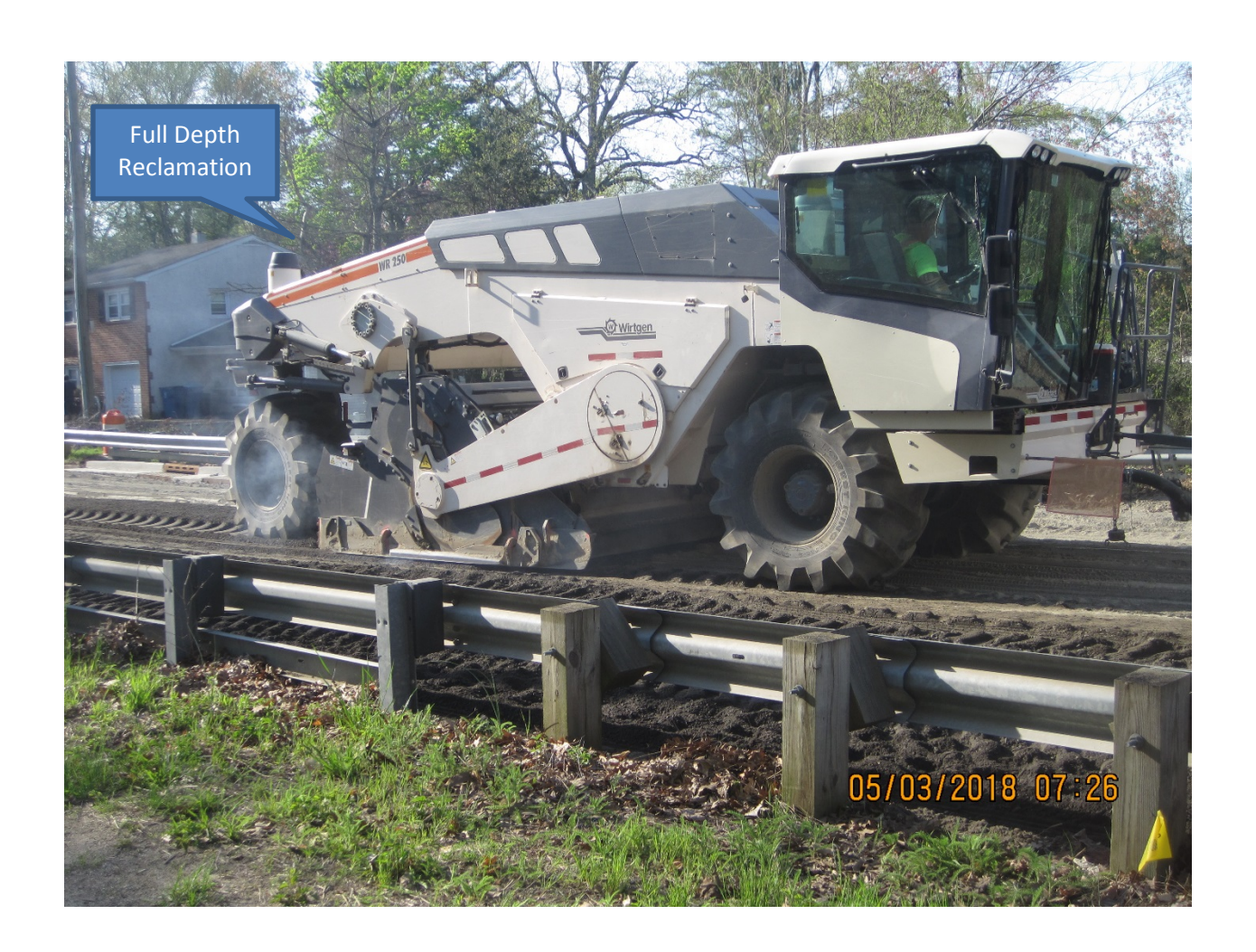
Figure 5 Full Depth Reclamation between Sta. 78+50 – 121+00 +/-