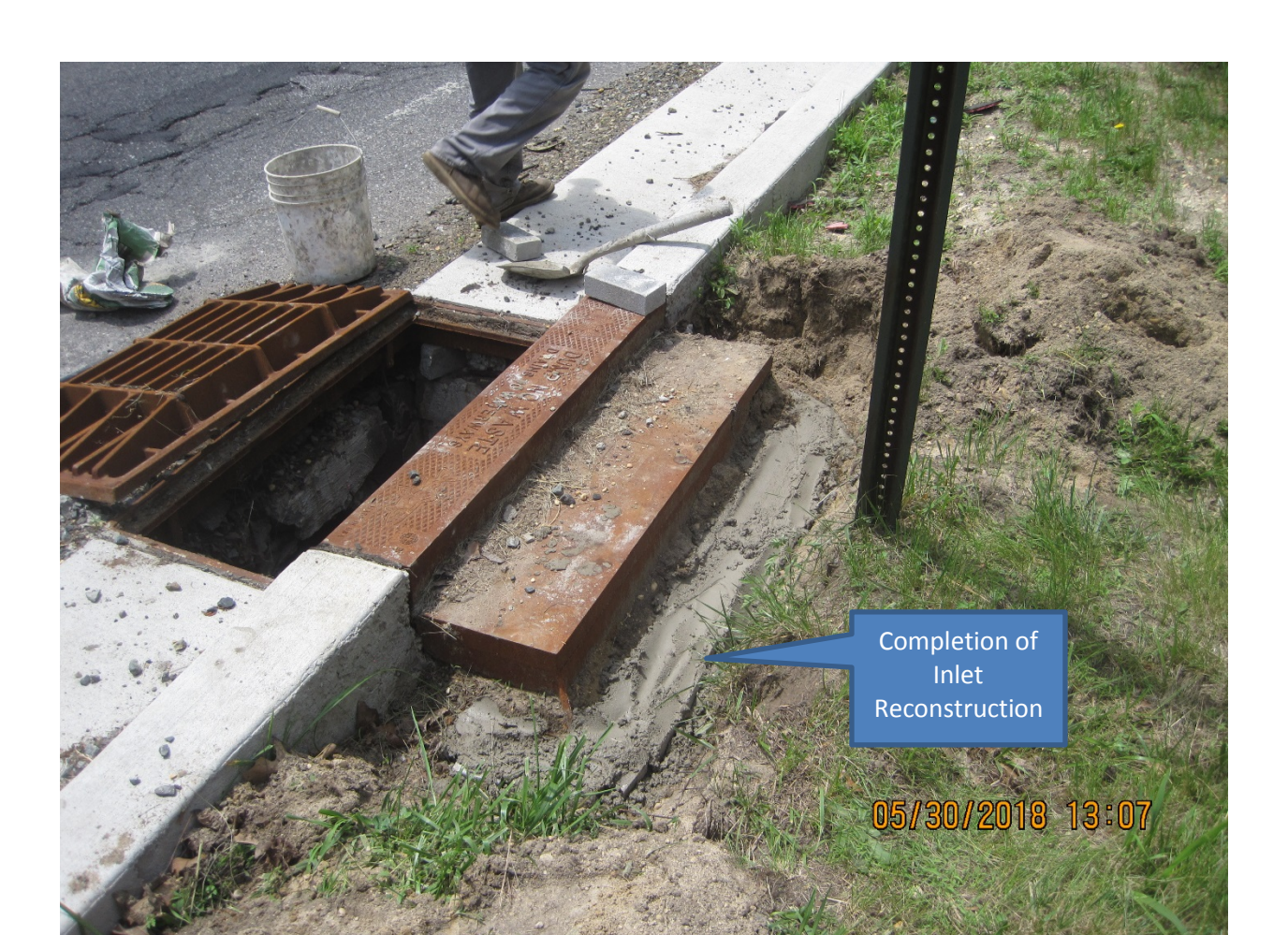
Figure 2 Completion of Inlet Reconstruction (Inlet No. 28)