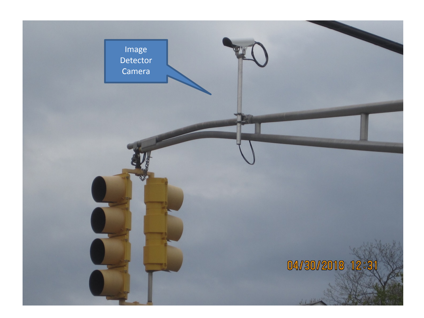
Figure 6 Image Detector Camera at the Intersection of Jackson Rd. and Hopewell Rd.