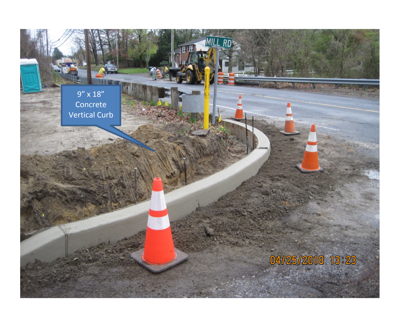
Figure 4 9" x 18" Concrete Vertical Curb Sta. 94+65 – 94+80 +/- (LS)