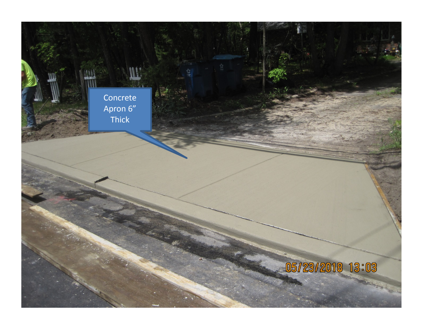
Figure 5 Concrete Apron 6" Thick (360 Jackson Rd.)