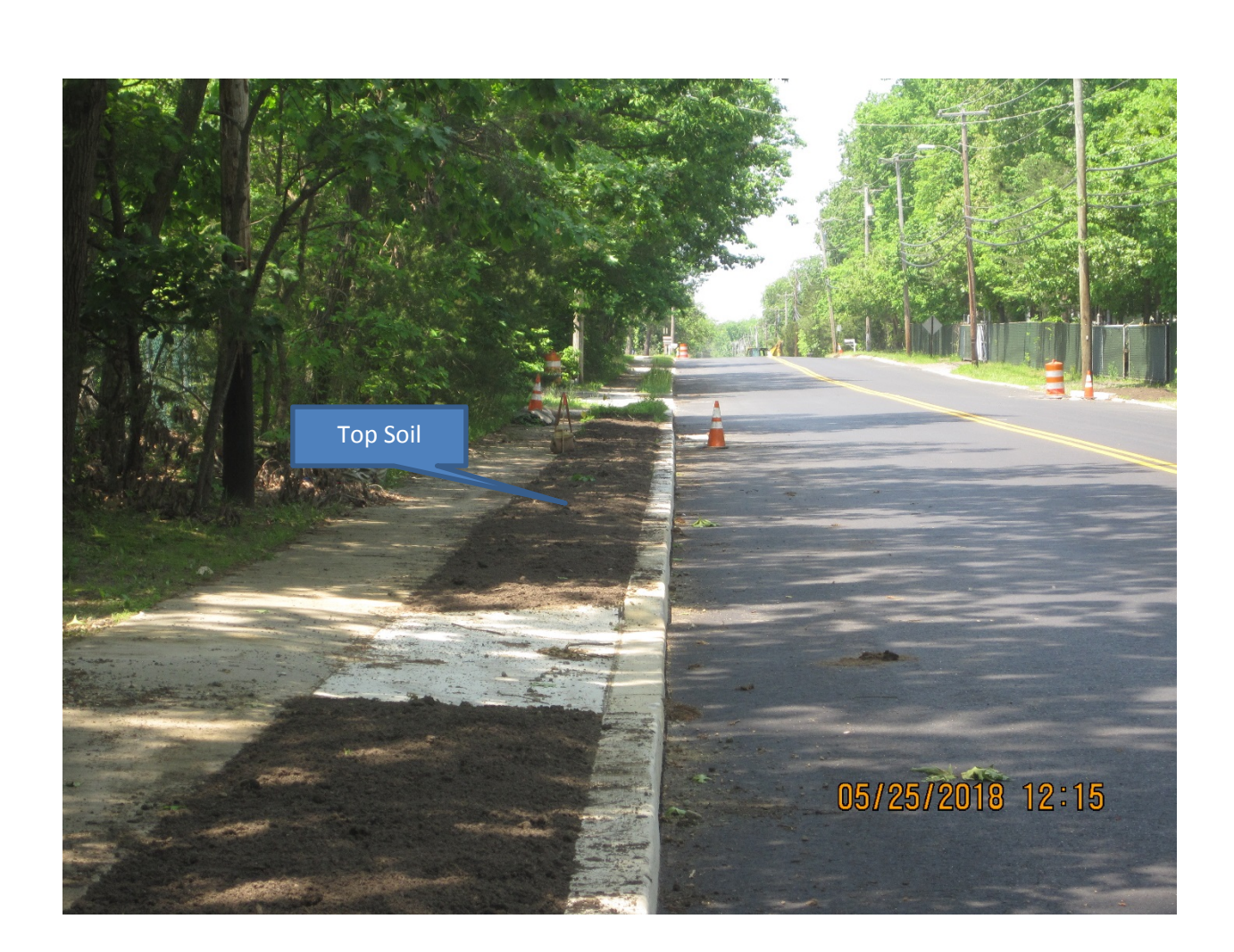
Figure 4 Placement of Top Soil (Various Locations)