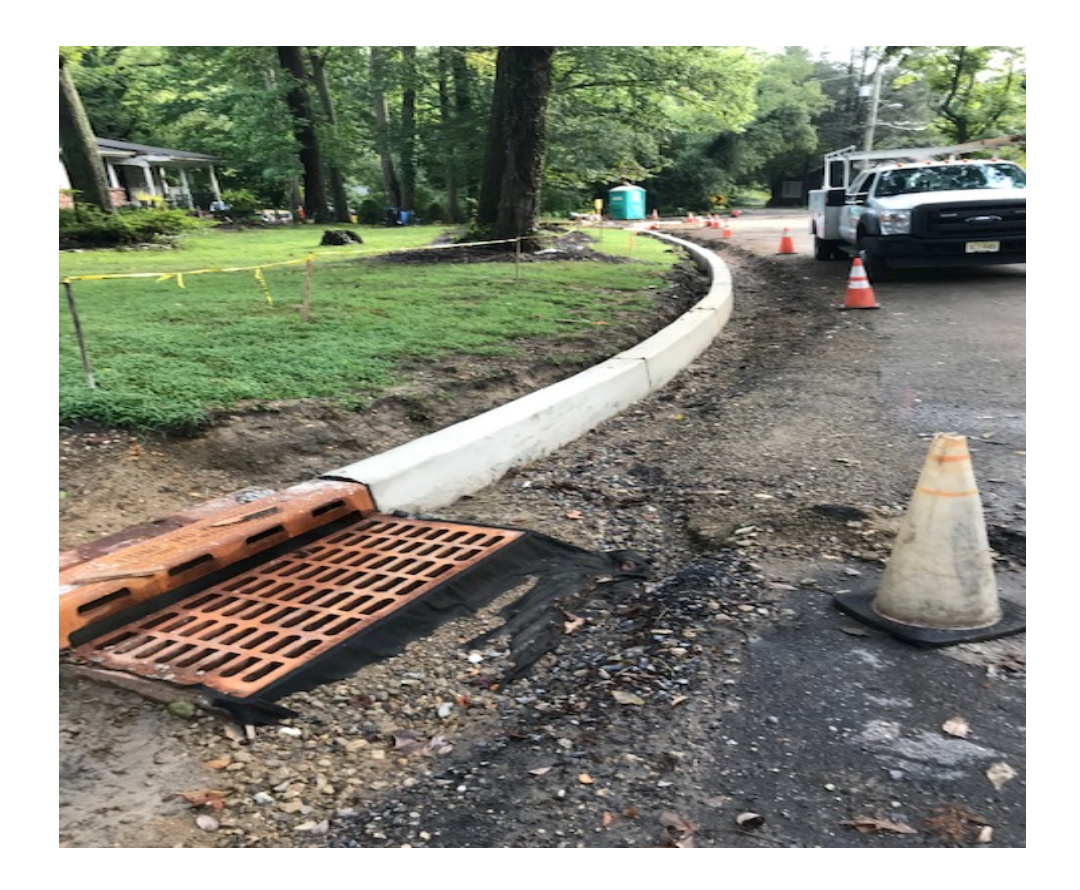
Figure: 2 – Reconstruct Curb and Handicap Ramp starting near Spring Landing Road (If and where directed)