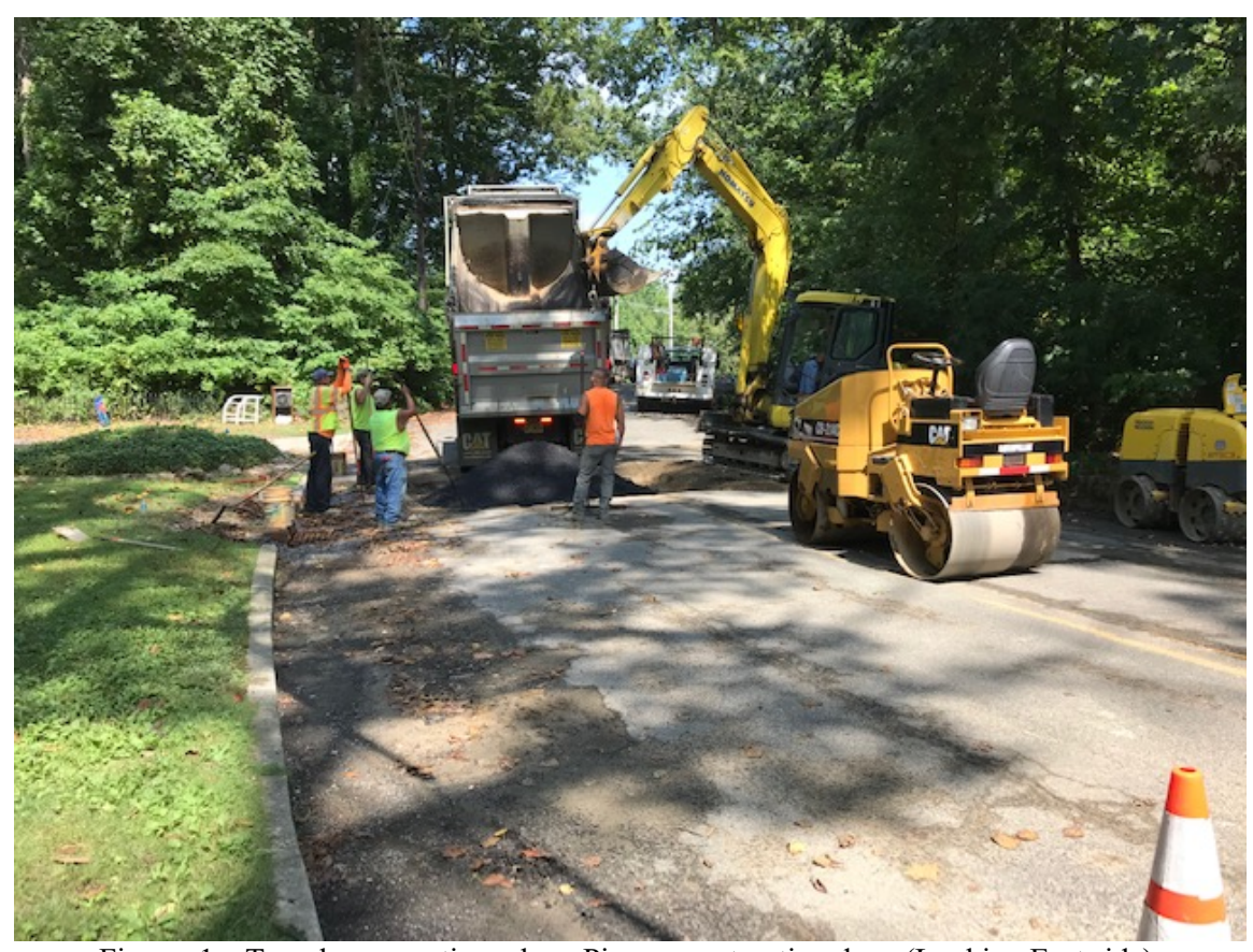
Figure: 1 – Trench compaction where Pipe reconstruction done (Looking East side).

Start work: 04/24/2019(Wednesday) Report#5-July 22,2019 to August 09,2019