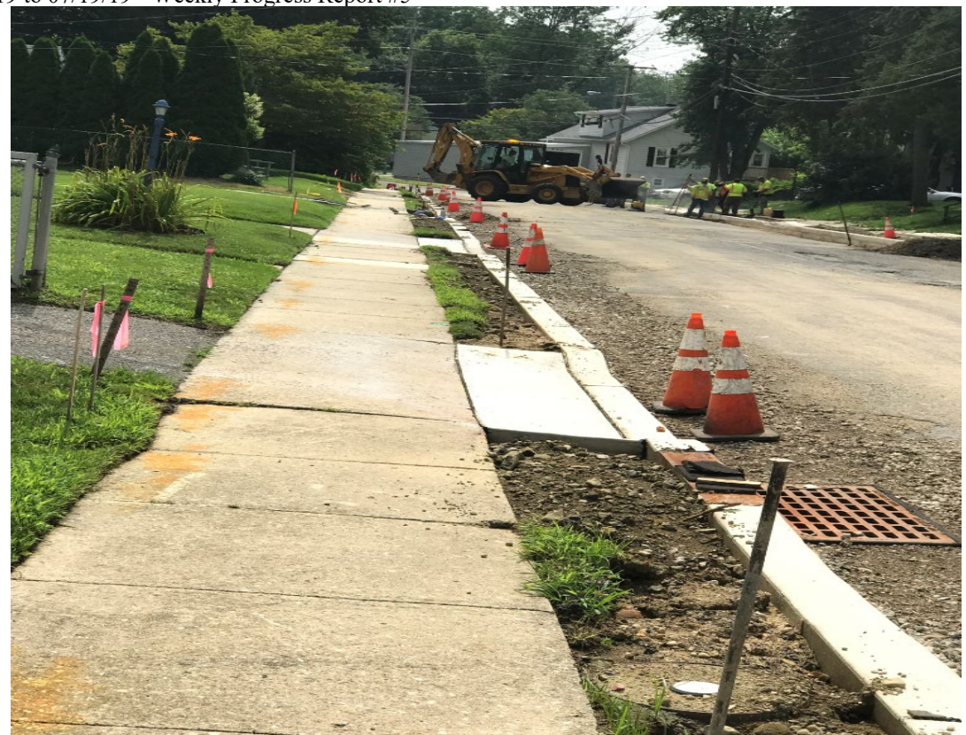
Figure: 2 – Reconstruct Curb and Handicap Ramp starting near W. park Ave (If and where directed)