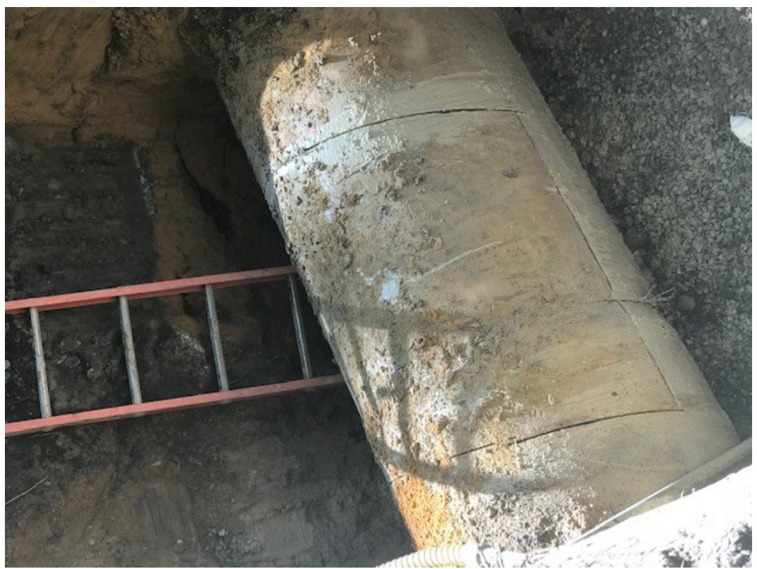
Figure: 2 – Utility pipe reconstruction on Central Ave on lake Blvd (Looking North side).