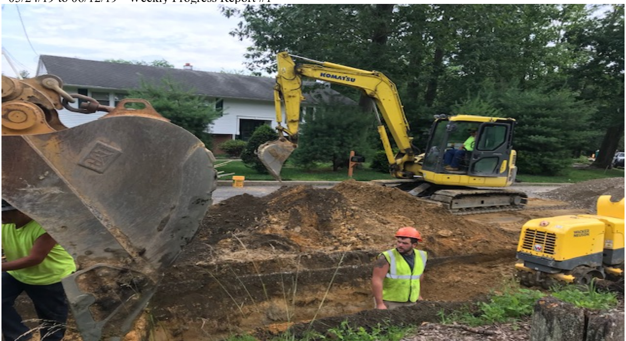
Figure: 2 – Reconstruct Pipe and inlet structure near Spring Landing Rd on lake