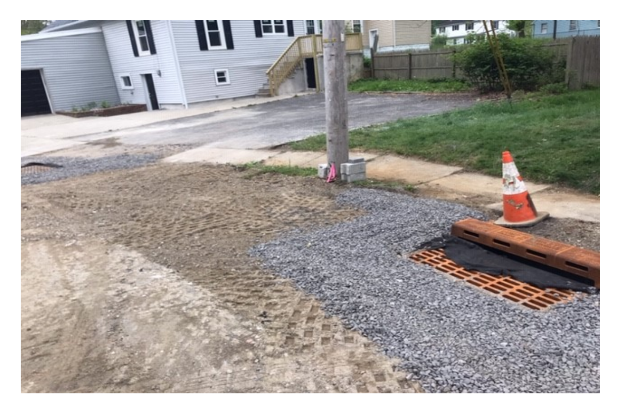
Figure: 3 – Utility structure rebuild near W.park Ave on lake Blvd (Looking East South side).