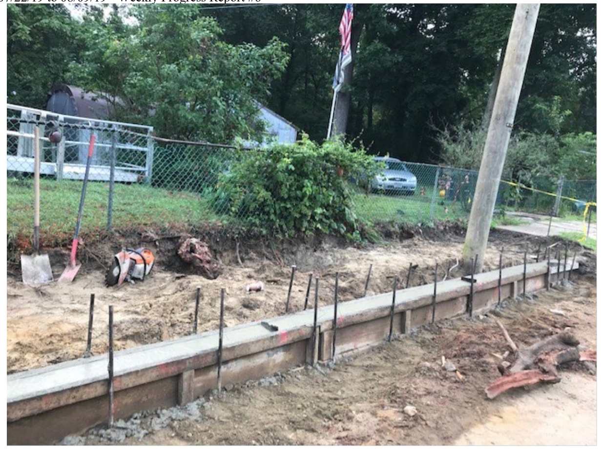
Figure: 2 – Reconstruct Curb and Handicap Ramp starting near Cottage Ave and Scott ave (If and where directed)