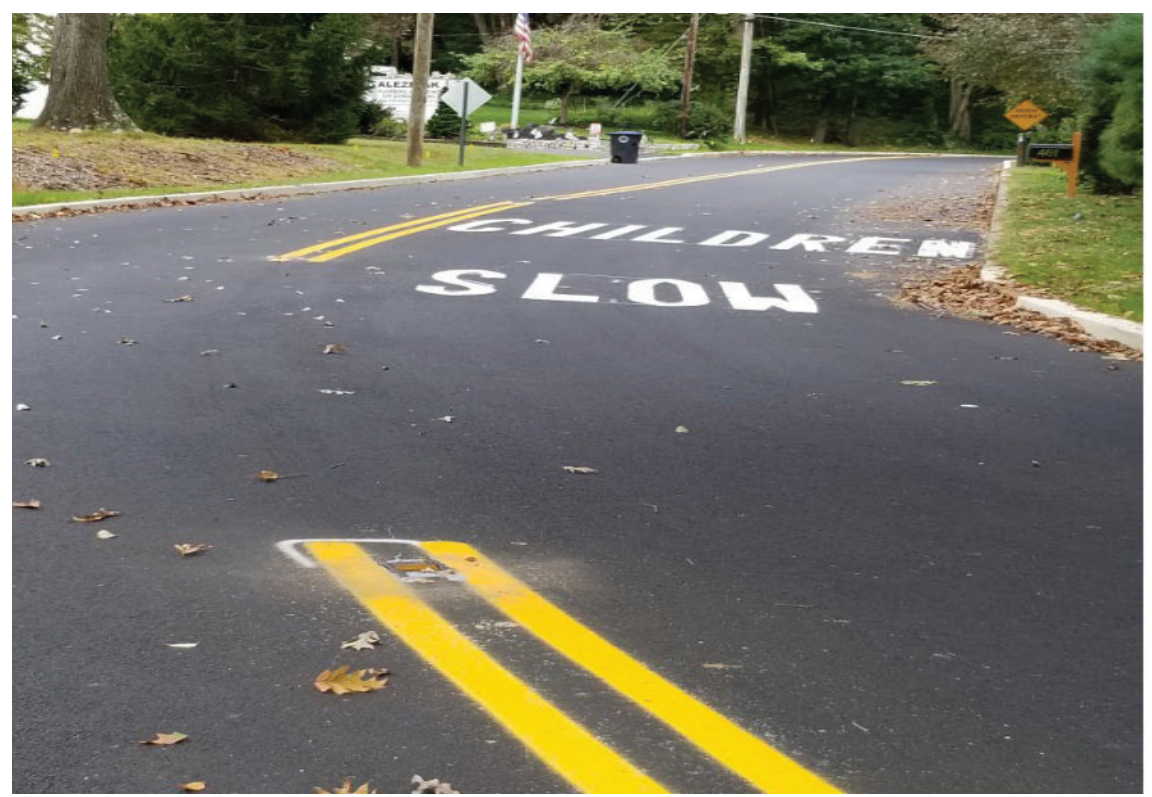
Figure: 2 –Repaint Centerlines and Traffic control and Signage installed for entire road (If and where directed)