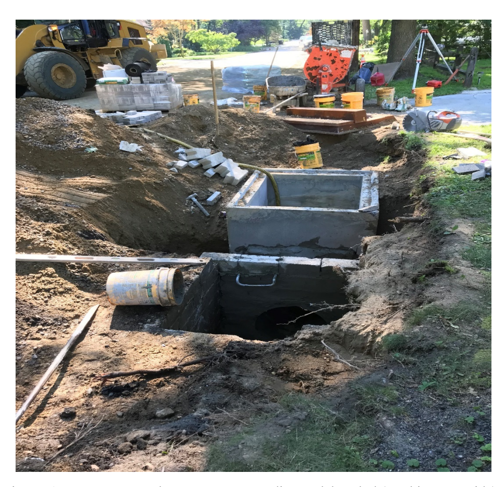
Figure: 1 – Reconstruct Inlet near Manor Landing on lake Blvd (Looking East side).

Start work: 04/24/2019(Wednesday) Report#2-July 1,2019 to July 19,2019