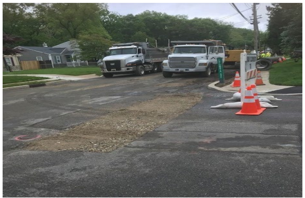
Figure: 3 – Utility pipe and 8" Water Main relocated Columbia Ave on lake Blvd (Looking North side).