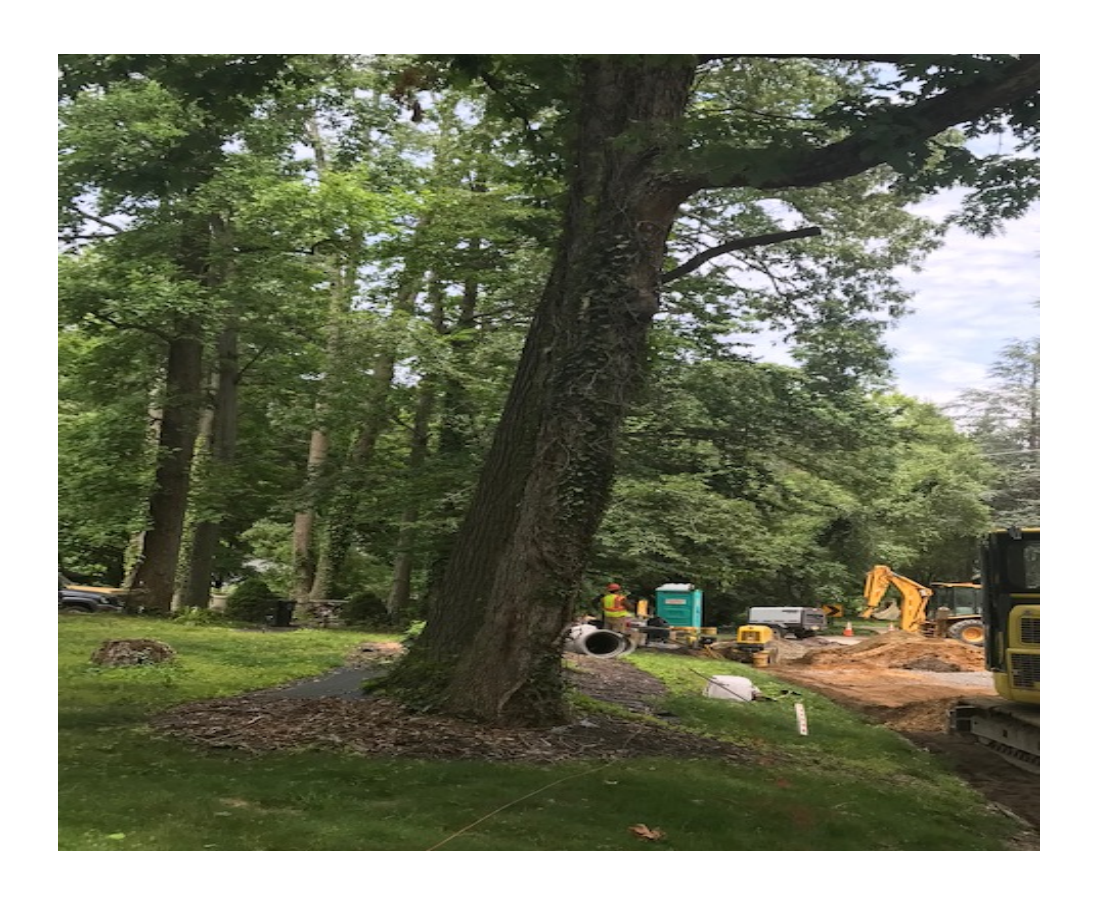
Figure: 1 – Utility pipe reconstruction on Central Ave on lake Blvd (Looking East side).

Start work: 04/24/2019(Wednesday) Report#2-June 12,2019 to June 28,2019