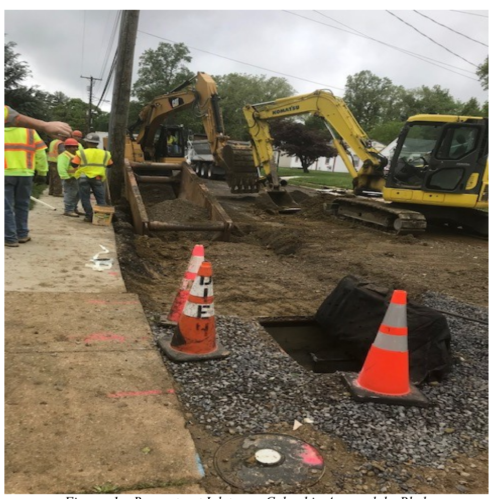
Figure: 1 – Reconstruct Inlet near Columbia Ave on lake Blvd.

Start work: 04/24/2019(Wednesday) Report#2-May 3,2019 to May 20,2019