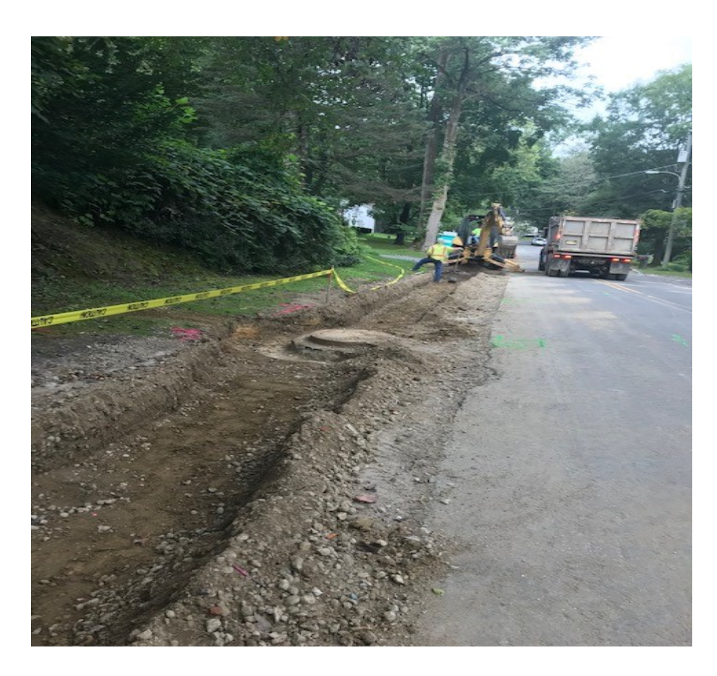
Figure: 1 – Curb Reconstruction Near Manor Landing Road (Looking East side).

Start work: 04/24/2019(Wednesday) August 09,2019 to August 23,2019