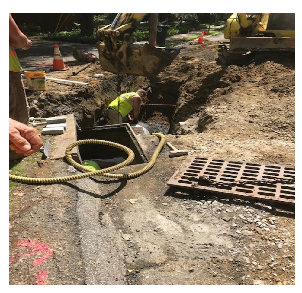
Figure: 1 – Reconstruct Pipe and inlet structure near Central Ave on lake Blvd.

Start work: 04/24/2019(Wednesday) Report#2-May 24,2019 to June 12,2019