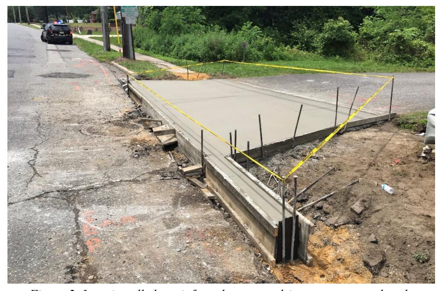
Figure 2. Lexa installed a reinforced concrete driveway apron and curb.