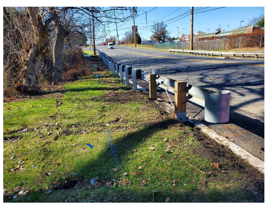
Figure 2. Guide rail placed along curb at Location 1 eastbound.