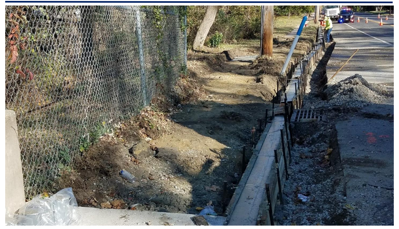
Figure 3. Lexa removing sidewalk at Location #5 westbound. Note the utility pole will need to be relocated.