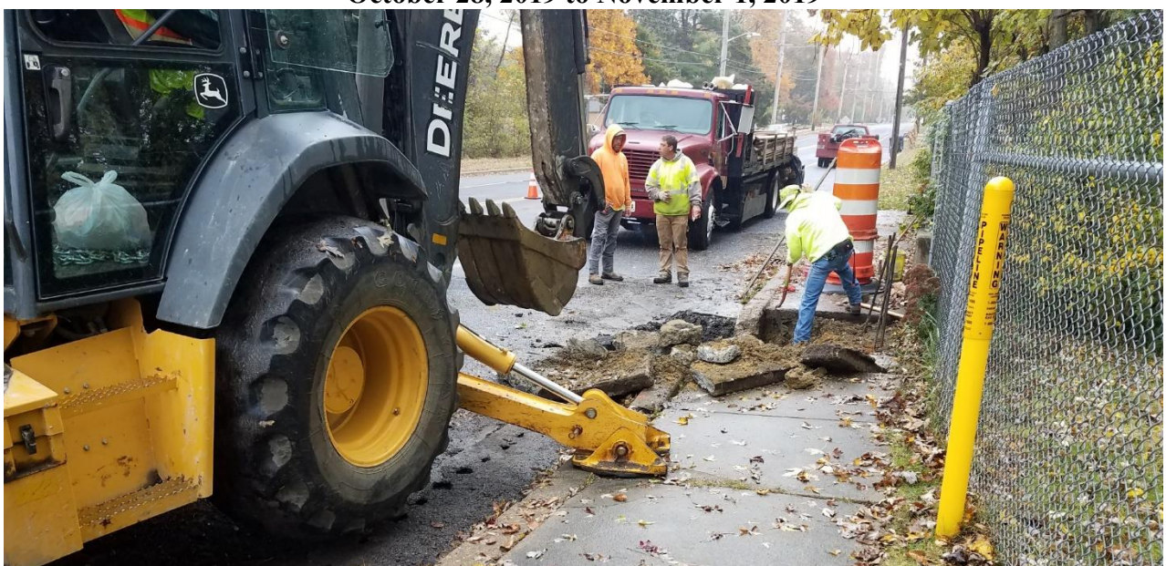
Figure 1. Lexa removing sidewalk at Location #5 eastbound.