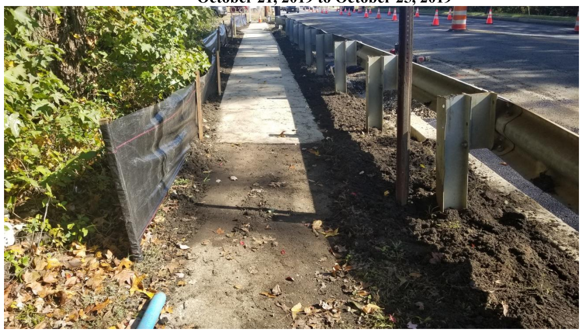
Figure 1. Lexa extended sidewalk at Location #3 westbound.