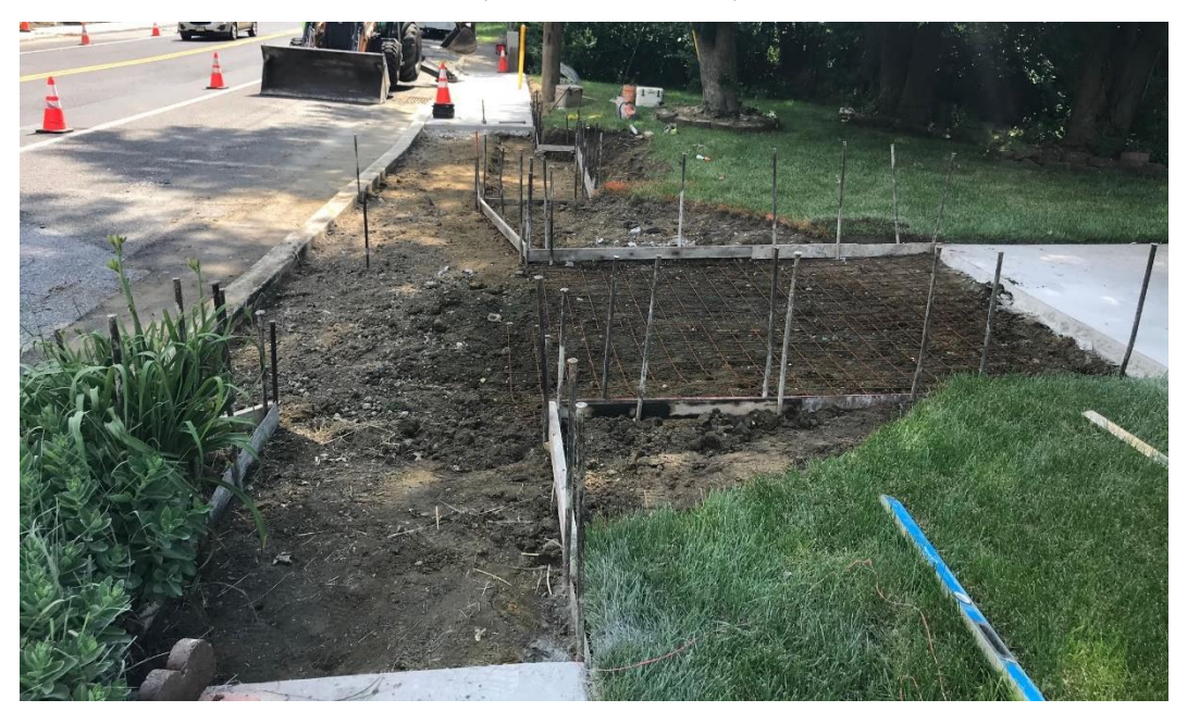
Figure 1. The sidewalk and driveway apron being prepared at Location #5.