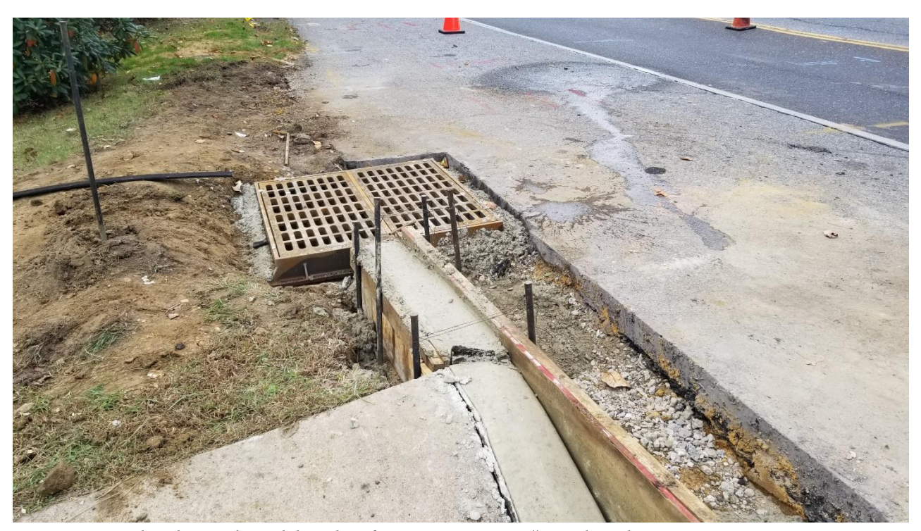
Figure 4. Lexa placed new inlet with bicycle safe grates at Location #4 eastbound.