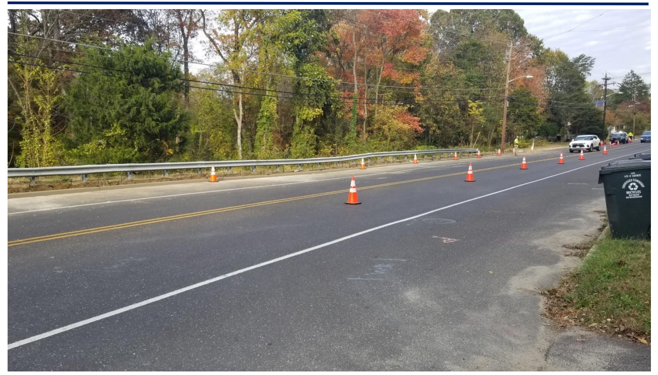
Figure 3. New curb along Location #3 westbound. Sidewalk to be restored.