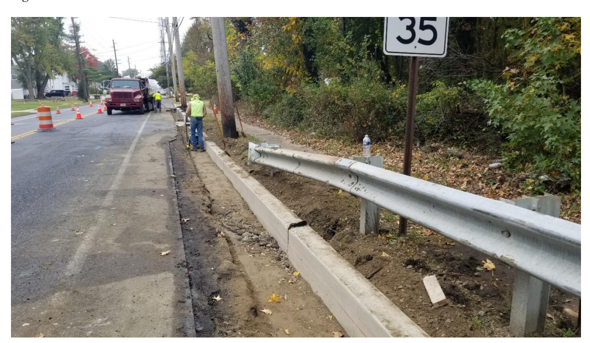
Figure 2. New curb at Location #3 westbound. Guiderail to be removed in this location.