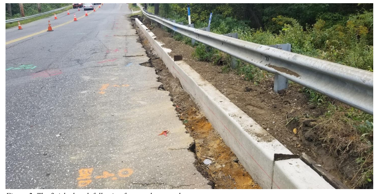
Figure 2. The finished curb following formwork removal.