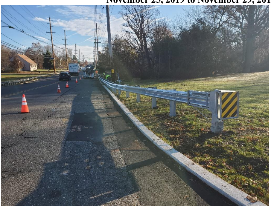
Figure 1. Guide rail placed along curb at Location 1 eastbound.

WEEKLY PROGRESS REPORT #7 November 25, 2019 to November 29, 2019