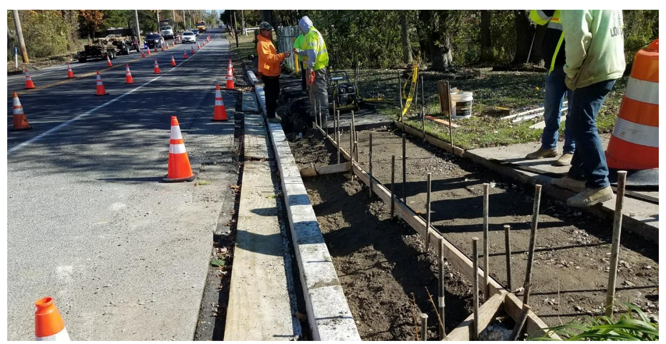
Figure 2. Lexa framing sidewalk subsequent to new curb installation at Location #5 eastbound.