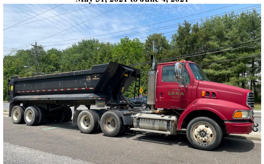
Figure 1. Lexa re-mobilized to the project site.