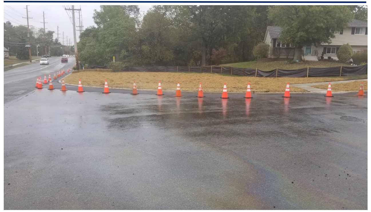
Figure 3. Location #1 eastbound finished.