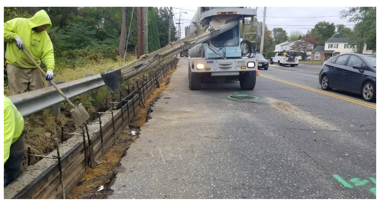
Figure 1. Lexa placed concrete curb at Location #1.