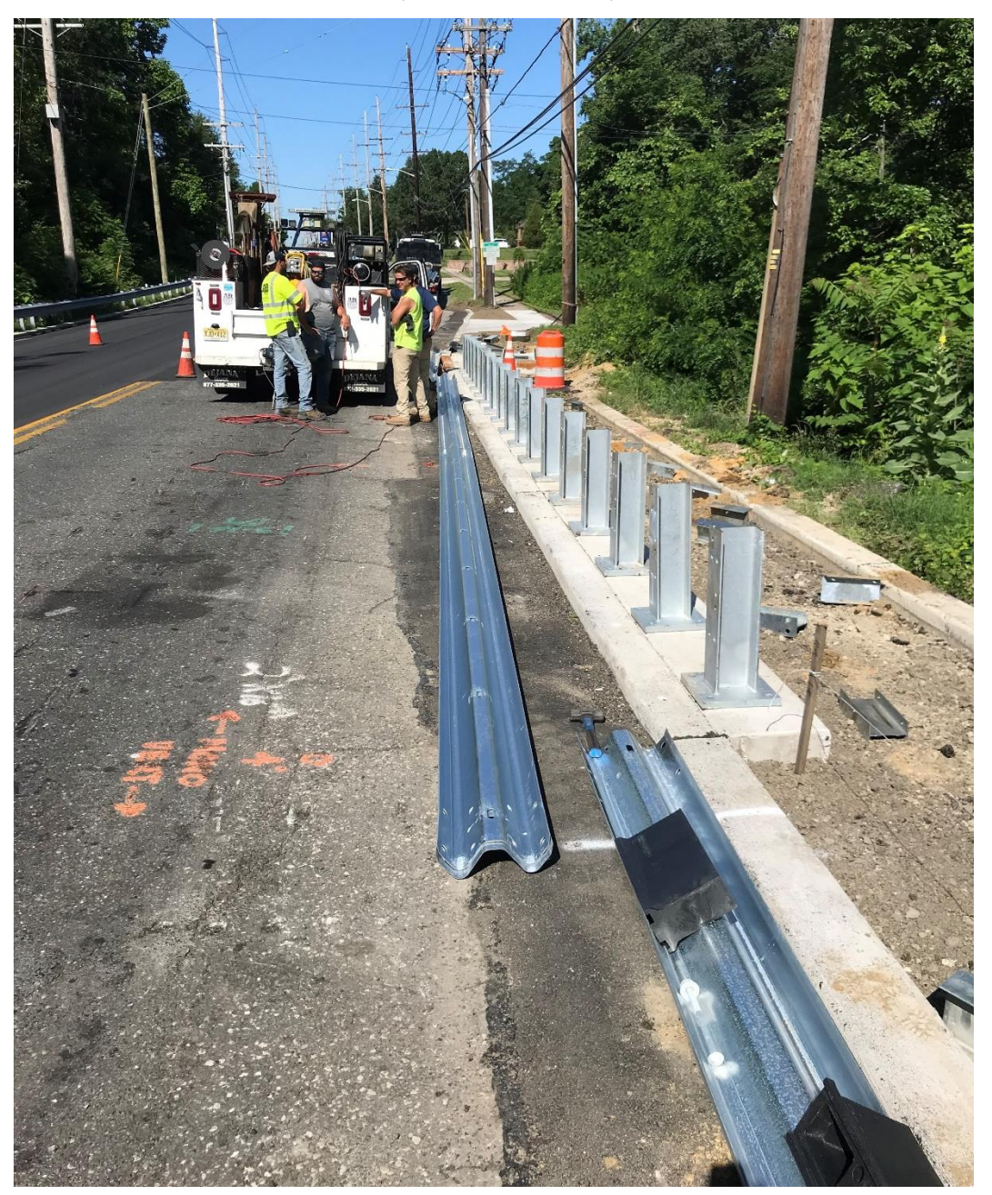
Figure 1. The guiderail subcontractor preparing to install Guiderail at Location #2.