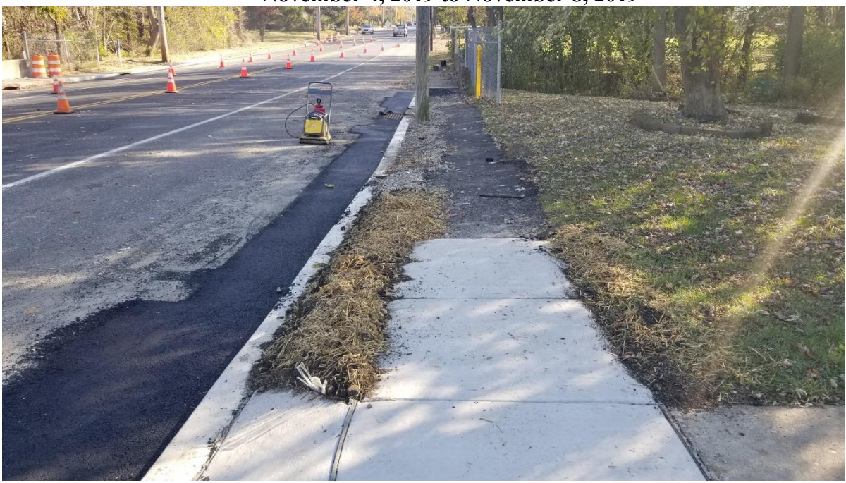
Figure 1. Location 5 eastbound after backfill and asphalt repair..