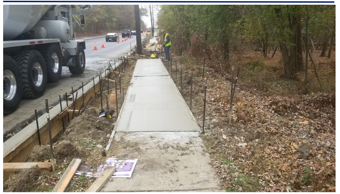
Figure 3. New sidewalk at Location 6 westbound. Note the utility pole will need to be relocated.