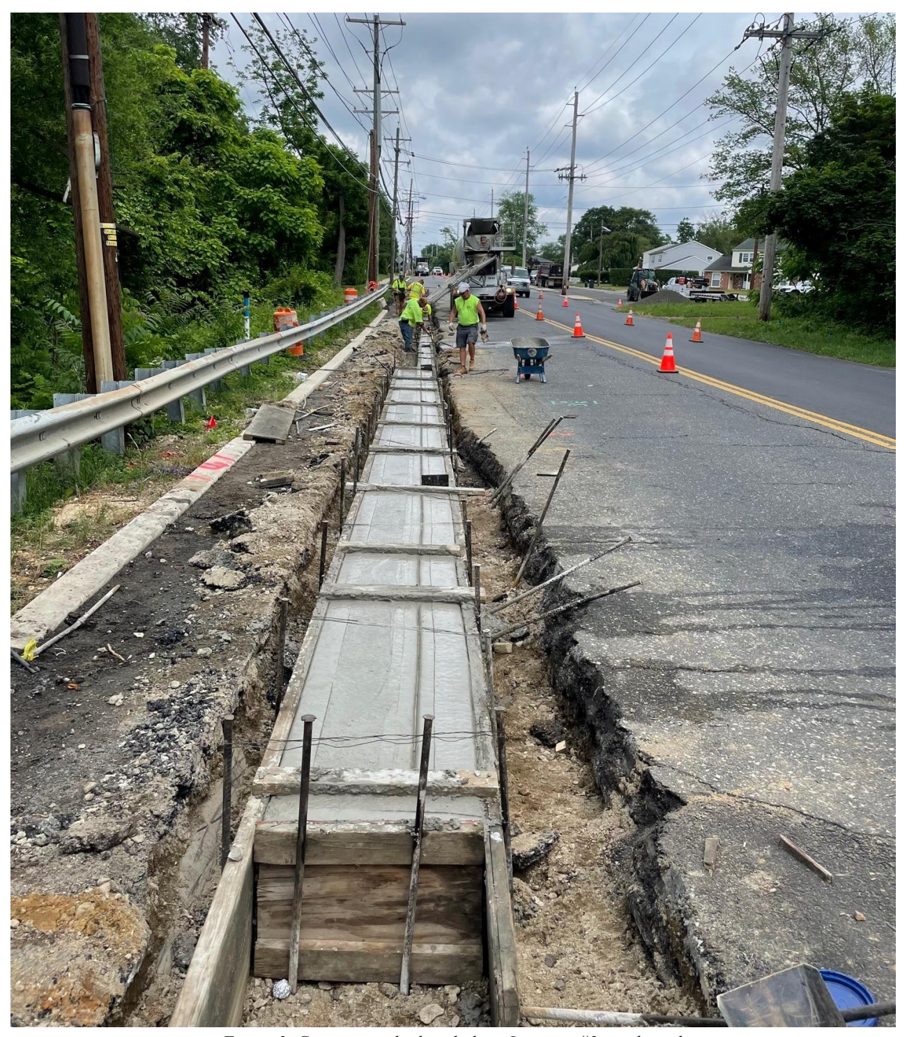
Figure 3. Concrete curb placed along Location #2 westbound.