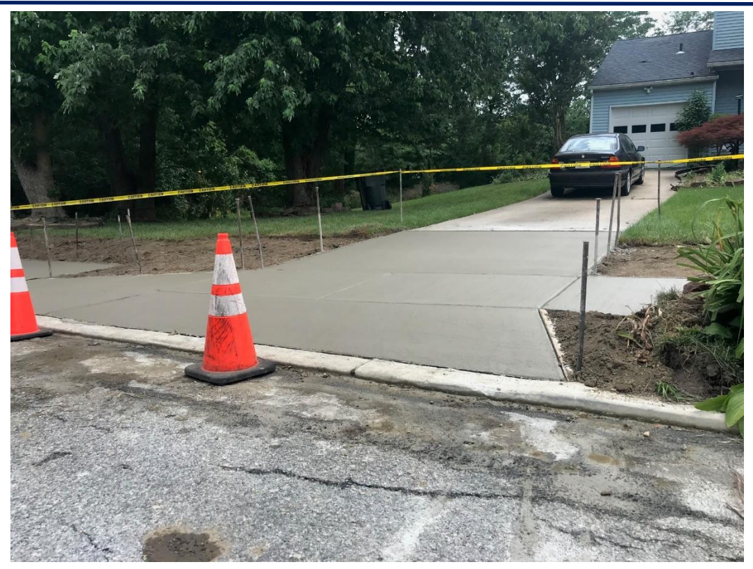
Figure 3. Installation of concrete for sidewalk and driveway apron #5