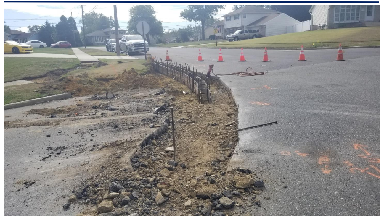
Figure 3. Lexa removed asphalt to extend the sidewalk and curb at the intersection of Albert Road and Evesham Road.