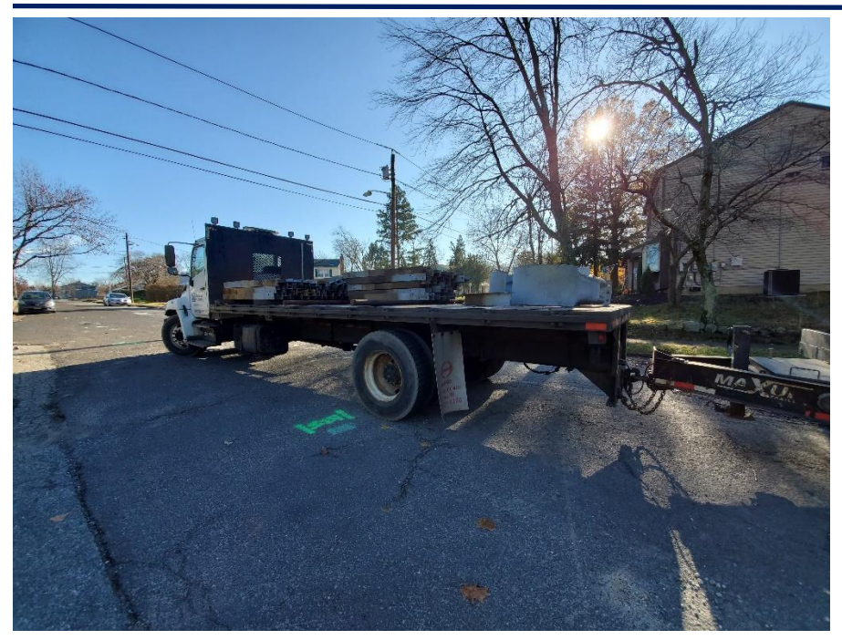
Figure 3. Existing guide rail removed from site at Location 1 and Location 2.