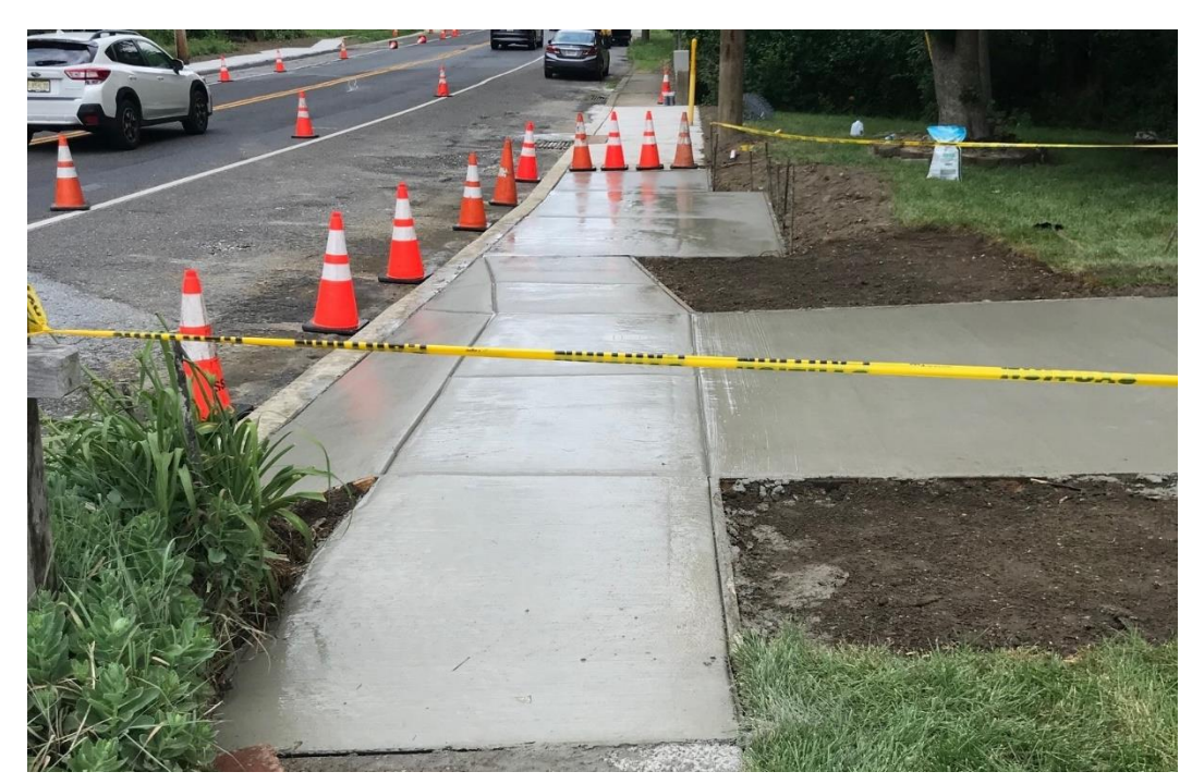
Figure 2. Installation of concrete for sidewalk and driveway apron #5.