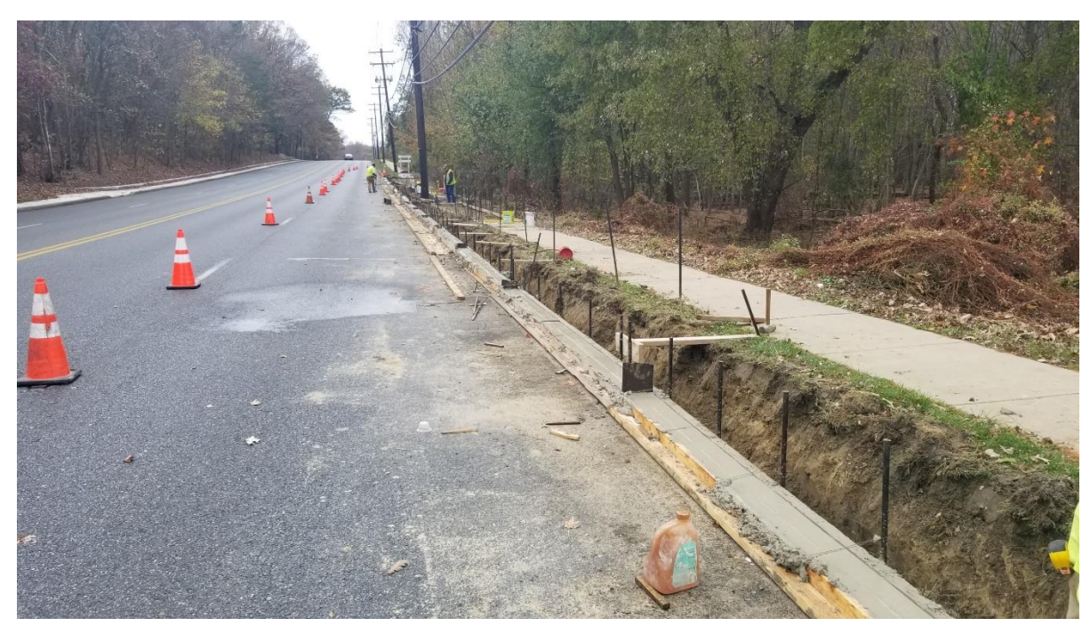
Figure 2. New curb placed at Location 6 westbound.