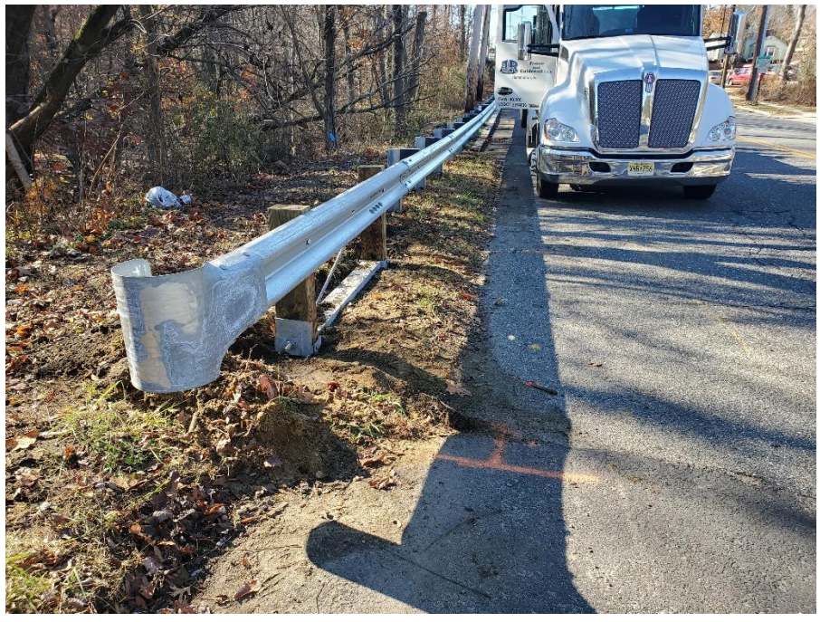
Figure 4. Guide rail placed along curb at Location 2 eastbound.