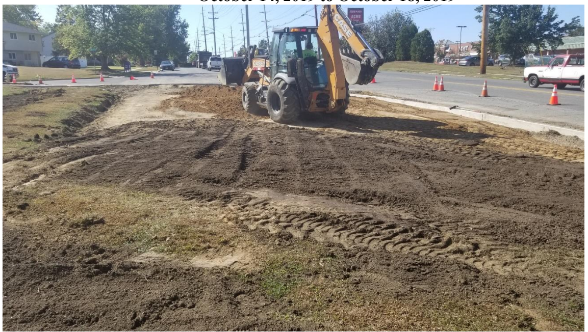
Figure 1. Lexa placed fill and topsoil behind curb at Location #1 eastbound.