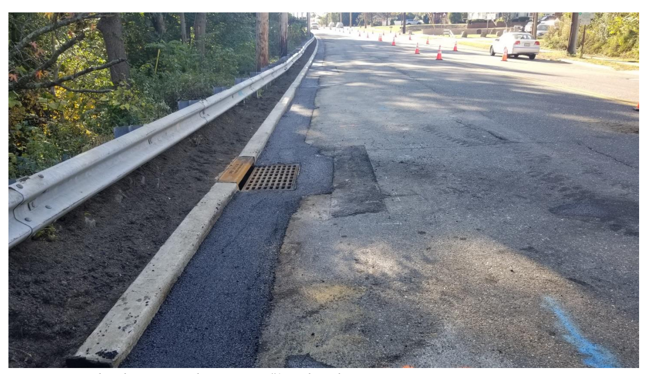
Figure 4. Lexa placed concrete curb at Location #2 eastbound.