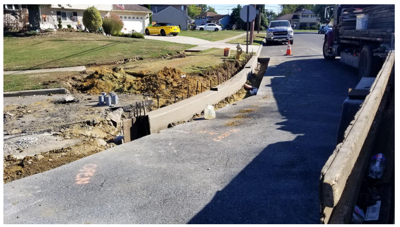
Figure 4. Lexa placed concrete curb at the intersection of Albert Road and Evesham Road.