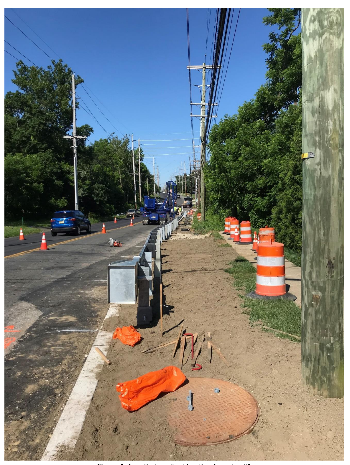
Figure 2. Installation of guiderail at Location #2.