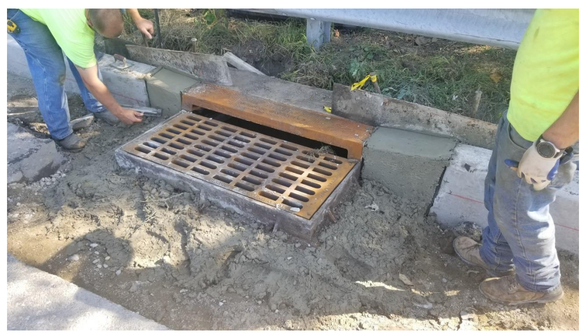
Figure 2. New curb sections and bicycle safe grates placed at Location 1 and 2.