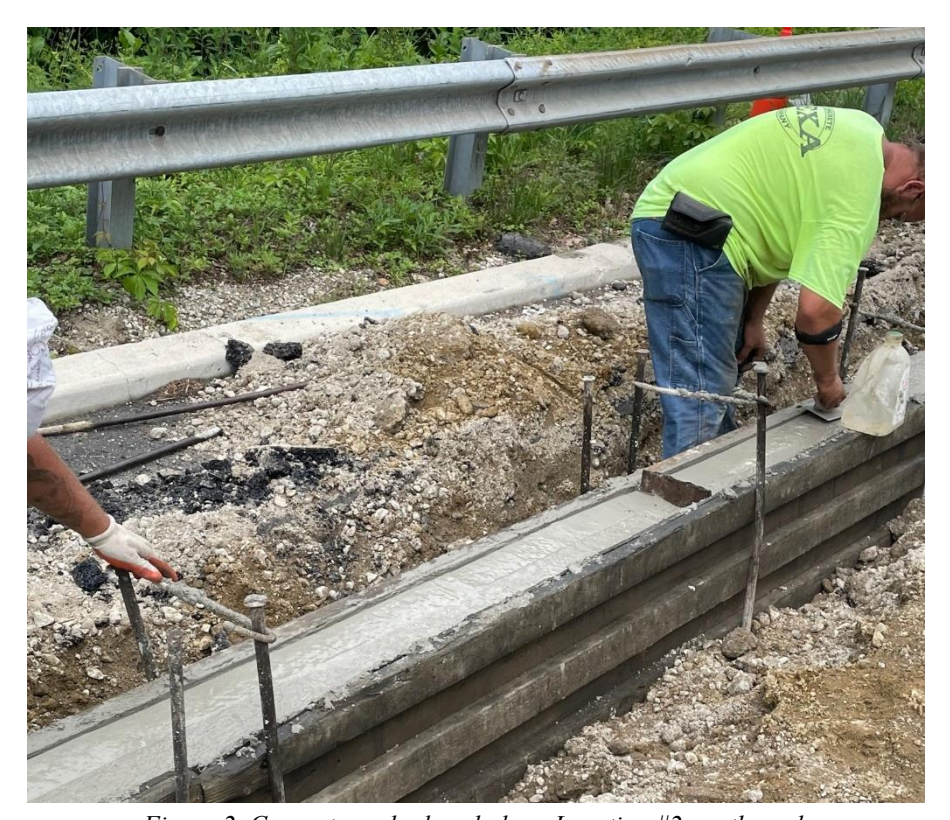
Figure 2. Concrete curb placed along Location #2 westbound.