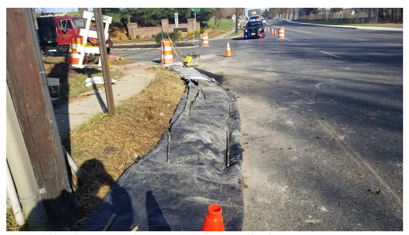
Figure 4. Cold-weather measures used at Location 6 to protect concrete from freezing temperatures.