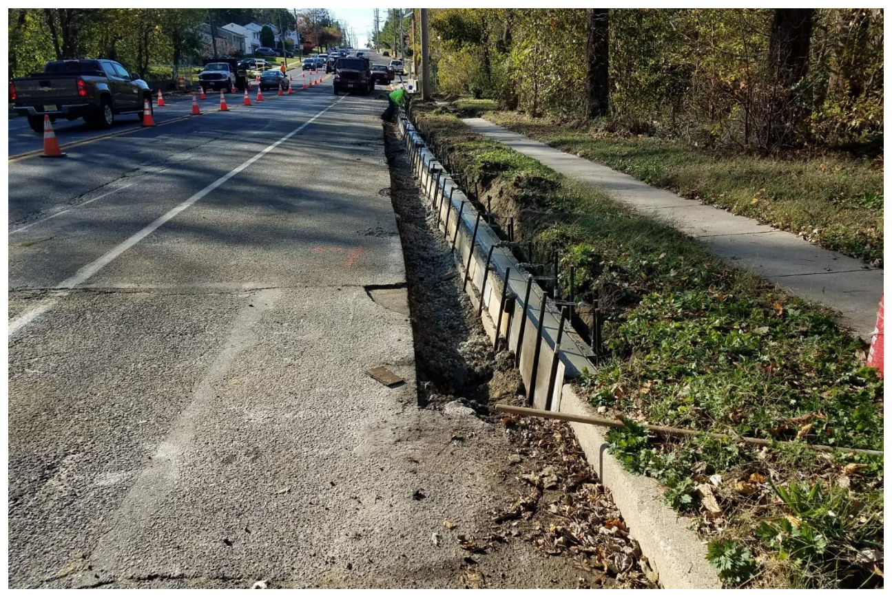
Figure 4. Lexa placing curb at Location #5 westbound.