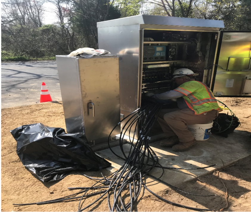
Figure 4: Sub-Contractor installing and wiring Meter Cabinet