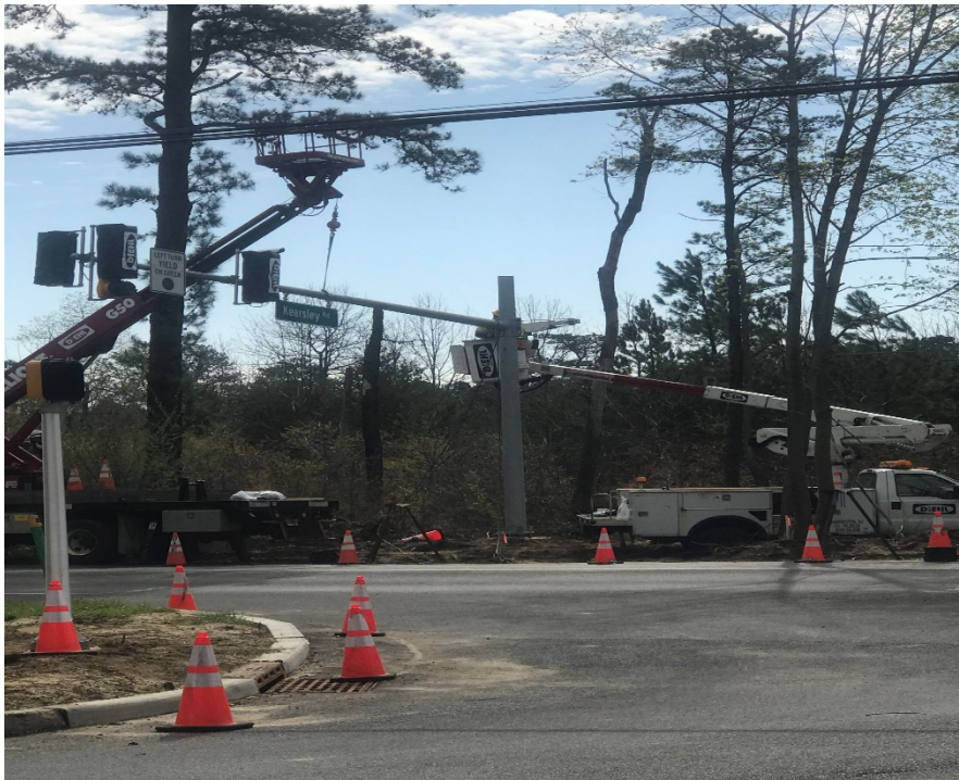
Figure 1: Sub-Contractor installing Pedestrian Signal Pole with camera and signs.