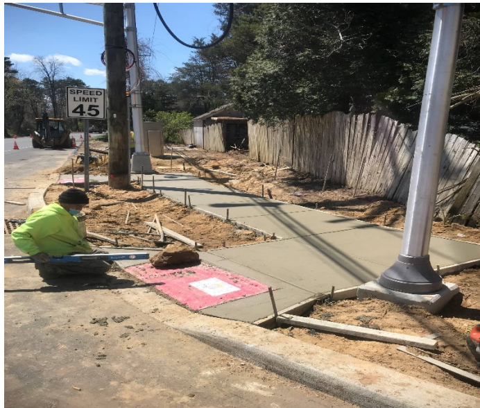
Figure 4 & 5: Contractor installing concrete sidewalk