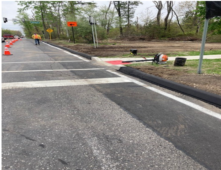
Figure 2 & 3: HMA curb installation Northbound Berlin Cross Keys Rd.