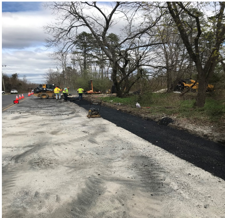
Figure 6-7: Installing DGA and Hot Mix Asphalt Base