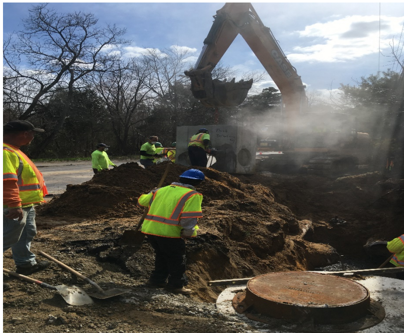
Figure 2-3: Crew installing inlet and doghouse