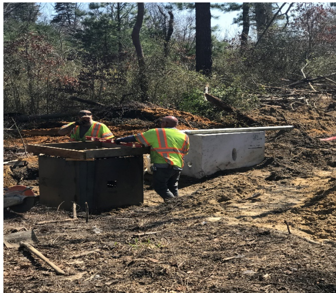
Figure 2-3: Sub-Contractor installing Junction Box