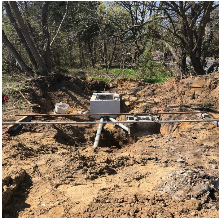
Figure 4-5: Sub-Contractor installing Junction Box and Conduit