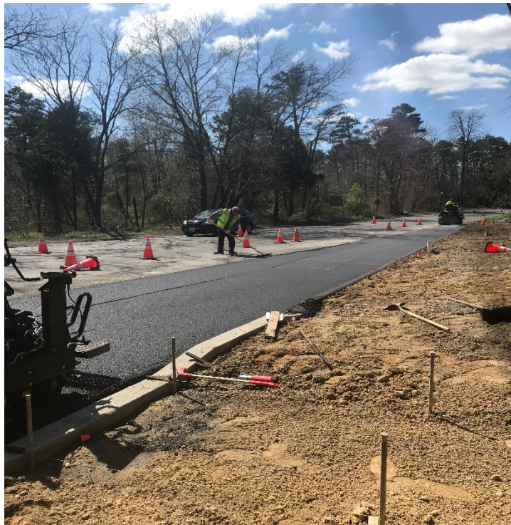
Figure 1: Crew installing Hot Mix Asphalt Base