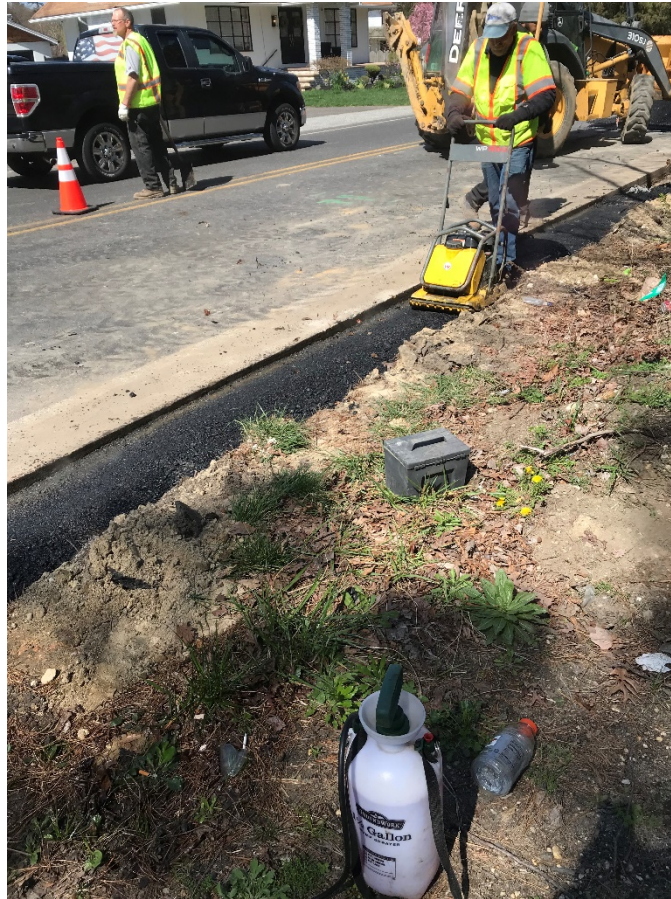
Figure 8: Crew installing Hot Mix Asphalt Base.