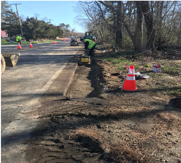
Figure 4-5: Crew cutting out roadway