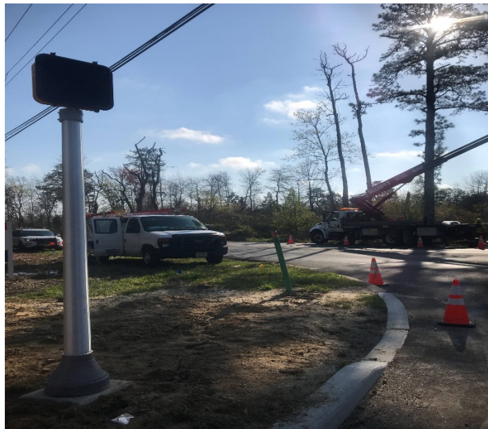
Figure 2 & 3: Pedestrian Street Signal and Light installation