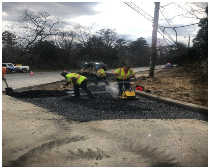
Figure 8-9: Crew installing DGA and Hot Mix Asphalt Base