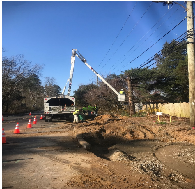
Figure 6-7: Removing existing trees and bushes.