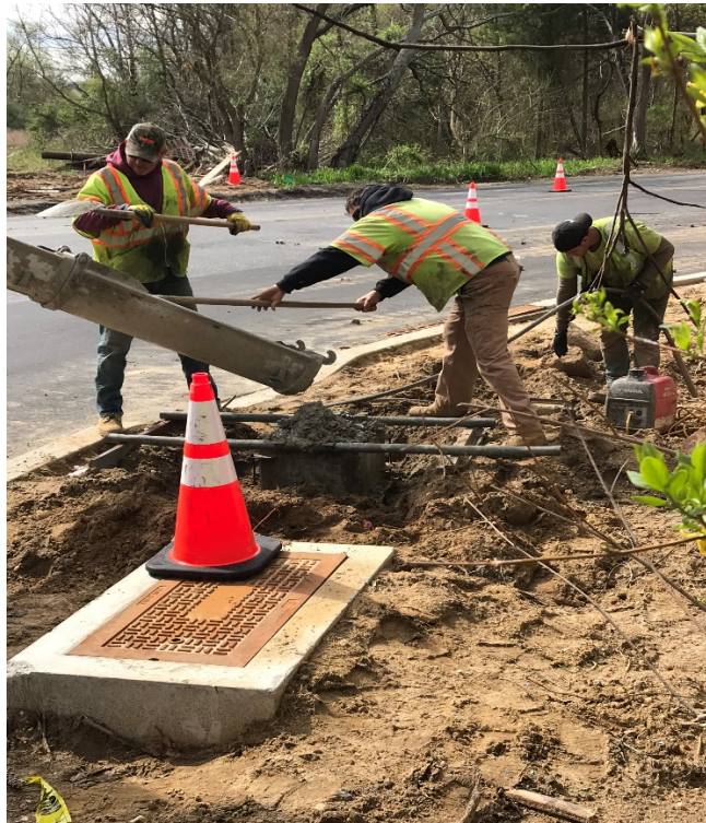
Figure 1: Crew pouring forms for Pedestrian Light Pole