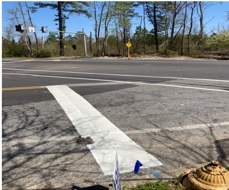
Figure 2 & 3: Traffic Lines Inc, painted "Only" and Crosswalk Lines