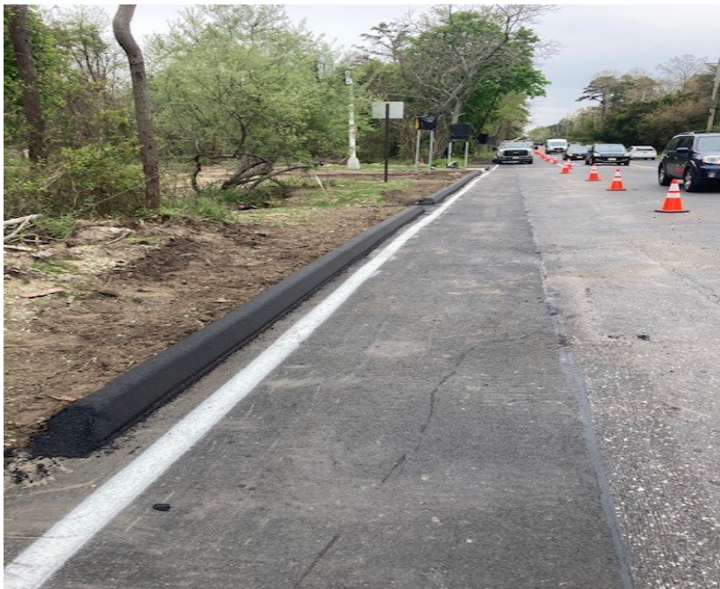
Figure 1: Contractor installed HMA curb Northbound Berlin Cross Keys Rd.