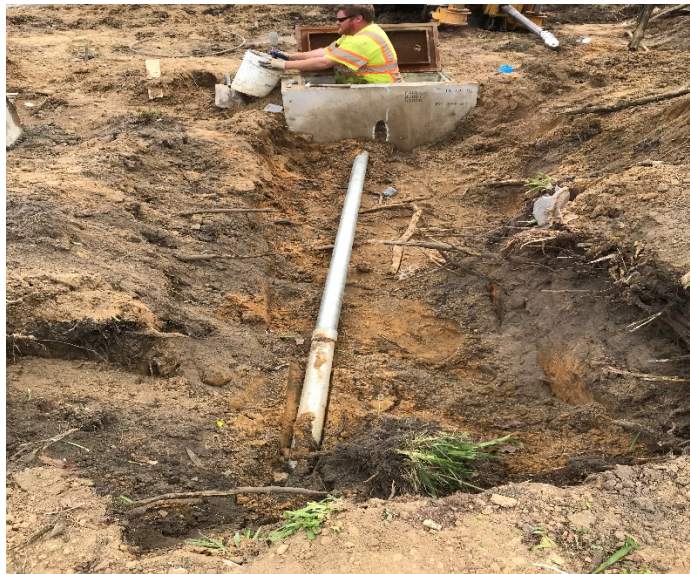
Figure 6-7: Sub-Contractor installing 3" RMC