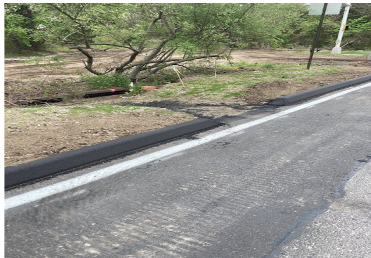
Figure 4&5: HMA curb installed with separation for proper drainage.