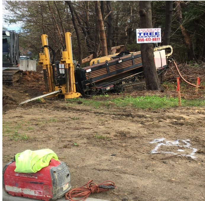
Figure 8: Sub-Contractor sending 3” RMC under roadway.