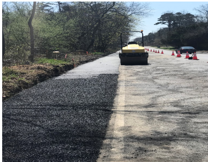
Figure 1: Crew installing Hot Mix Asphalt Top-coat