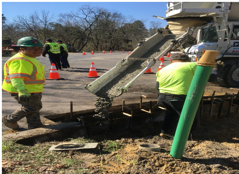
Figure 4-5: Crew installing (9"x18") cement curb