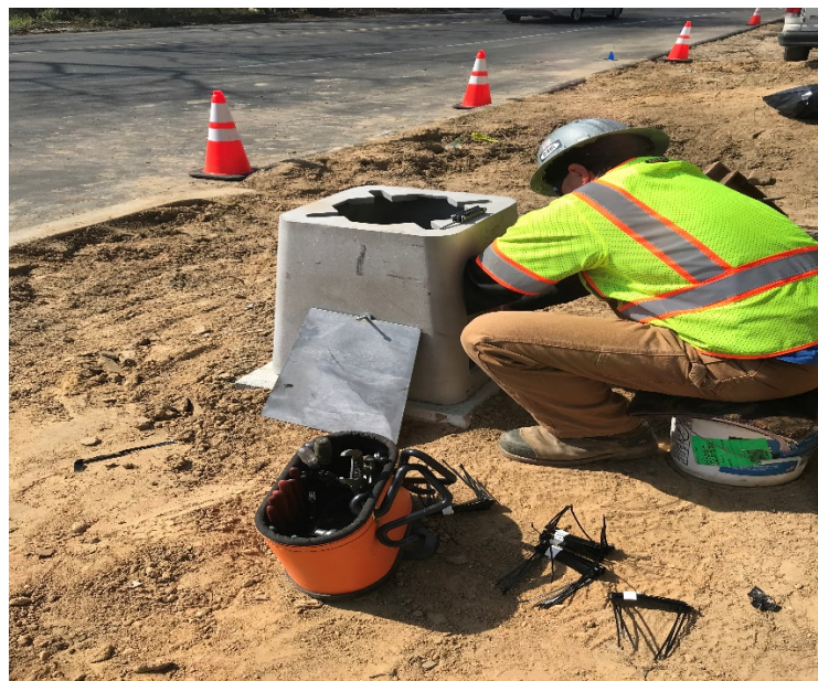
Figure 2-3: Sub-Contractor wiring Junction Boxes and Bases