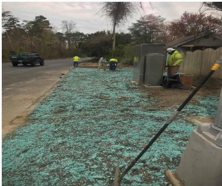
Figure 6 & 7: Installation of Push call buttons and Top-Soil with Cellulose Tack Fiber