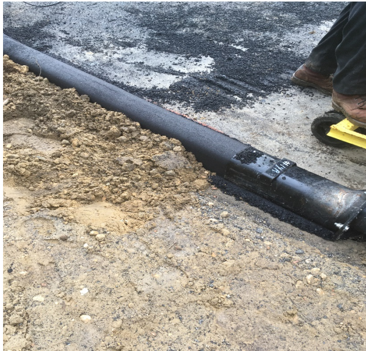
Figure 2-3: Crew installing Asphalt curb