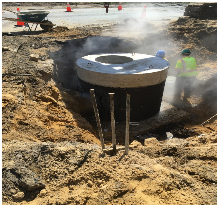
Figure 1: Crew installing Doghouse

Progress Report # 1 Friday, March 27, 2020