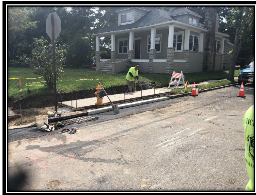
Figure 1: New sidewalk on Helena Avenue.

Monday, September 17, 2018 to Friday, September 21, 2018