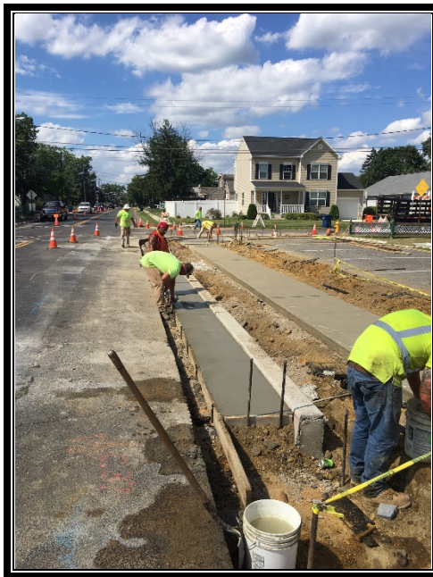
Figure 3: Sidewalk and gutter being completed in from of the "Wick" .