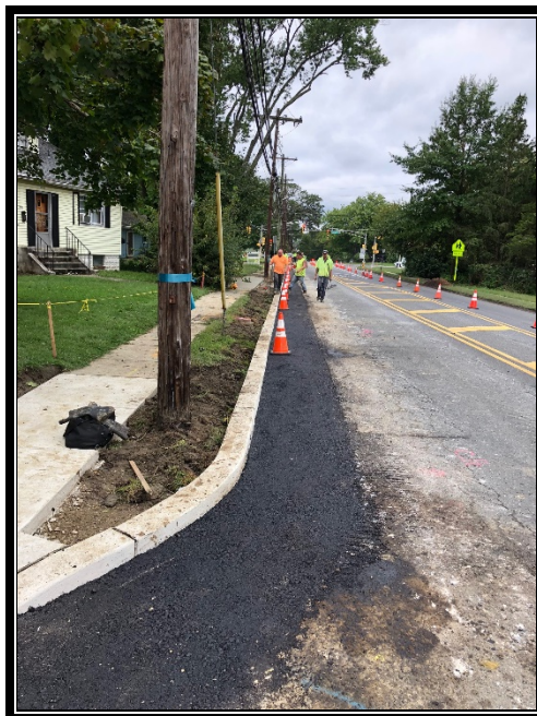
Figure 3: Restored area at Earl Avenue.