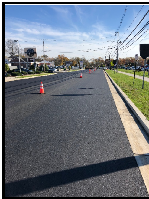
Figure 3: Completed pavement surface of Warwick Road in front of the Highschool.