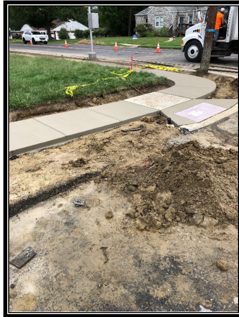
Figure 2: Completed sidewalk and HC ramp at Wood Avenue.