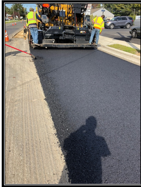
Figure 2: Contractor completed asphalt base repairs