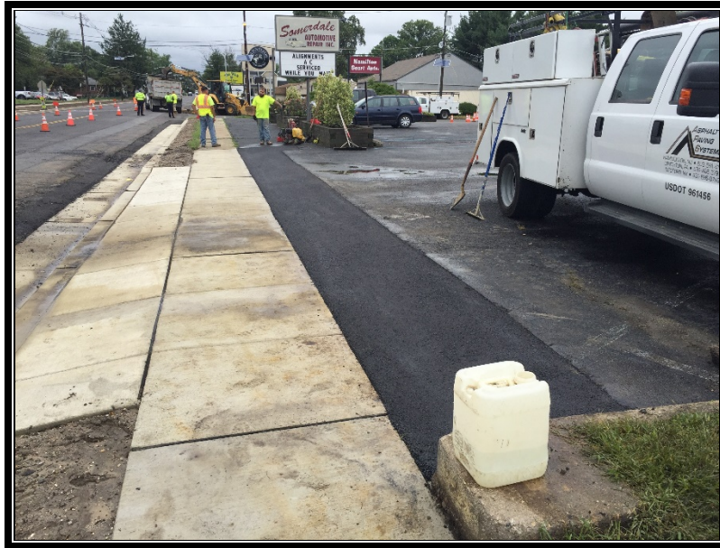
Figure 2: Completed asphalt restoration behind south of Harned Avenue.