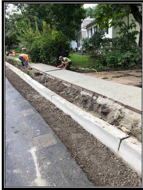
Figure 2: Completed curb and sidewalk on the west side of Warwick Road.