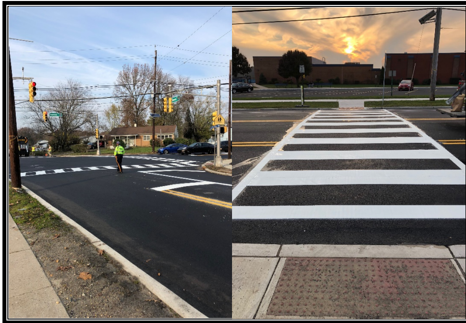
Figure 5: Final striping of Warwick Road.