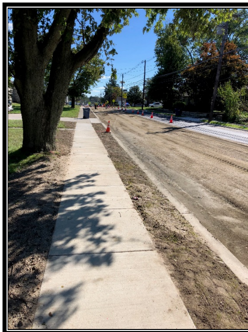
Figure 3: Recycled roadway surface ready for traffic.