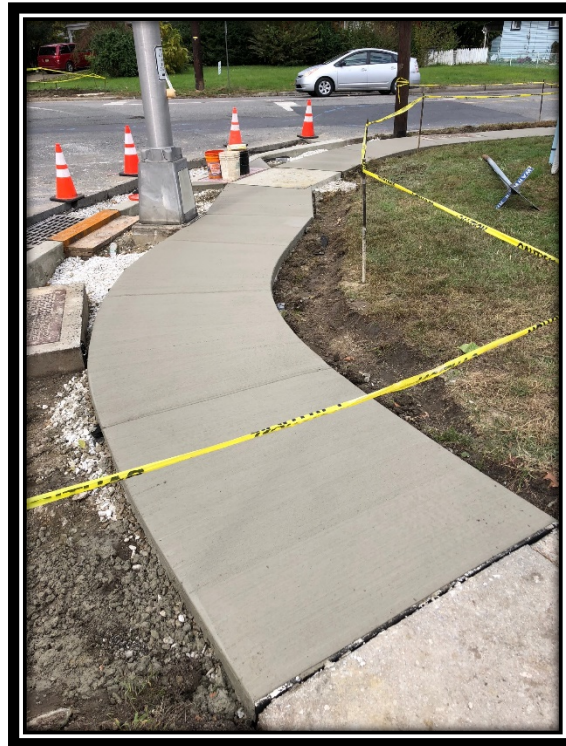
Figure 1: Contractor completed sidewalk at Somerdale Road.

Monday, October 29, 2018 to Friday, November 2, 2018