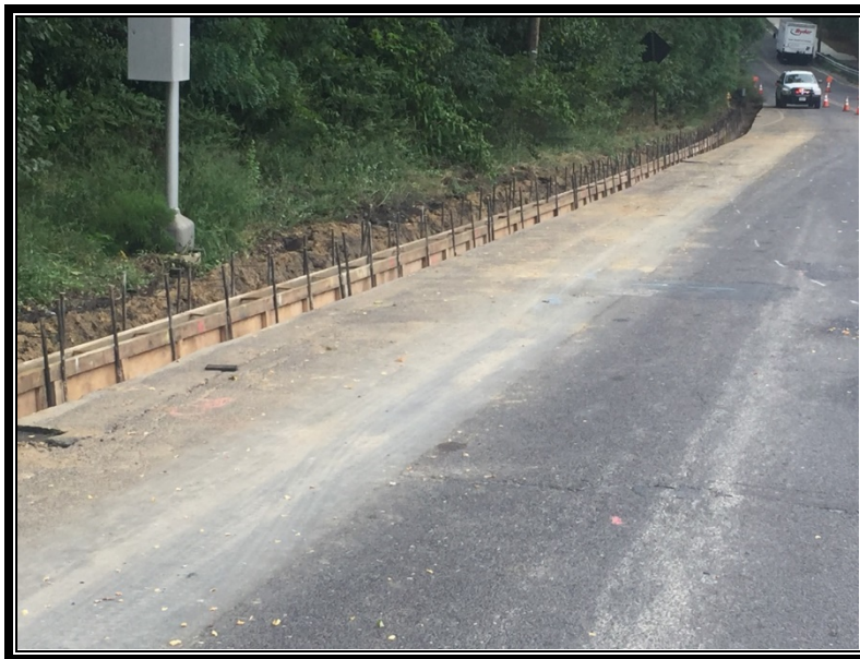
Figure 3: Curb formed on east side of Warwick Road at south side of project.