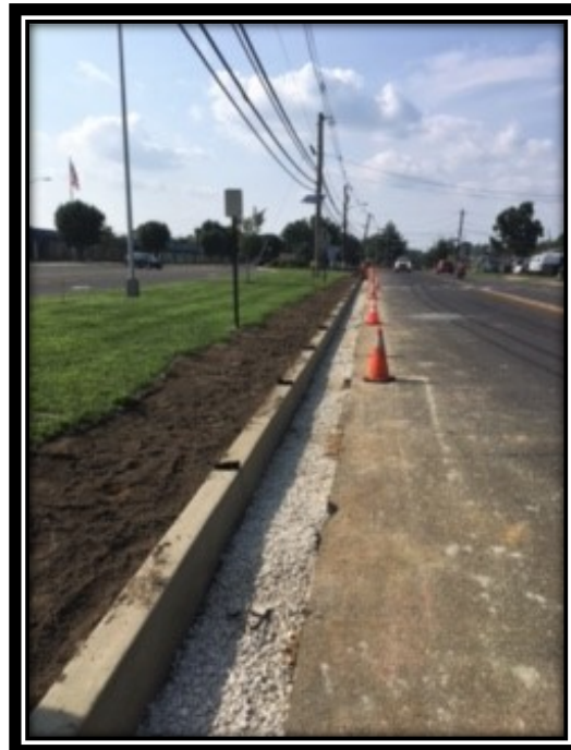
Figure 1: New curb in front of Sterling Highschool.

Monday, August 13, 2018 to Friday, August 17, 2018