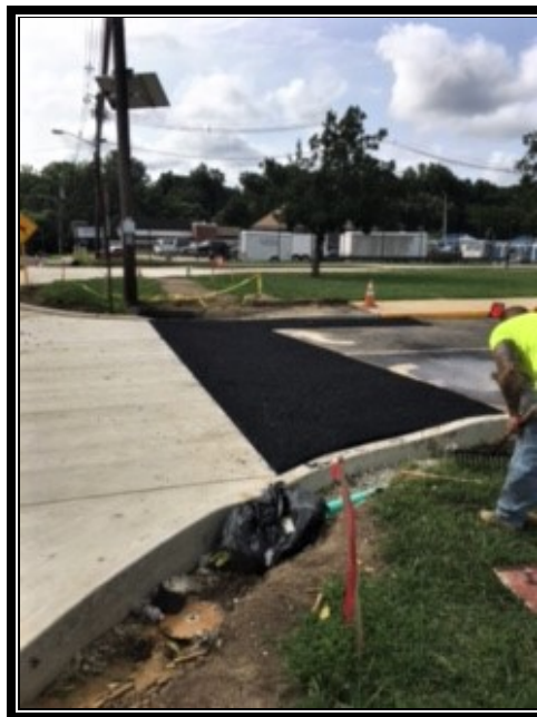
Figure 3: Asphalt pavement tie into parking lot at Sterling Highschool south driveway.