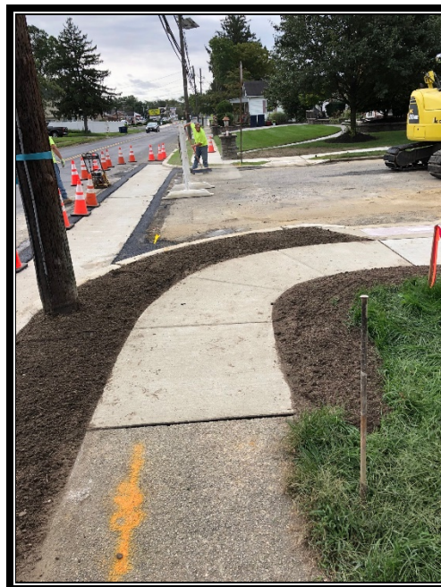
Figure 3: Restored area at Wood Avenue.