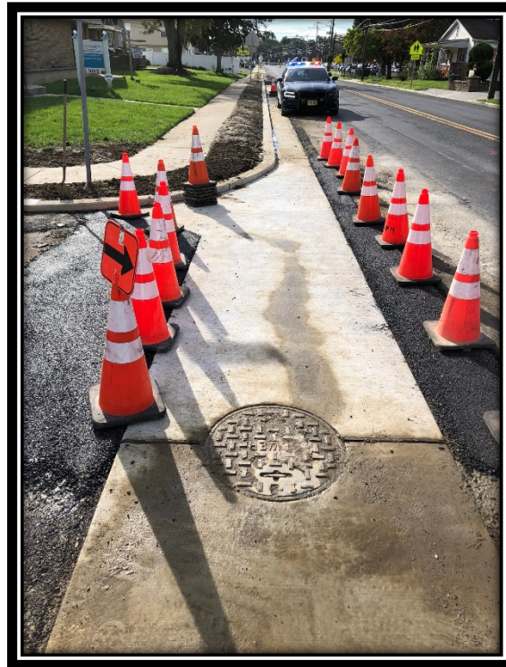
Figure 1: Completed slope gutter at Wood Avenue.

Monday, October 15, 2018 to Friday, October 19, 2018