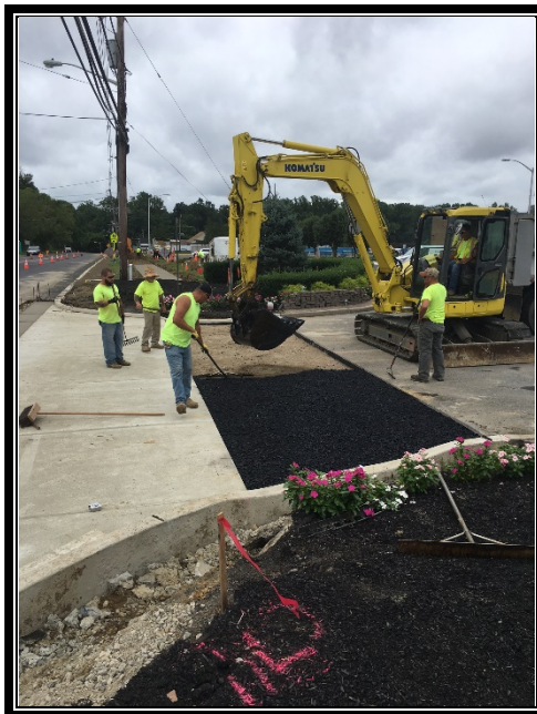
Figure 3: Asphalt pavement tie into parking lot at Sterling Highschool Main driveway.