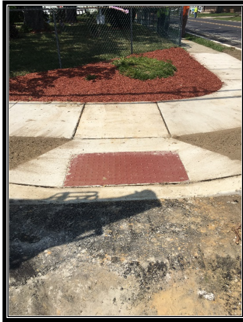
Figure 2: Completed HC ramp at Preston Avenue.