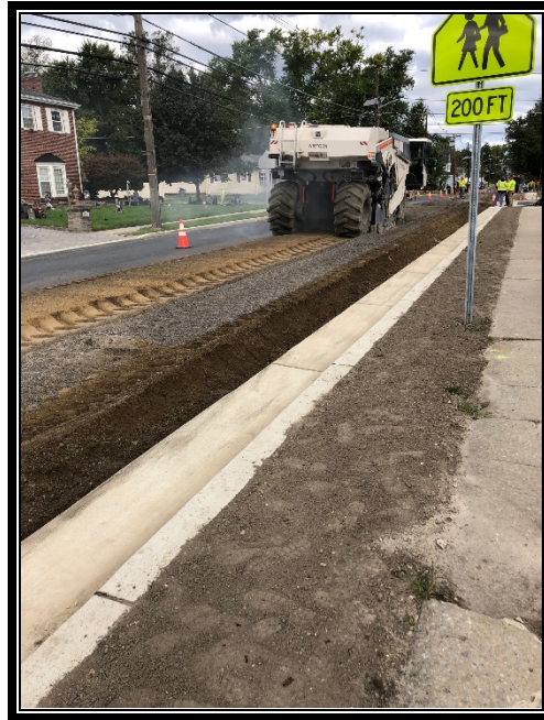
Figure 2: Contractor performing roadway recycling between Wood and Earl Avenue.