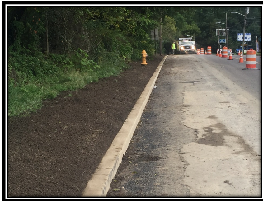
Figure 1: New curb and restoration on east side of Warwick Road.

Tuesday, September 10, 2018 to Friday, September 14, 2018