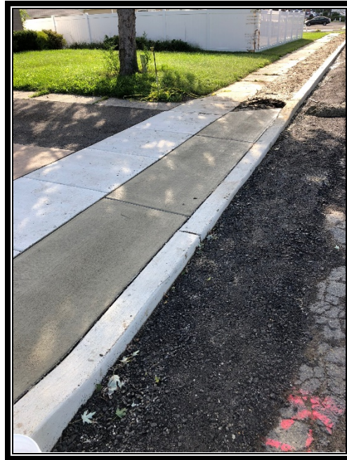
Figure 2: Completed curb, sidewalk and driveway apron between Wood and Preston.