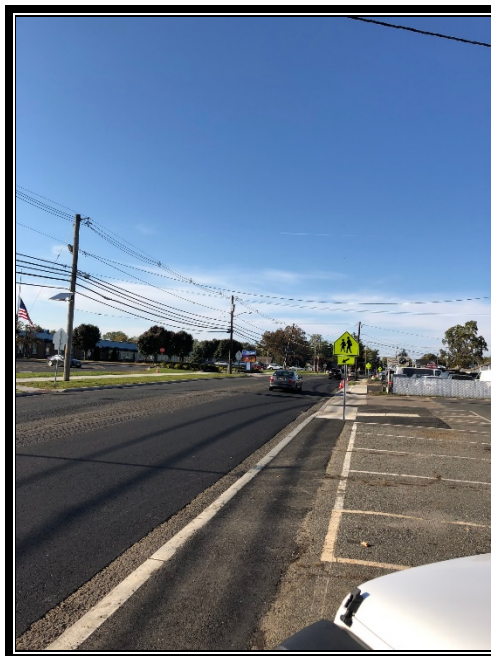
Figure 3: Contractor completed asphalt base repairs.