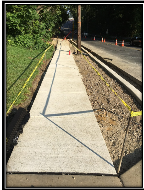
Figure 1: New curb and sidewalk at south end of project.

Monday, August 27, 2018 to Friday, August 31, 2018