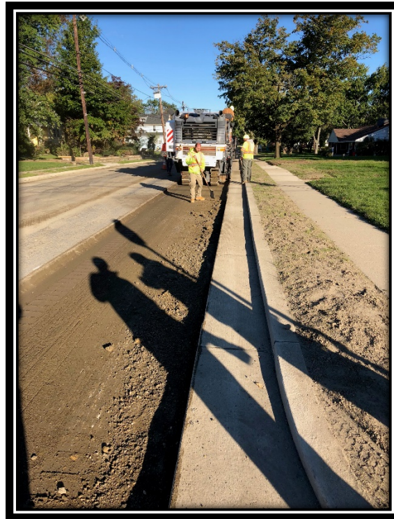
Figure 1: Preparing the recycled base for paving.

Monday, October 22, 2018 to Friday, October 26, 2018