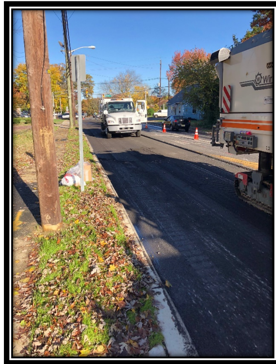
Figure 1: Final milling of the project.

Monday, November 5, 2018 to Friday, November 30, 2018