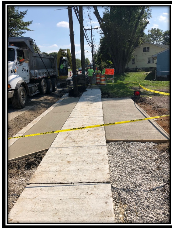
Figure 1: Completed Driveway apron and sidewalk..

Monday, October 1, 2018 to Friday, October 5, 2018