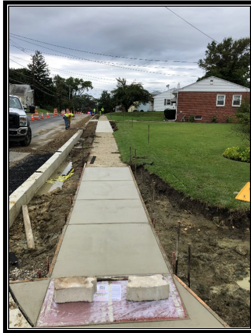
Figure 2: Completed curb and sidewalk on the east side at Villa Avenue.