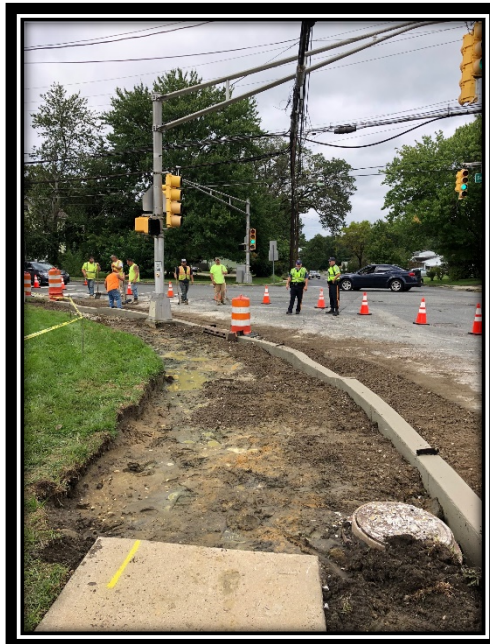
Figure 1: New curb at Somerdale Road..

Monday, September 24, 2018 to Friday, September 28, 2018