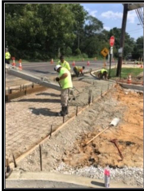
Figure 2: Concrete Driveway, 6" Thick at Sterling Highschool.