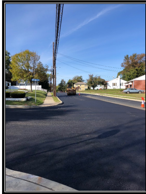
Figure 2: Completed base paving in recycled area between Wood and Earl Avenue.