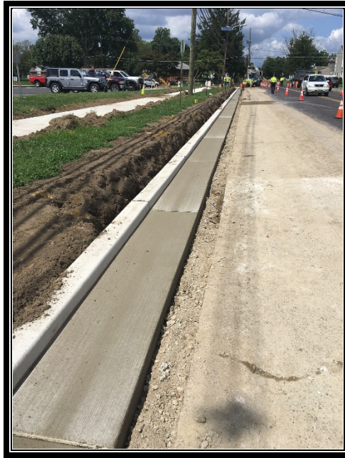
Figure 2: Concrete gutter at Sterling Highschool.