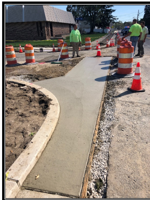
Figure 3: Installing slope gutter at Wood Avenue.