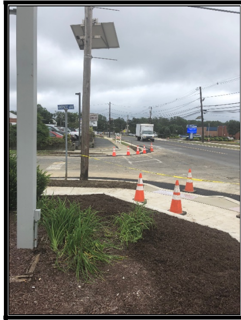
Figure 2: Completed sidewalk and pavement restoration at Harned Avenue.