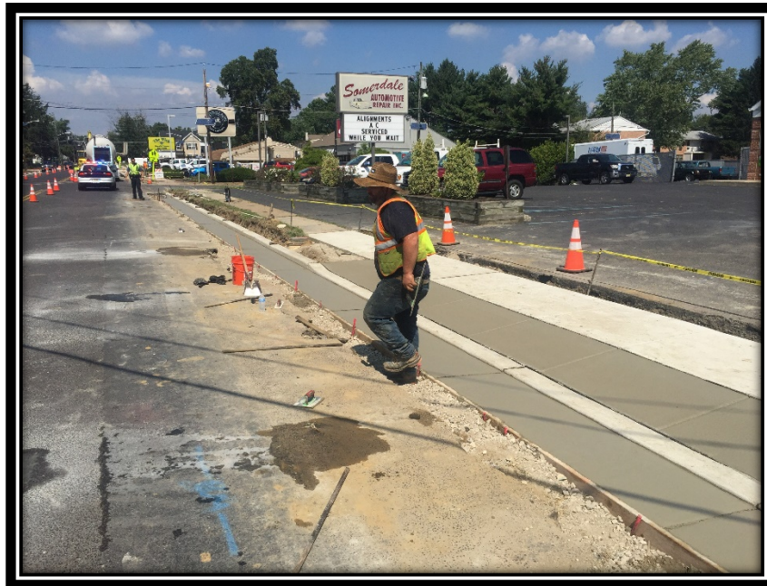
Figure 1: New curb and gutter progressing south from Preston Avenue.

Tuesday, September 4, 2018 to Friday, September 7, 2018