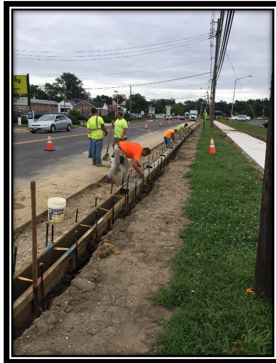
Figure 1: New curb in front of Sterling Highschool.

Monday, August 20, 2018 to Friday, August 24, 2018