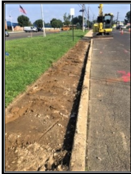
Figure 2: Removing sidewalk at Sterling Highschool.