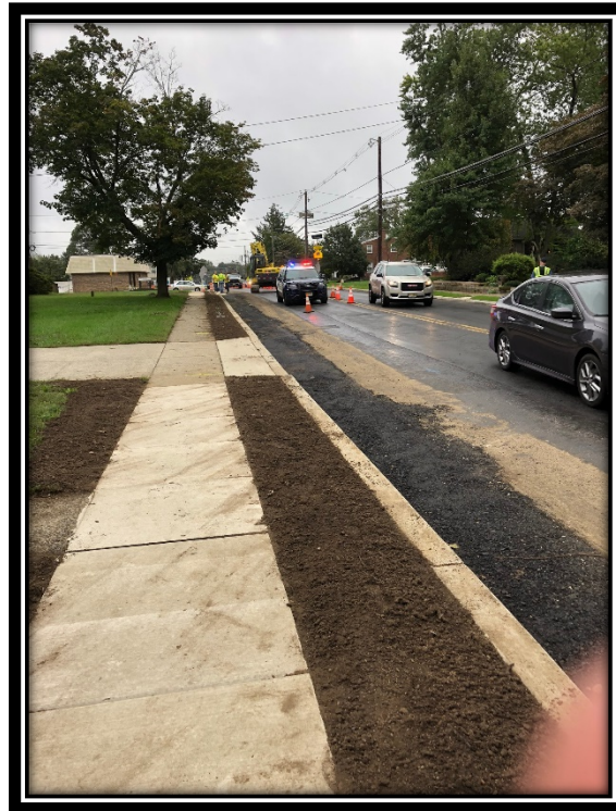
Figure 1: New sidewalk and curb with restoration near Wood Avenue.

Monday, October 8, 2018 to Friday, October 12, 2018