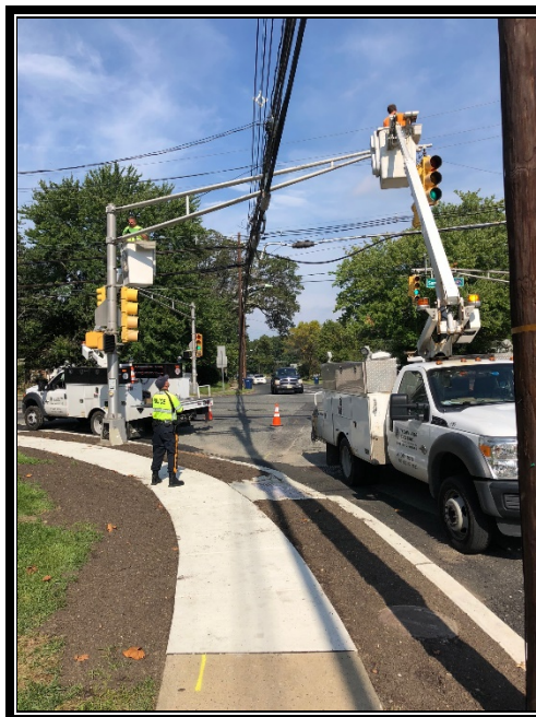
Figure 3: Installing Image Detectors at Warrick & Somerdale Intersection.