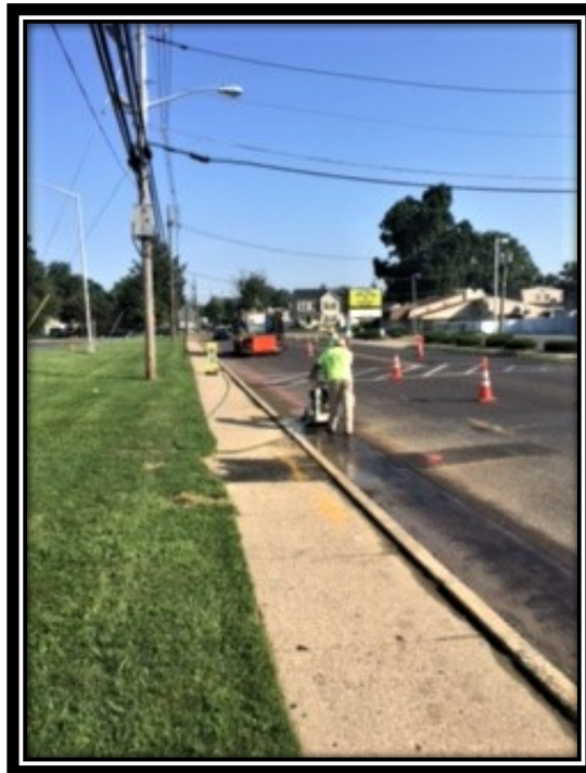
Figure 1: Sawcutting pavement in preparation for curb installation at Sterling Highschool.

Tuesday, August 7, 2018 to Friday, August 10, 2018