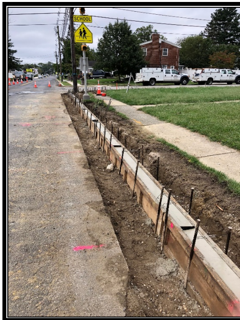
Figure 3: Resumed curb on west side of Warwick Road from Wood Avenue.