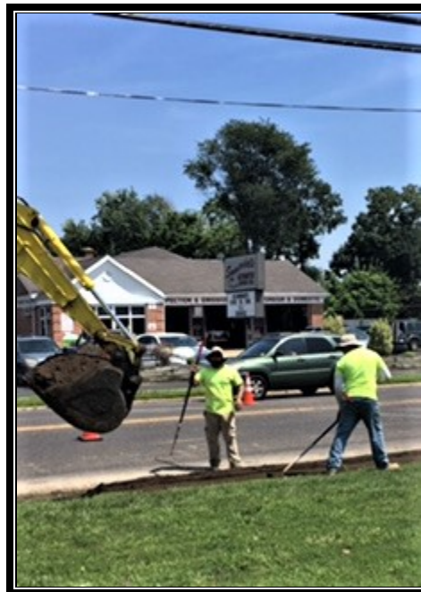
Figure 3: Backfilled area in front of Highschool where sidewalk was removed.