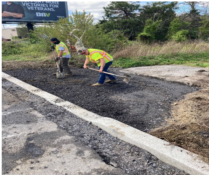
Figure 5&6: Concrete poured and backfilled.