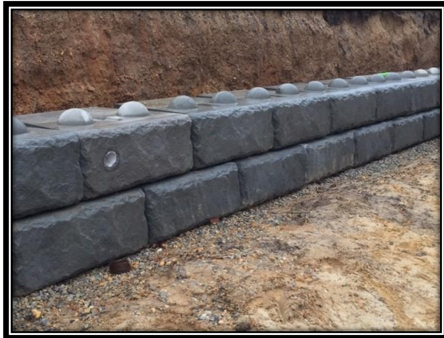
Figure 1: Contractor continues to install REDI-ROCK retaining wall block Under drain outfall pipe shown in this photo..

Progress Report # 7 Friday, December 20, 2019