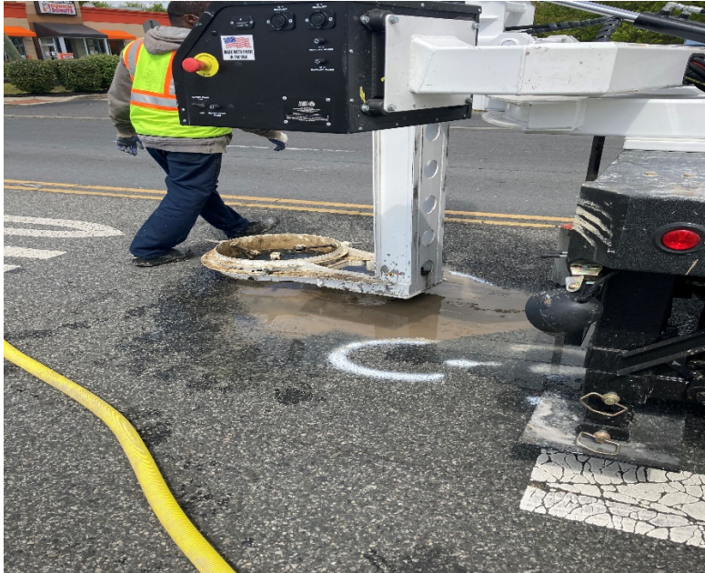
Figure 4: Six core samples were taken.