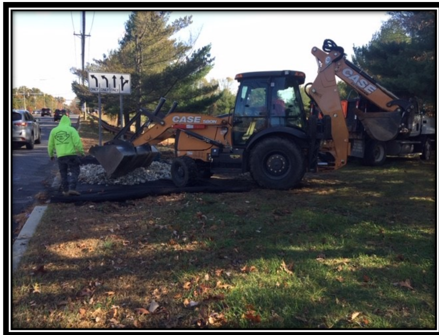
Figure 1: Crew installing stone construction entrance

Progress Report # 1 Friday, November 8, 2019