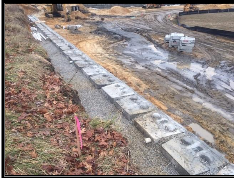
Figure 2: Crew backfilling REDI-ROCK retaining wall block with No.57 stone..