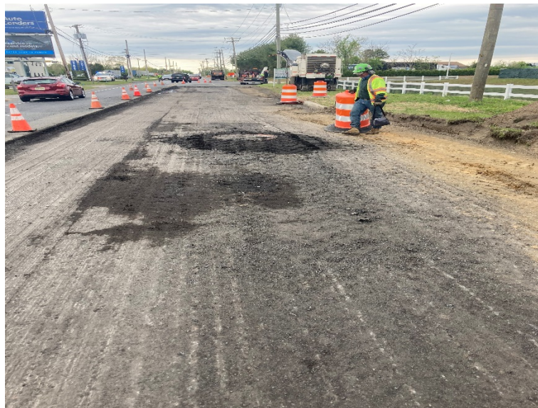
Figure 6&7: Southbound lane and shoulder milled by contractor south of New Freedom Rd.