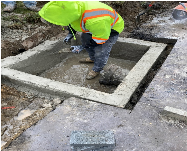
Figure 3&4: Installed Bicycle Safe Grates and Curb Pieces and Purged Brickwork.