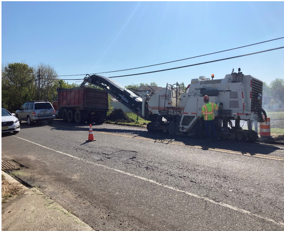
Figure 1: Contractor began milling operation on Berlin Cross Keys Rd.