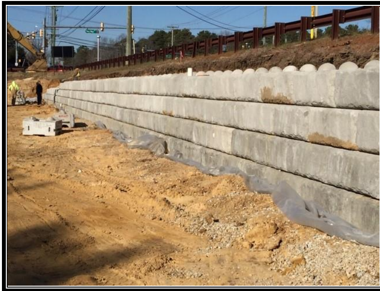
Figure 3: East retaining wall progress using REDI-ROCK..