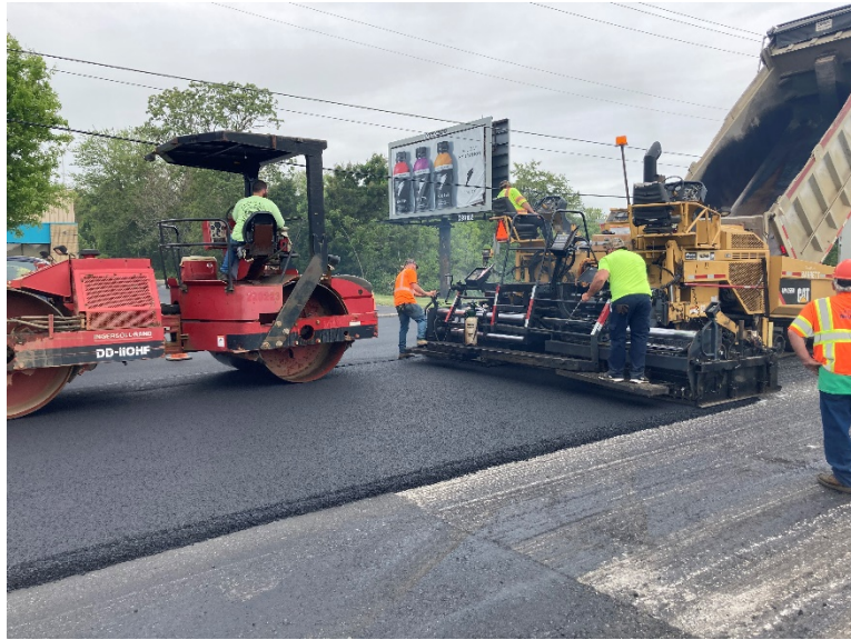
Figure 6: 12.5M HMA intermediate added Northbound sections 155-161.