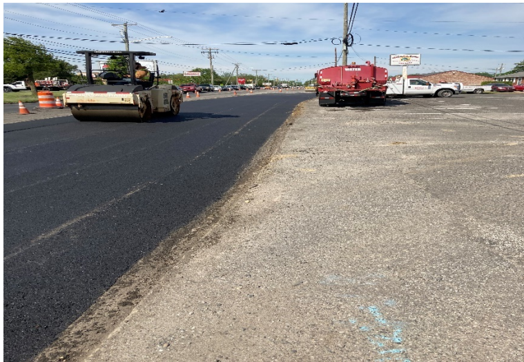
Figure 2&3: 25M Base added in sections 155-158.