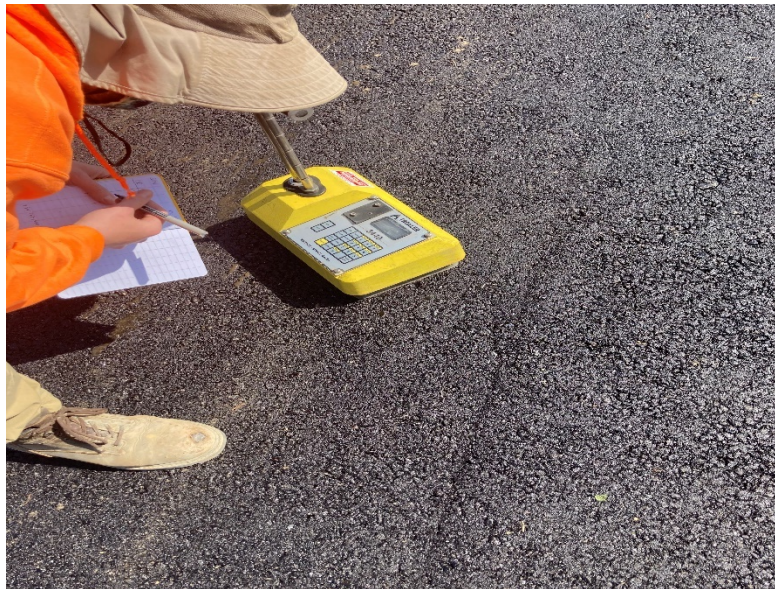
Figure 5: Nuclear test performed on 12.5M HMA Intermediate.