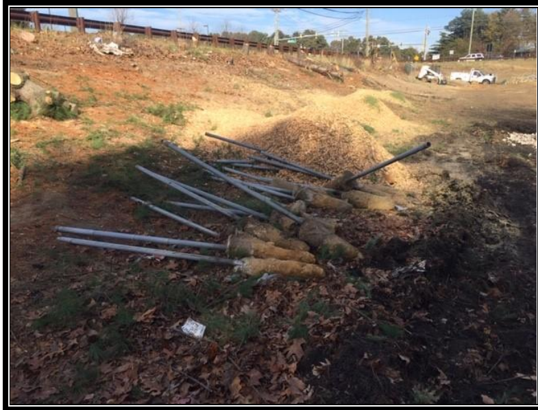
Figure 2: Crew removing the galvanized fence post from the chain-link fence.