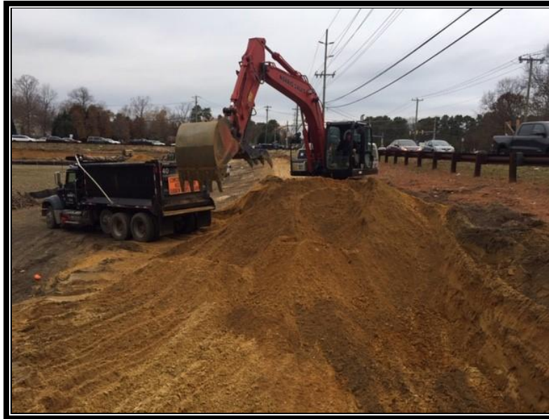
Figure 2: Crew started unclassified excavation along the east slope of the basin.