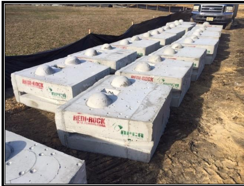
Figure 3: Crew received the first load of REDI-ROCK retaining wall block..