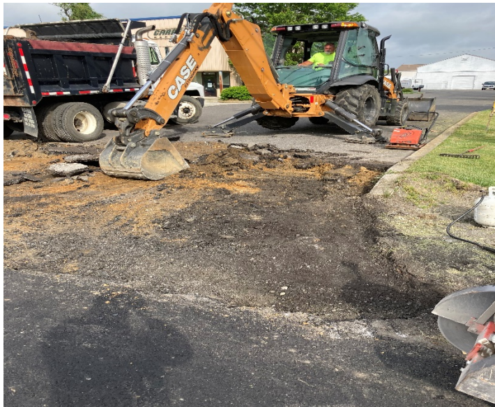
Figure 7: Contractor prepped driveway for Hot Mixed Asphalt.