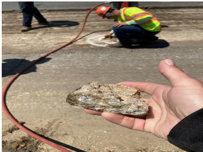
Figure 4: The material appears to be soil cement; however, a test is needed to identify.