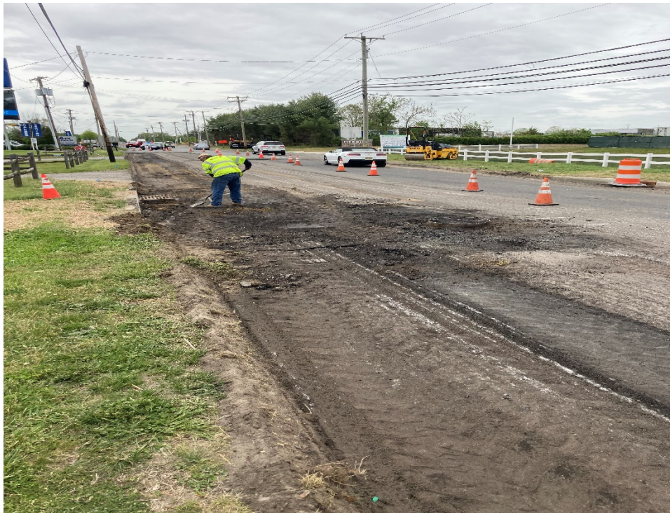
Figure 1: Contractor milling only 2" at new limits on Berlin Cross Keys Rd set by County