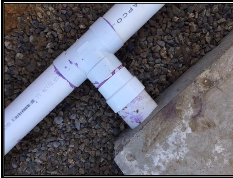
Figure 2: Crew installing PVC under drain pipe behind the wall.