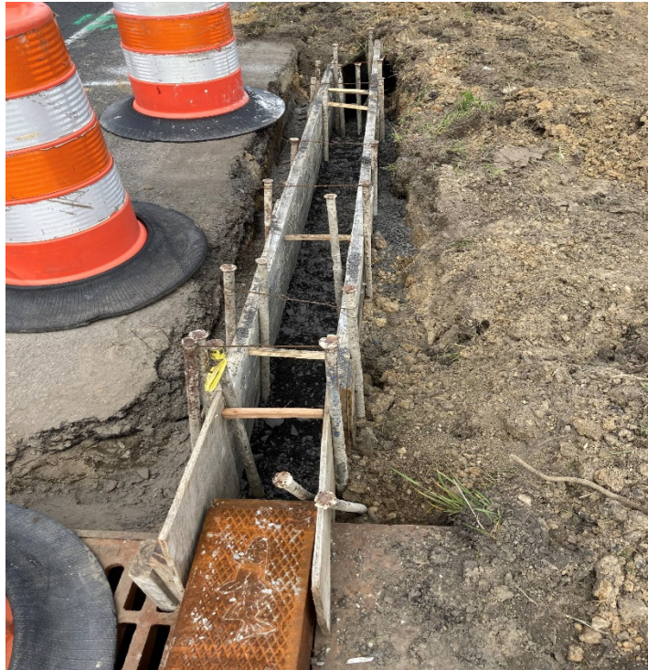
Figure 5: Forms set around new Inlet curb for concrete.

Barrett Construction LLC worked completed as of April 24, 2020.