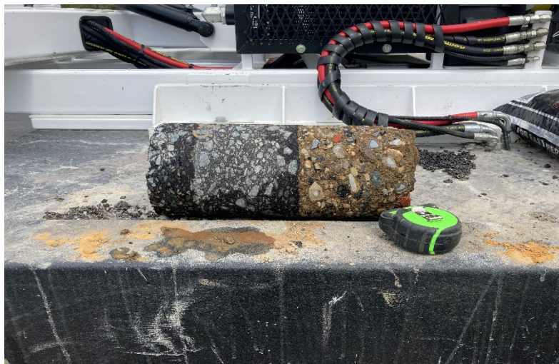
Figure 5: C-2 sample was approximately, 12.5" long.