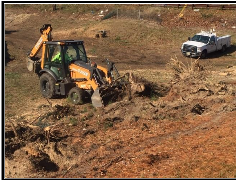
Figure 3: Crew stumping trees on west slope..