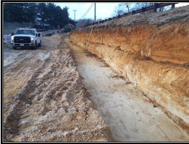
Figure 2: Crew excavating the footing for the west retaining wall..