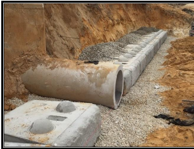
Figure 3: Construction of the west REDI-ROCK retaining wall started. Existing reinforced concrete storm pipe shown and being incorporated in the new retaining wall as per plan.