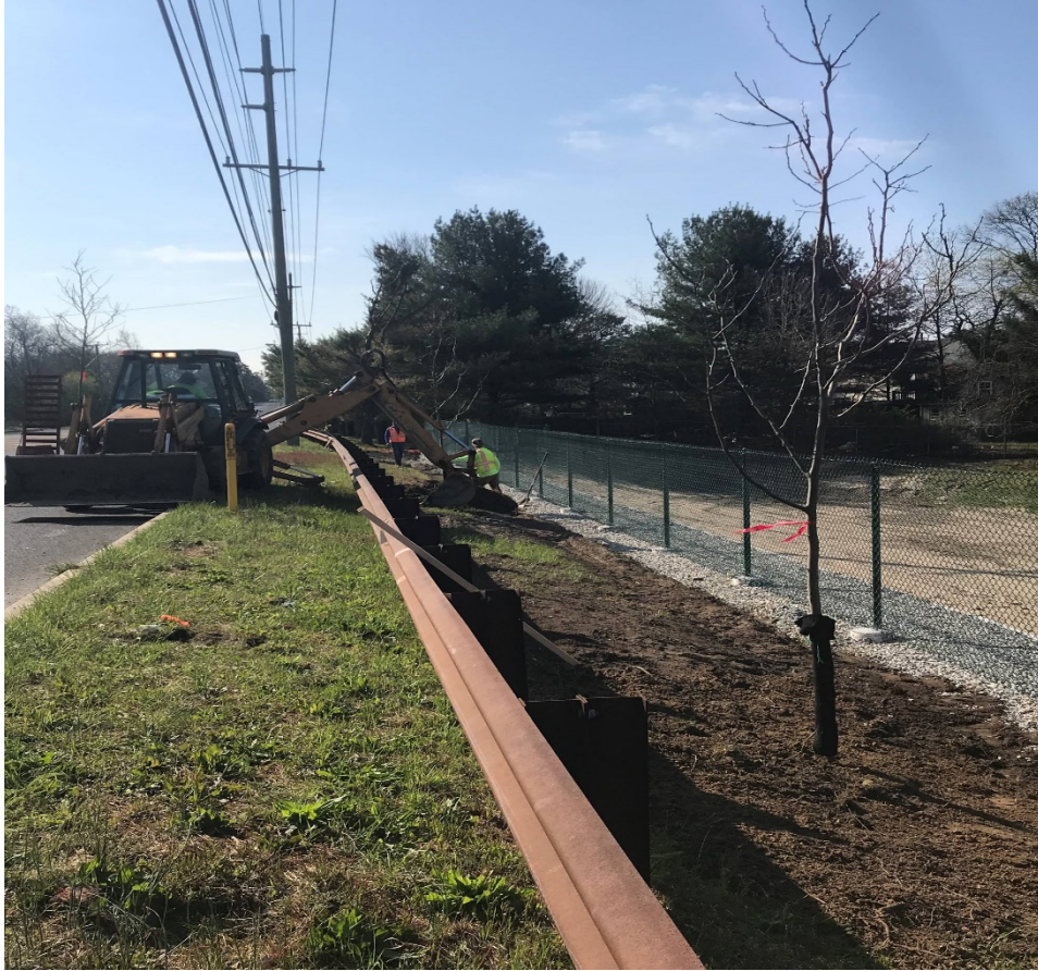
Figure 2: Top-soil added with Fertilizer and seeding Type W.