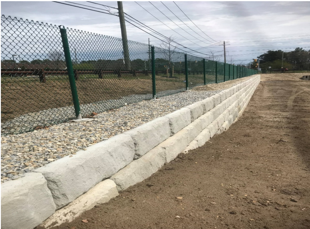
Figure 1: Contractor adding Top-soil 4" Thick around fence perimeter.