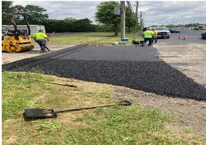
Figure 8: Contractor preparing to roll out driveway.

Barrett Construction LLC worked completed as of April 24, 2020.