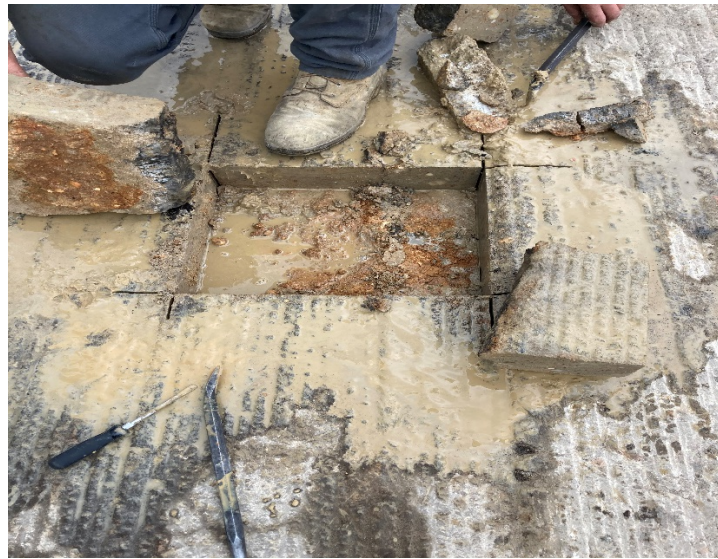
Figure 4&5: A test patch was saw-cut and approximately 4" of cement was revealed.