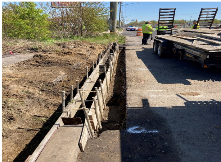
Figure 4: Formed driveway for concrete.