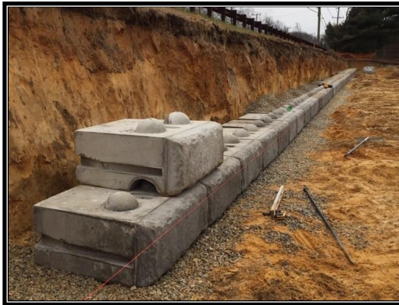
Figure 3: Crew setting the second level of REDI-ROCK retaining wall block..