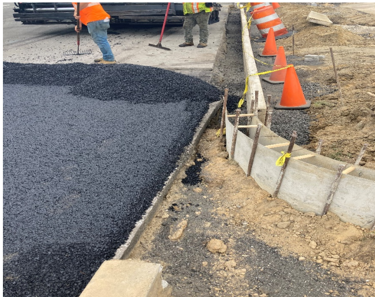
Figure 7: Curb removed by contractor from strip mall working on New Freedom Rd.