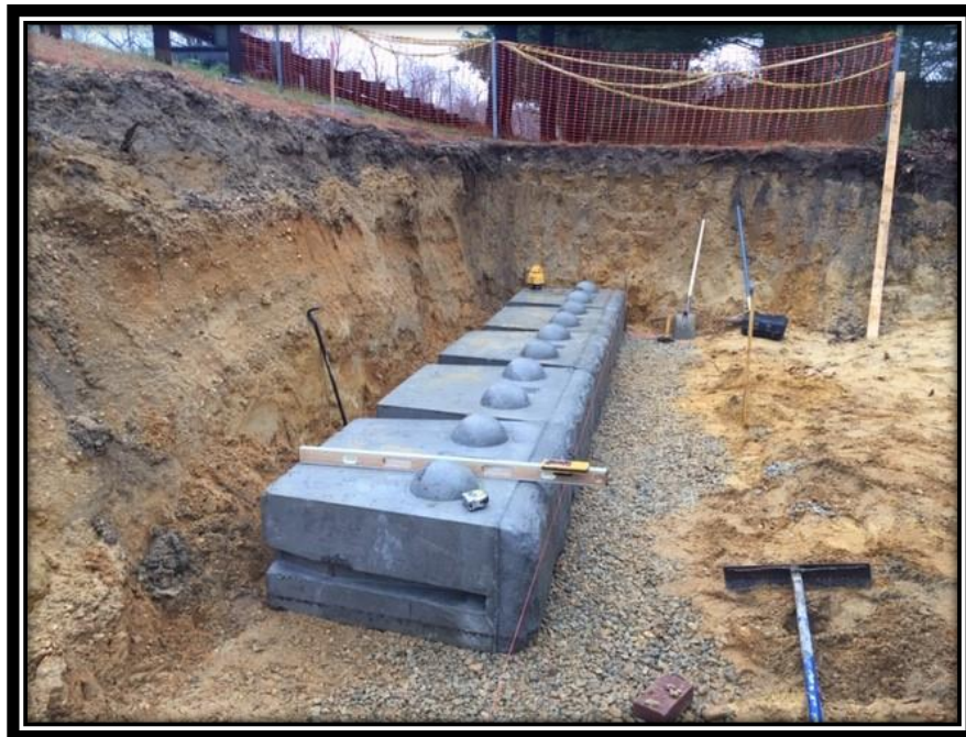
Figure 1: Contractor started to construct the REDI-ROCK retaining wall.

Progress Report # 6 Friday, December 13, 2019