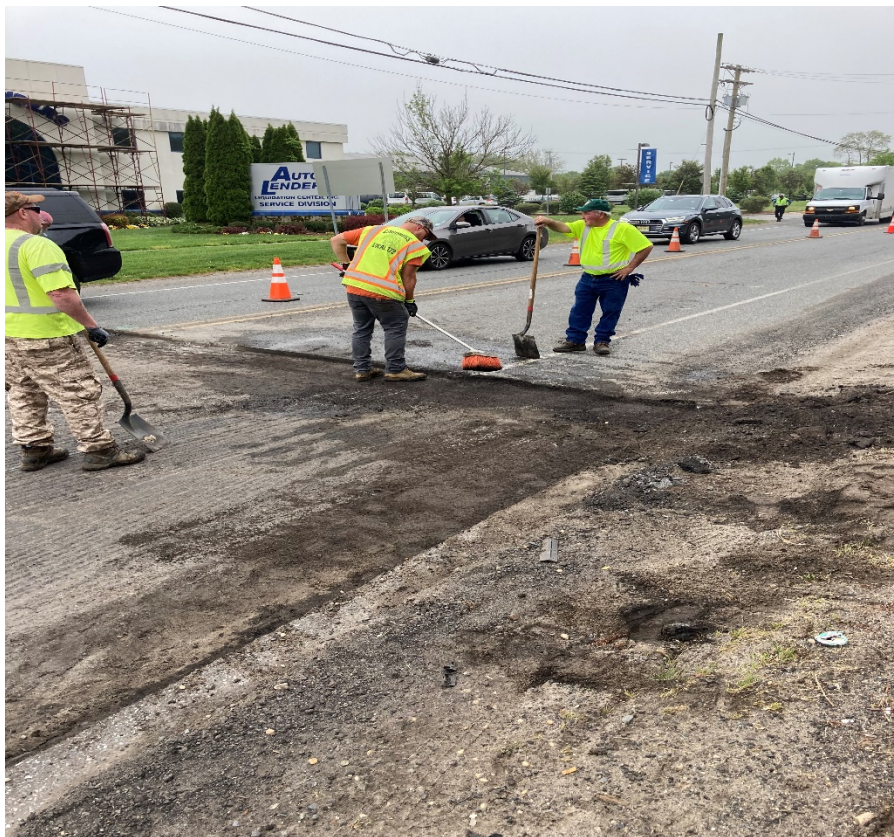
Figure 1: Contractor cut edge prior to 12.5M Hot Mixed Asphalt Top Coat.