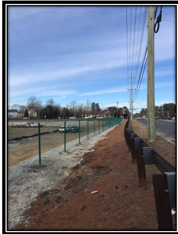
Figure 1: Road Safety Systems installing the PVC coated steel poles.

Progress Report #12 Friday, January 24, 2020