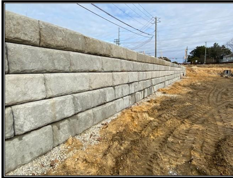
Figure 2: Crew completed the west REDI-ROCK retaining wall.