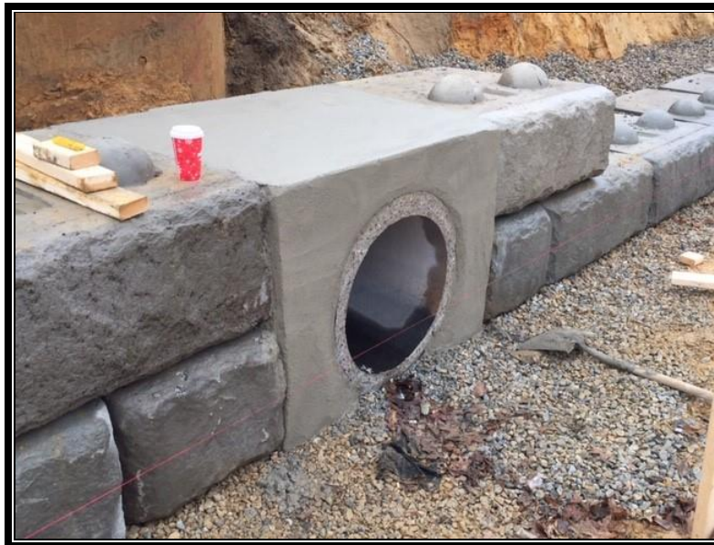
Figure 3: Contractor formed and poured the concrete collar around the existing R.C.P.