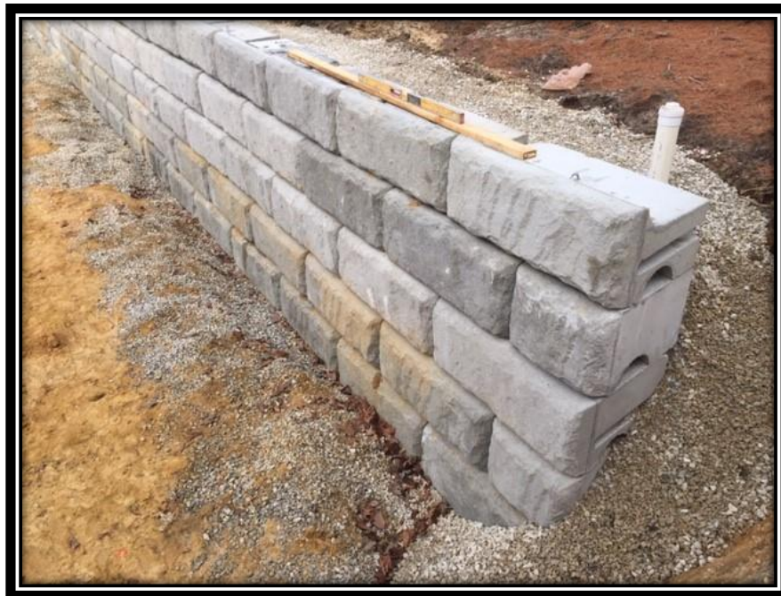
Figure 1: Contractor installing the REDI-ROCK cap block on the east retaining wall.

Progress Report #8 Friday, December 27, 2019