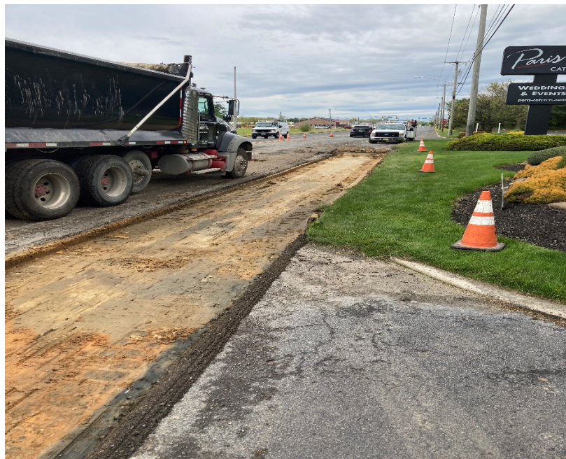
Figure 1: Contractor milling north of New Freedom rd. on Berlin Cross Keys Rd.