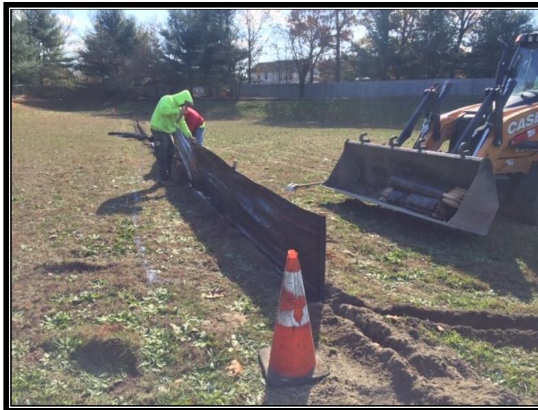
Figure 3: Crew installing silt fence.