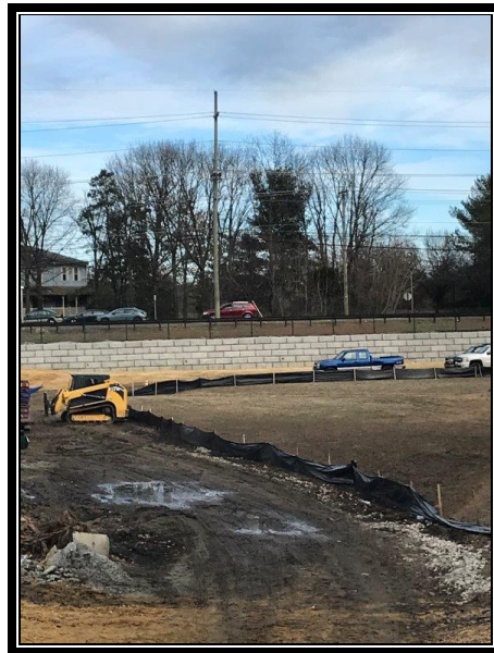
Figure 3: Crew installing the PVC coated steel chain-link fence along the east wall.