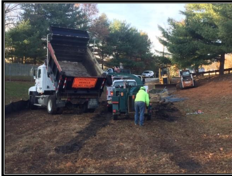
Figure 2: Crew chipping branches.