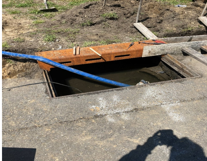
Figure 3: Drained water from Inlet