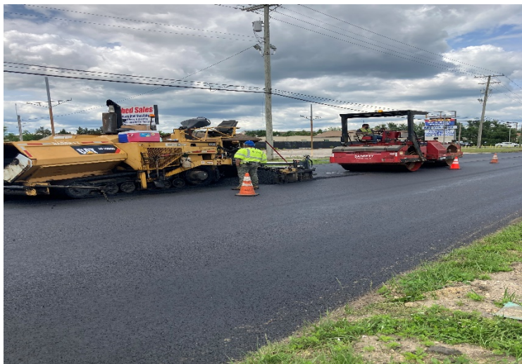
Figure 5: 12.5M HMA Top Coat Southbound section 153-161.