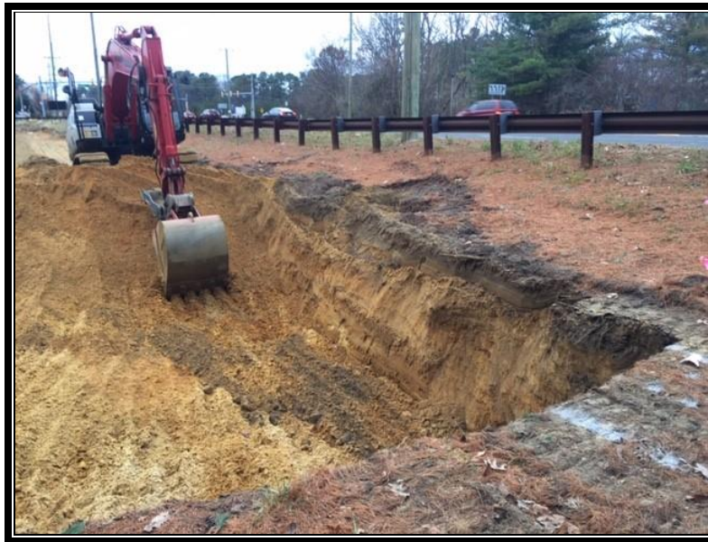
Figure 3: Crew excavating the existing east slope of the basin using an excavator.