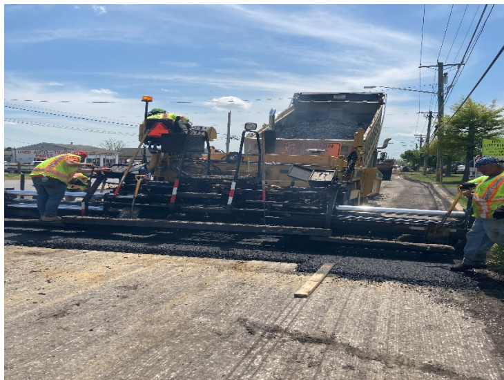
Figure 4&5: Southbound lane and shoulder paved south of New Freedom Rd.