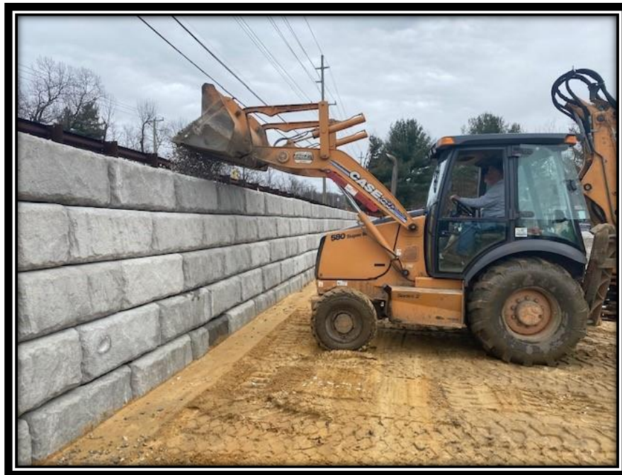
Figure 1: Contractor backfilling the REDI-ROCK cap block on the west retaining wall with No.57 stone.

Progress Report #11 Friday, January 17, 2020