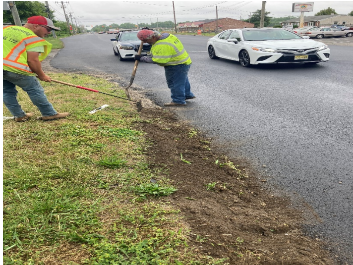
Figure 6: Backfill and seed roadway at section 153-161.