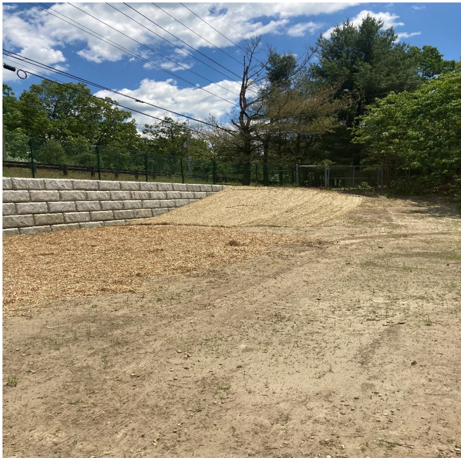
Figure 1: Contractor seeding and mulching at retention pond.