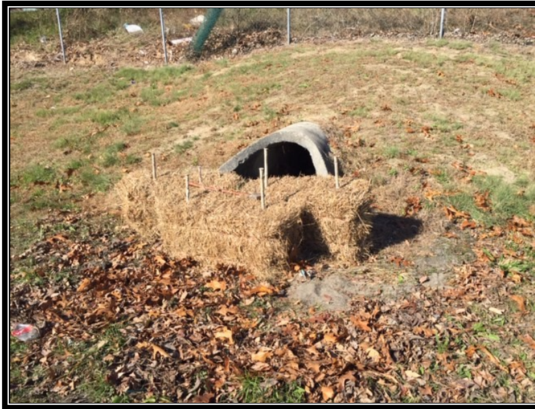
Figure 2: Hay Bale Sediment Control Device