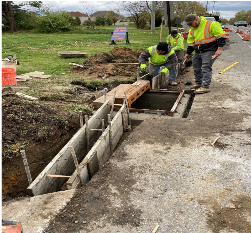
Figure 1: Contractor installed Bicycle Safe Grate and Curb Piece, adding forms for concrete.