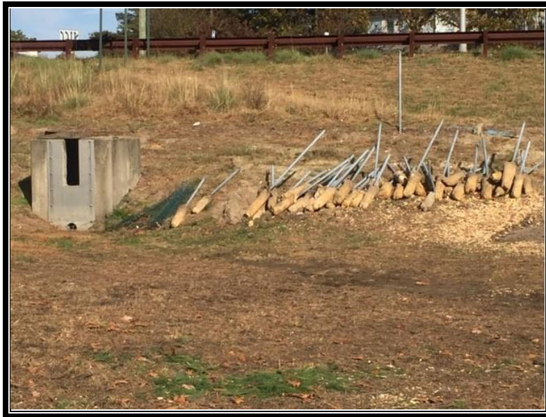
Figure 3: Crew stockpiling galvanized fence post for concrete removal.