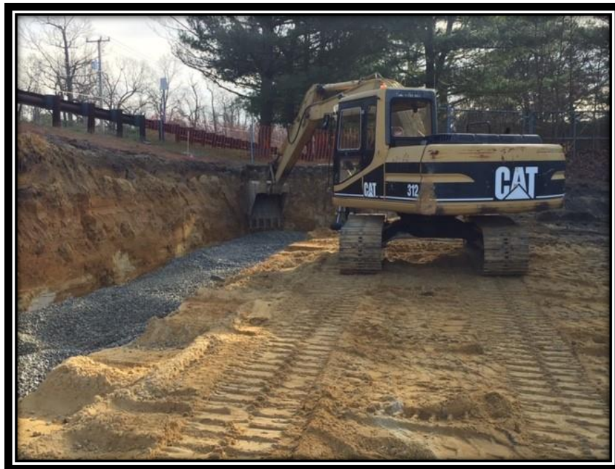
Figure 1: Contractor installing the No.57 stone footing for the retaining wall.

Progress Report # 5 Friday, December 6, 2019