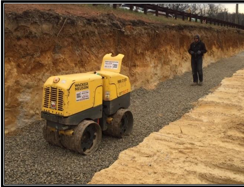
Figure 2: Crew using a walk-behind sheep's foot roller to achieve compaction.