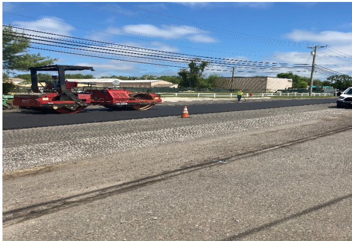
Figure 2&3: 12.5M HMA Top Coat at sections 152-161 per drawings.