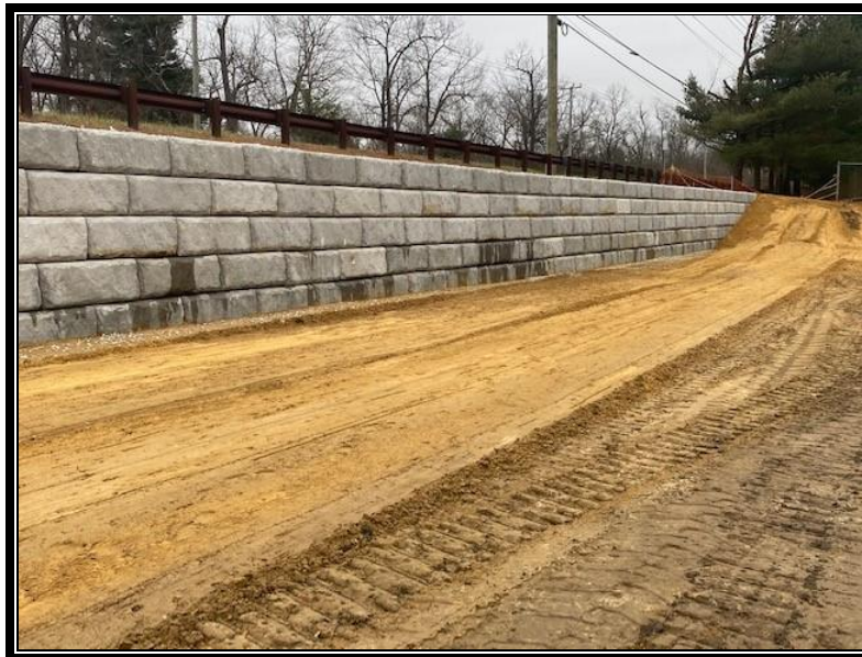
Figure 3: Contractor grading along the front of the REDI-ROCK retaining wall.