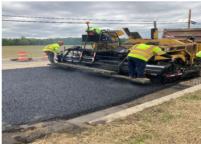
Figure 2&3: Hot Tack is placed down prior to Hot Mix Asphalt.