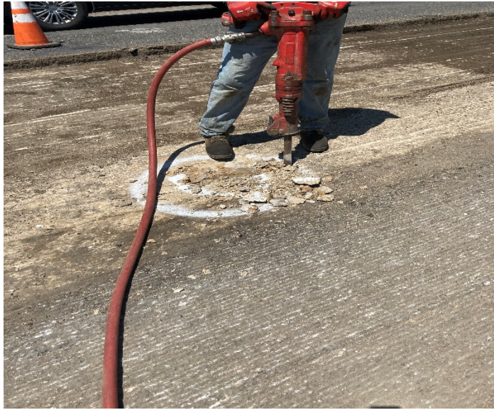
Figure 3: A test patch was removed to identify the material.