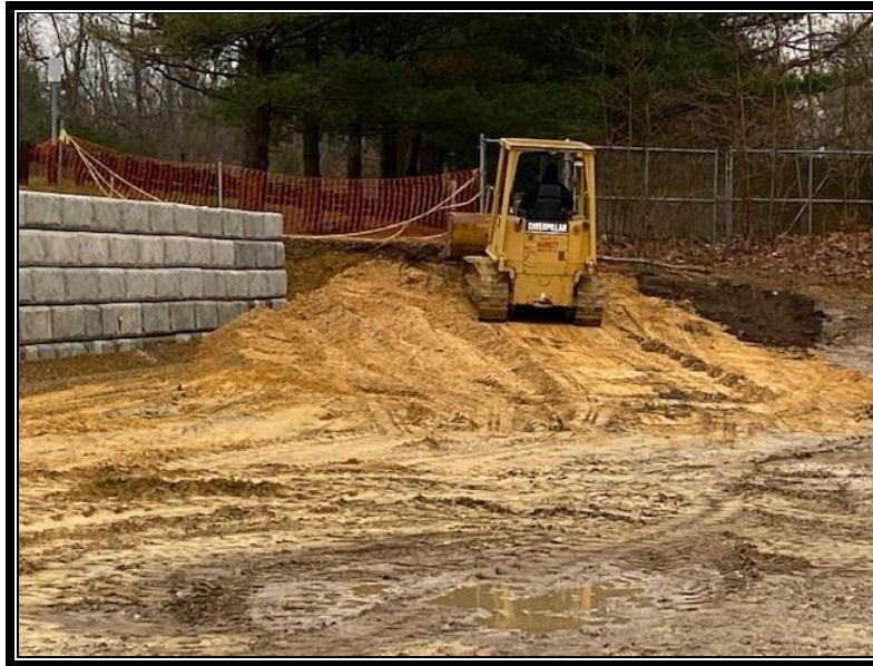
Figure 2: Operator constructing the required slopes at the end of the retaining walls.