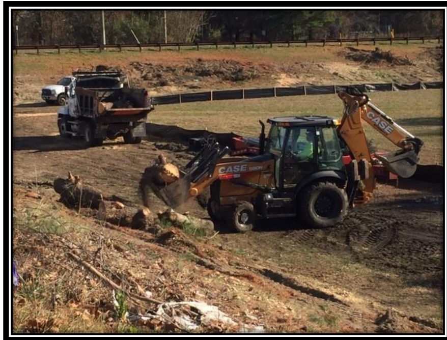
Figure 1: Crew loading out the remaining pine tree trunks and stumps.

Progress Report # 3 Friday, November 22, 2019