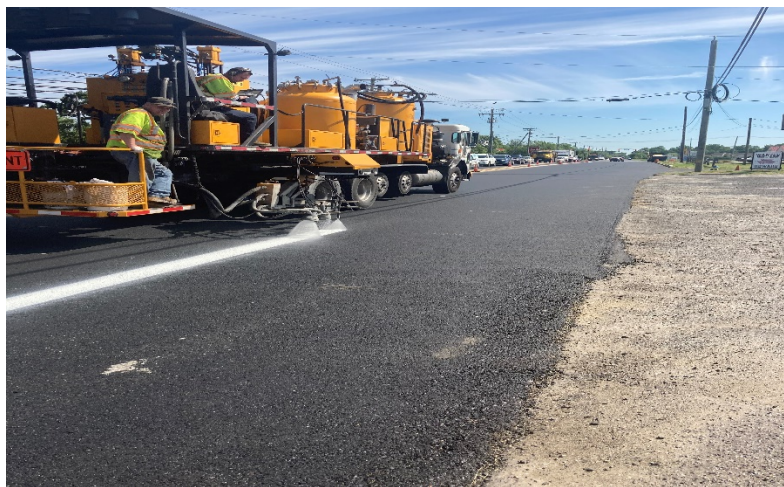
Figure 4&5: Sub-Contractor Zone Striping painting Edge Lines