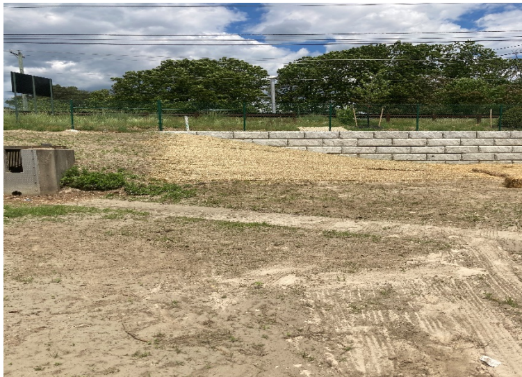
Figure 7: Contractor Seeding and Mulching inside retention Pond