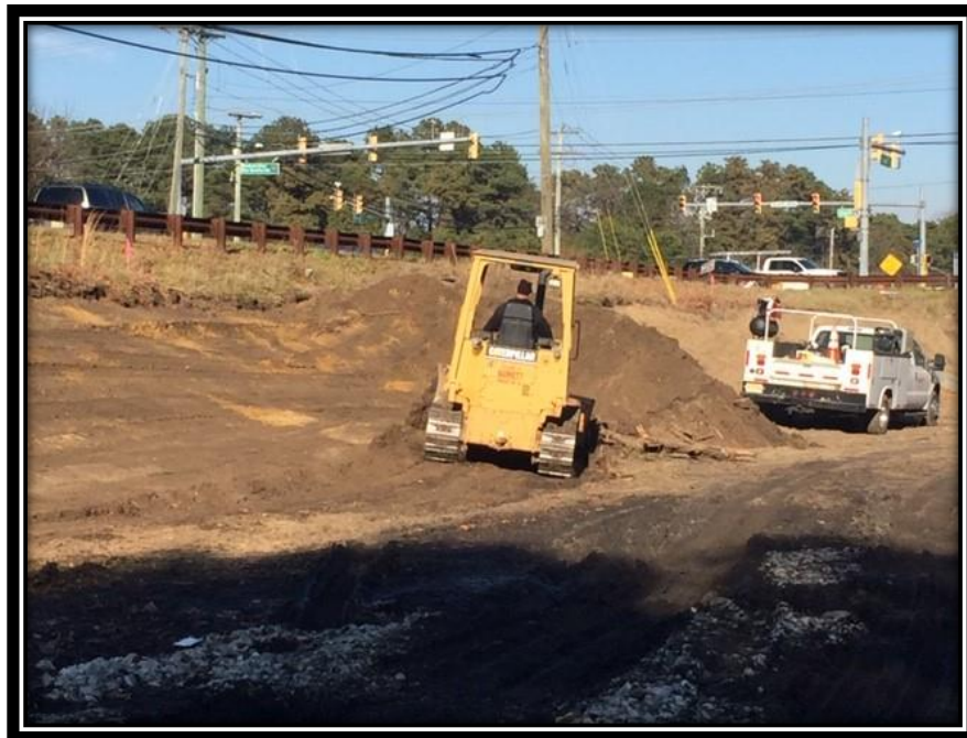
Figure 1: Contractor starting to stripe topsoil using a bull dozer.

Progress Report # 4 Friday, November 29, 2019