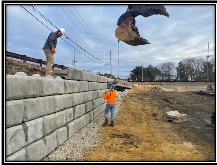
Figure 1: Contractor installing the REDI-ROCK cap block on the west retaining wall.

Progress Report #10 Friday, January 10, 2020