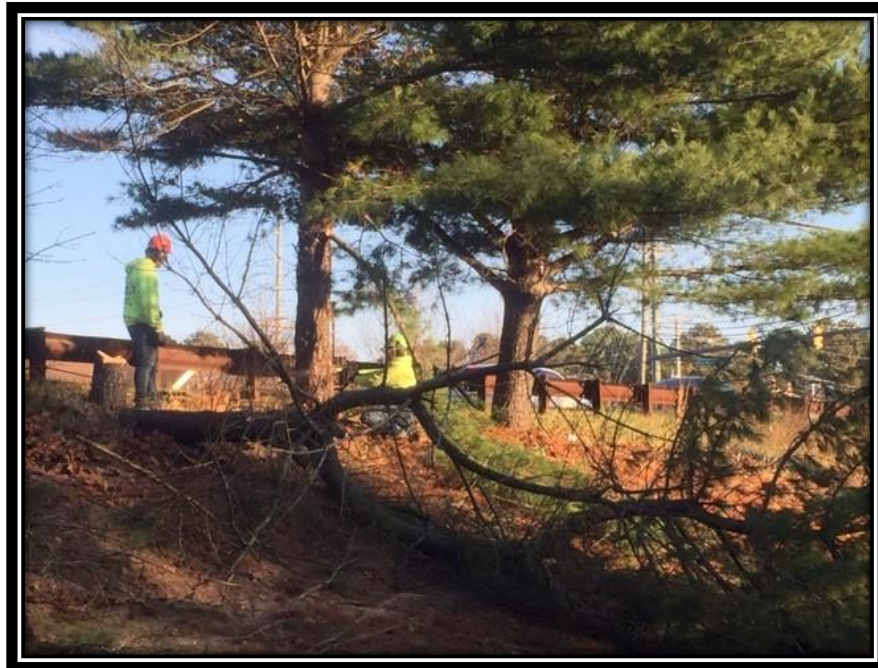
Figure 1: Crew falling trees

Progress Report # 2 Friday, November 15, 2019