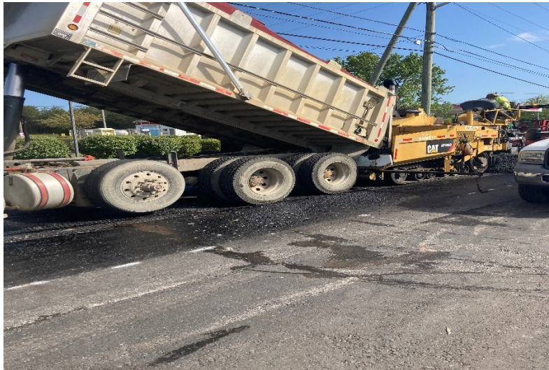
Figure 4: 12.5M HMA Intermediate on Southbound section 155-161.