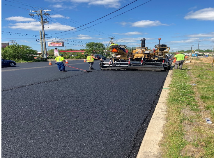
Figure 4: 12.5M HMA Top Coat on Northbound section 170-180.