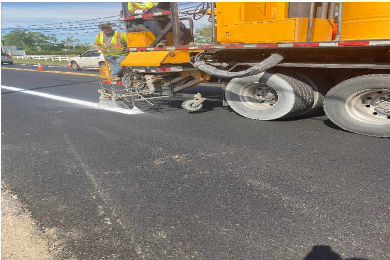
Figure 2&3: Sub-Contractor Zone striping painting Center and Edge Lines