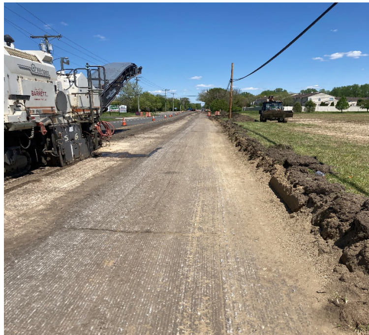
Figure 2&3: Contractor hit cement in the entire roadway except the shoulder after 4" of asphalt was removed.