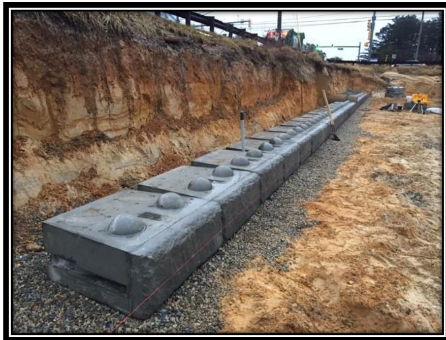
Figure 1: Contractor installing the REDI-ROCK base block on the west retaining wall.

Progress Report #9 Friday, January 3, 2020