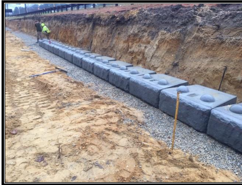
Figure 2: Crew installing the first level of REDI-ROCK retaining wall block..